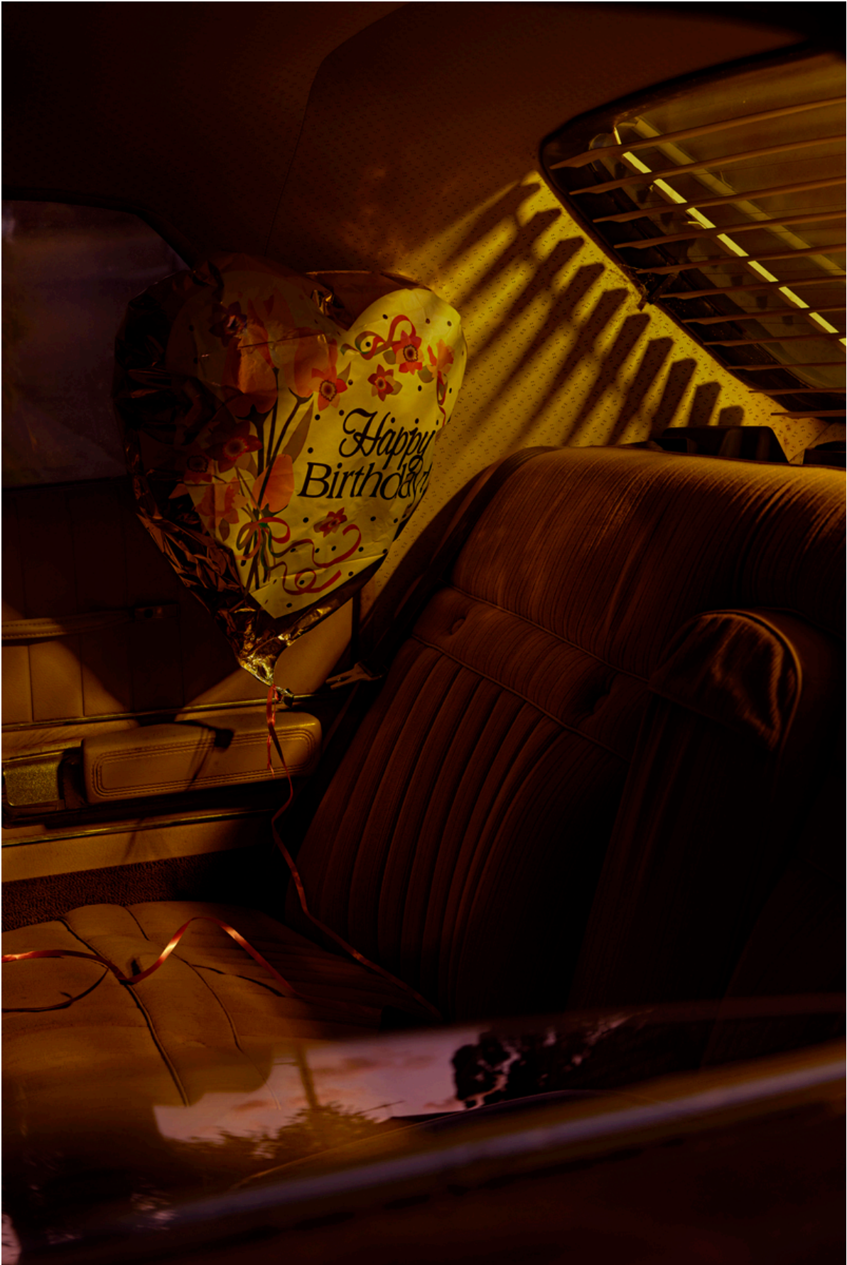
I Waited Too Long, 2024 Photographic pigment print on etching rag