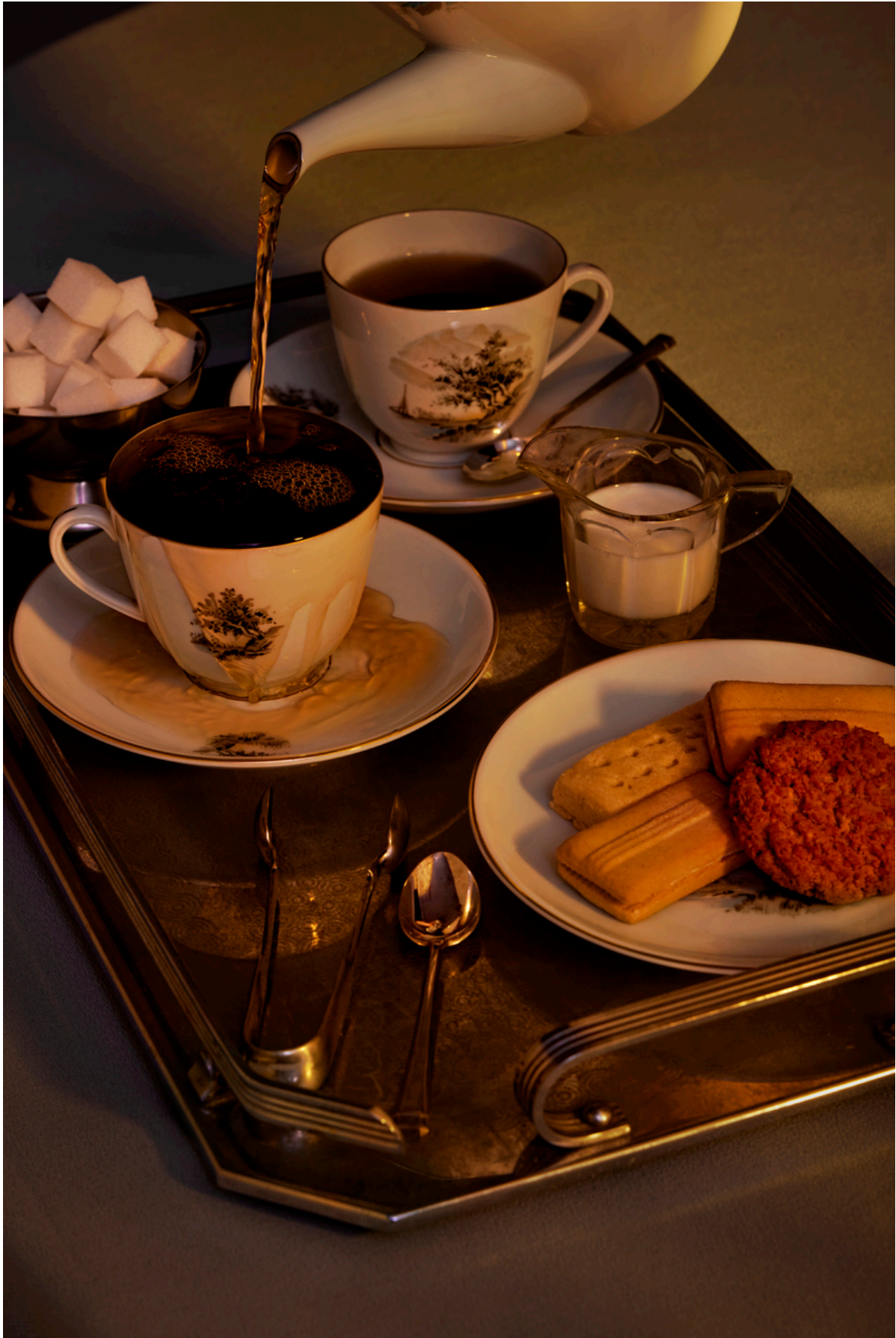
For All that was Left Unsaid, 2024 Photographic pigment print on etching rag