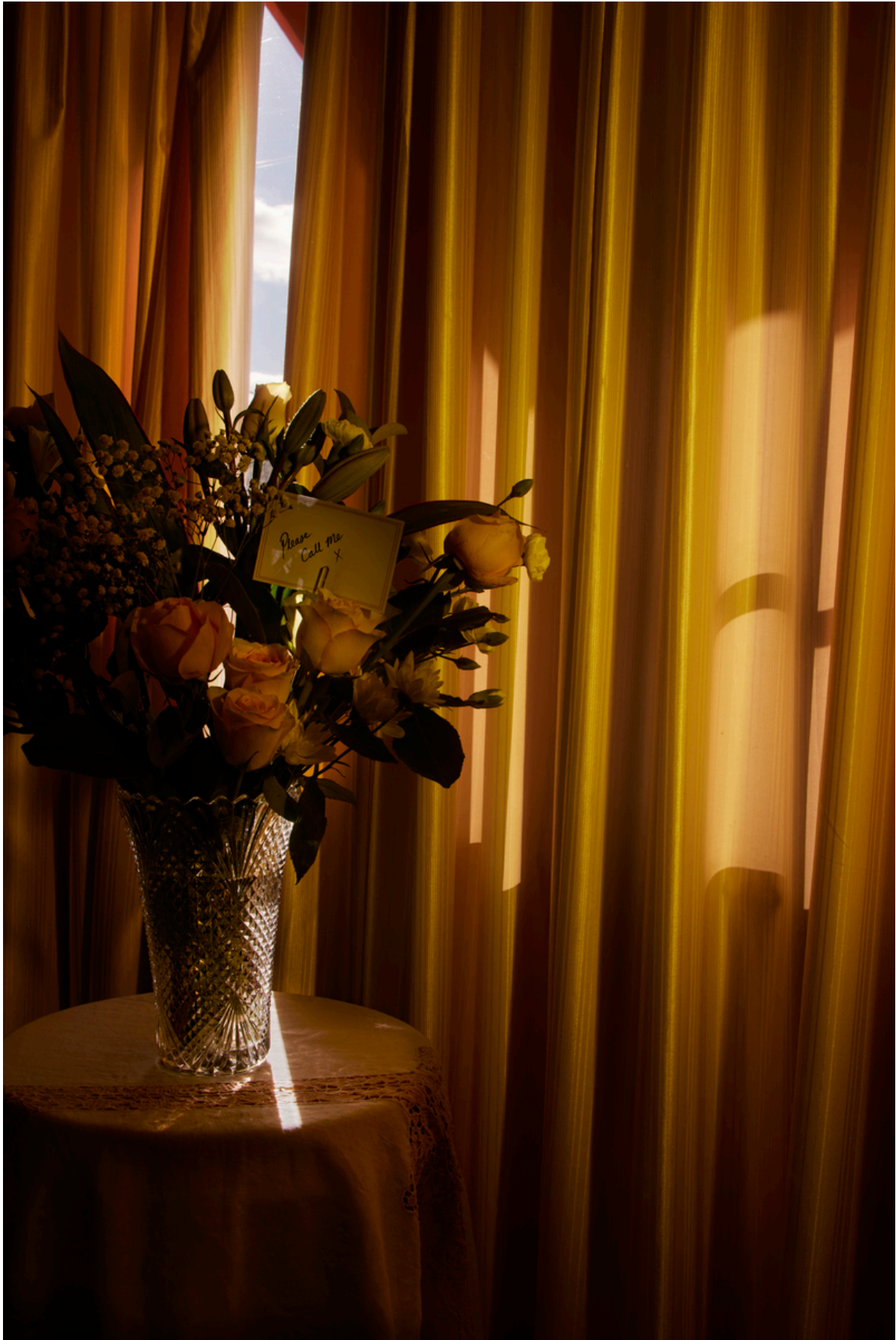
Call Me, 2024 Photographic pigment print on etching rag