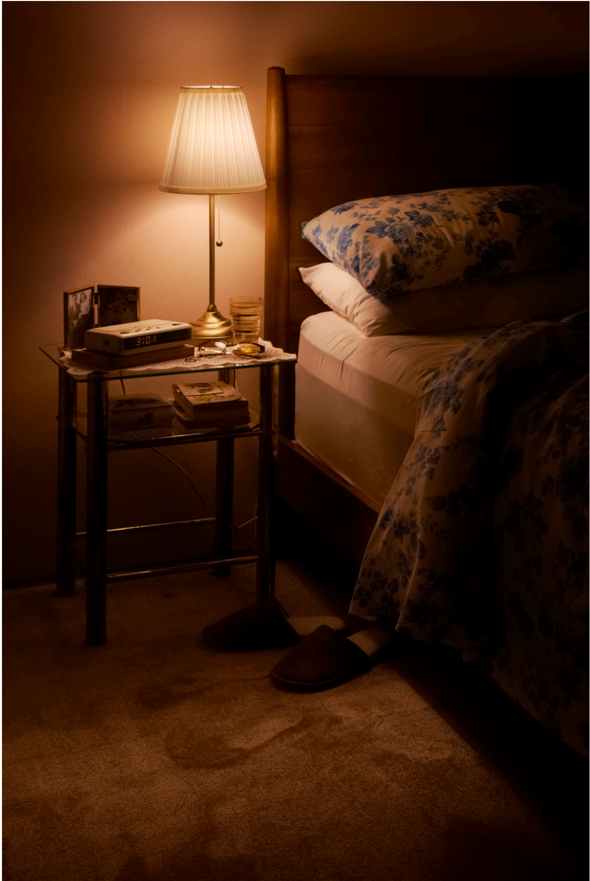
One Minute Past , 2024 Photographic pigment print on etching rag