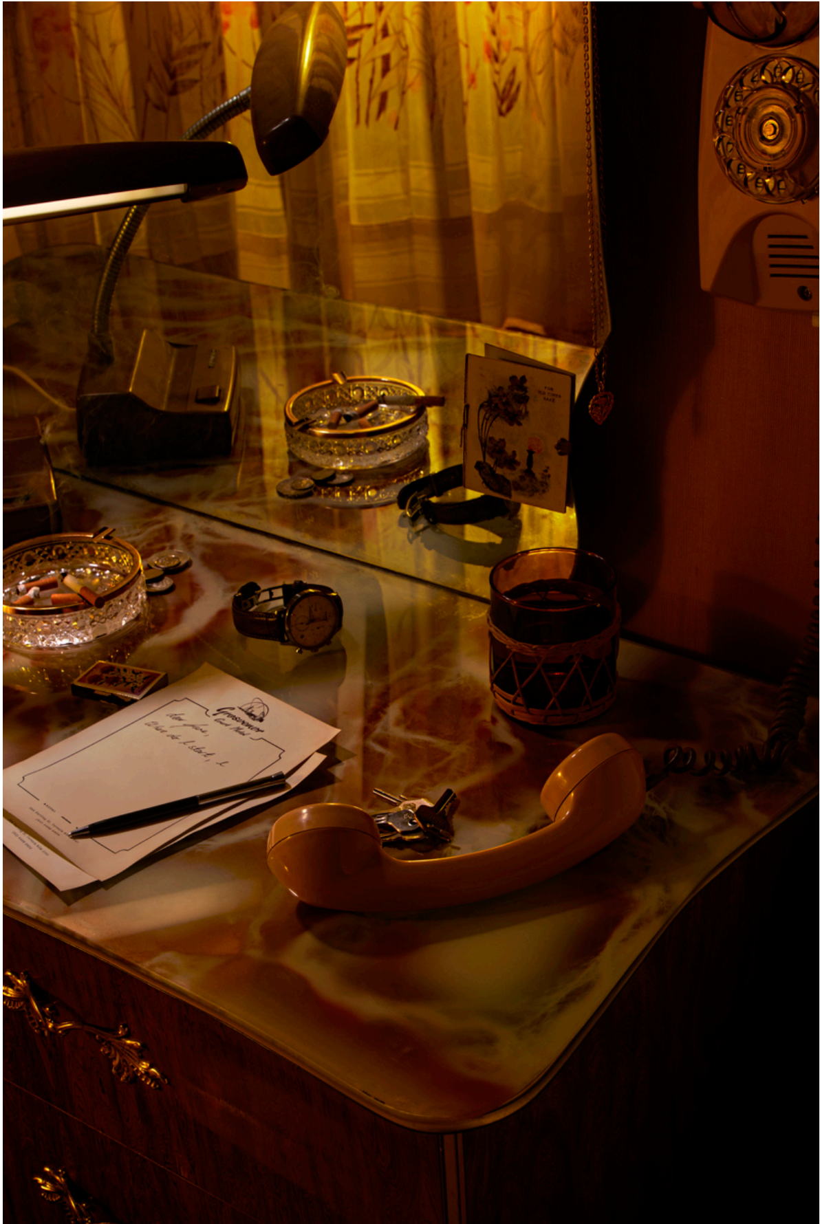
Where Do I Start , 2024 Photographic pigment print on etching rag