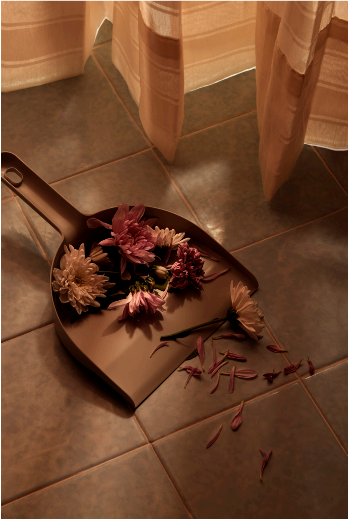
And in the End , 2024 Photographic pigment print on etching rag