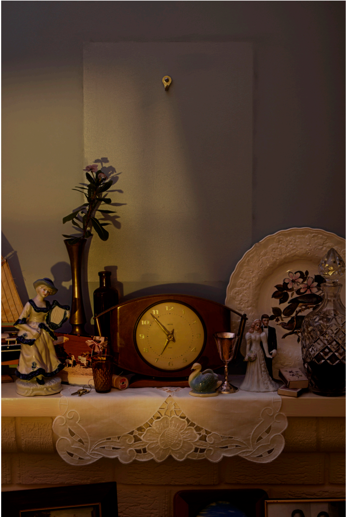
Forget Me Not, 2024 Photographic pigment print on etching rag