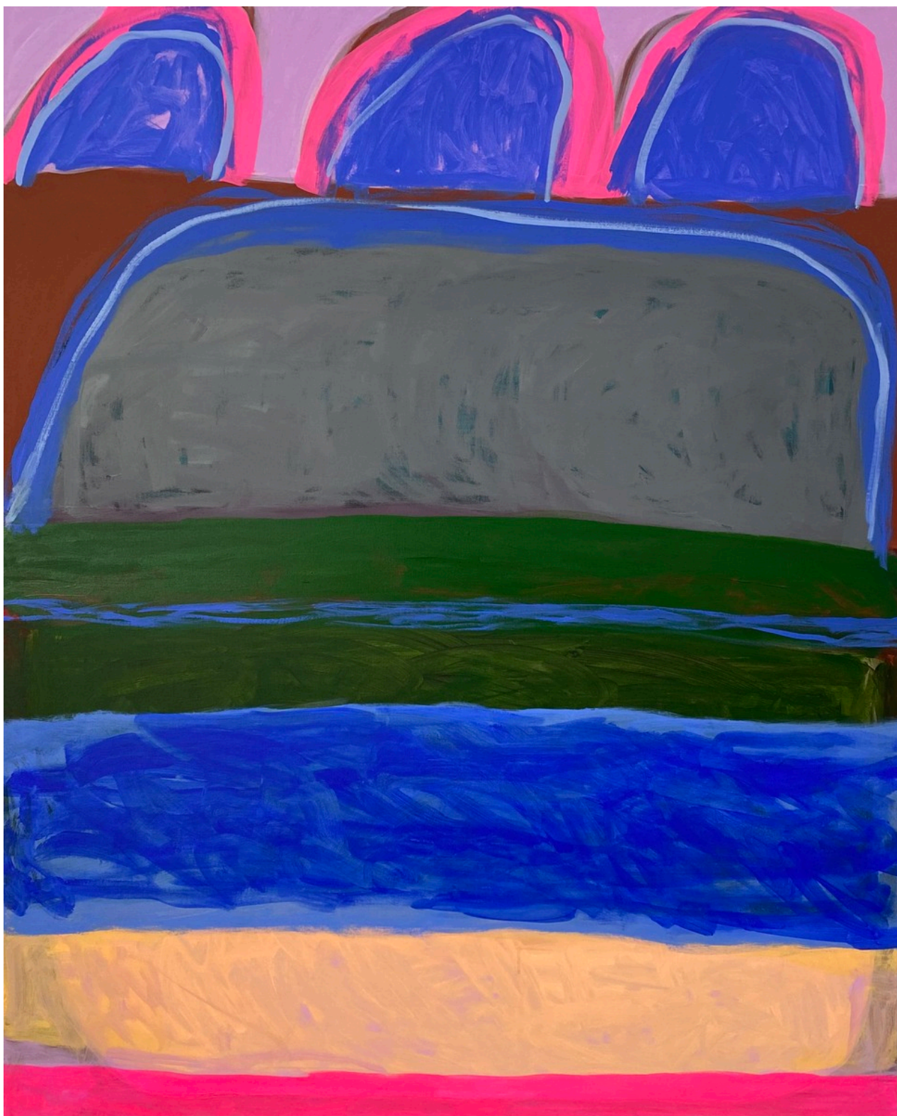
Echo in My Waters, 2024 Acrylic on canvas 141 x 116 x 5 cm Framed in Tasmanian oak $ 5,200