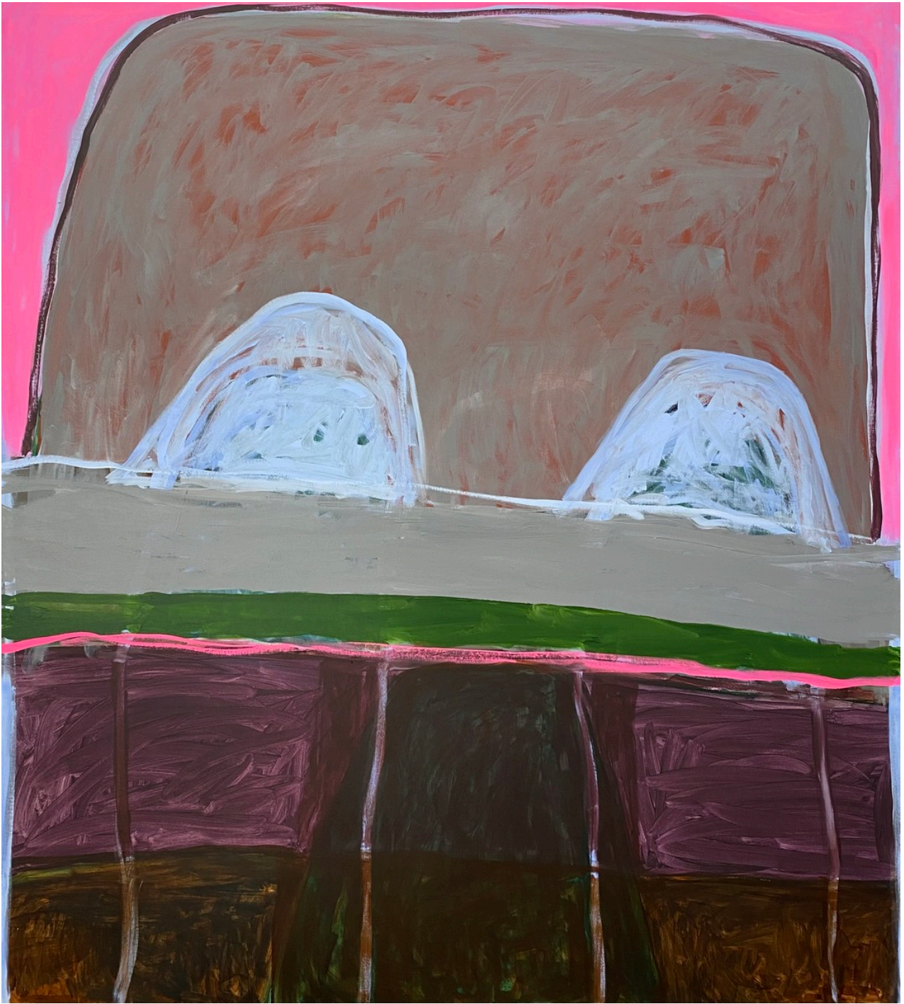
Mother Court, 2024 Acrylic on canvas 156 x 141 x 5 cm Framed in Tasmanian oak $ 6,500