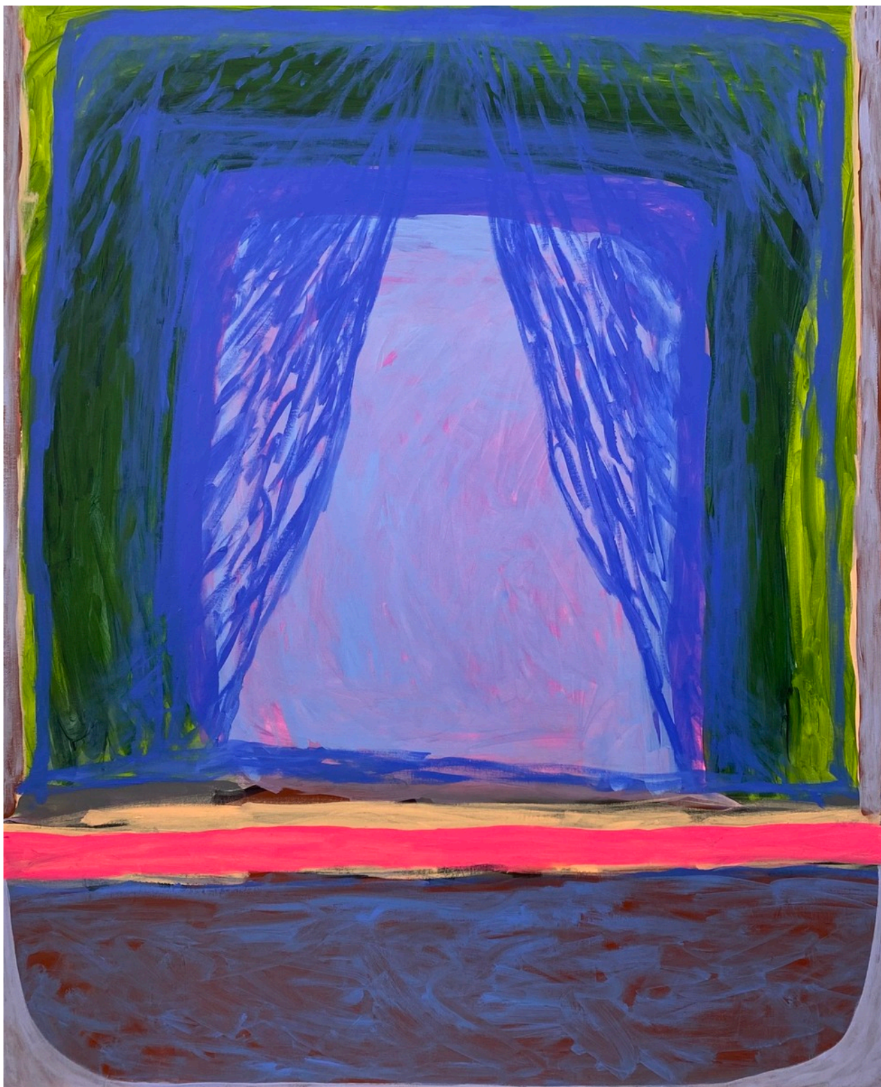
Ready to Emerge , 2024 Acrylic on canvas 141 x 116 x 5 cm Framed in Tasmanian oak $ 5,200