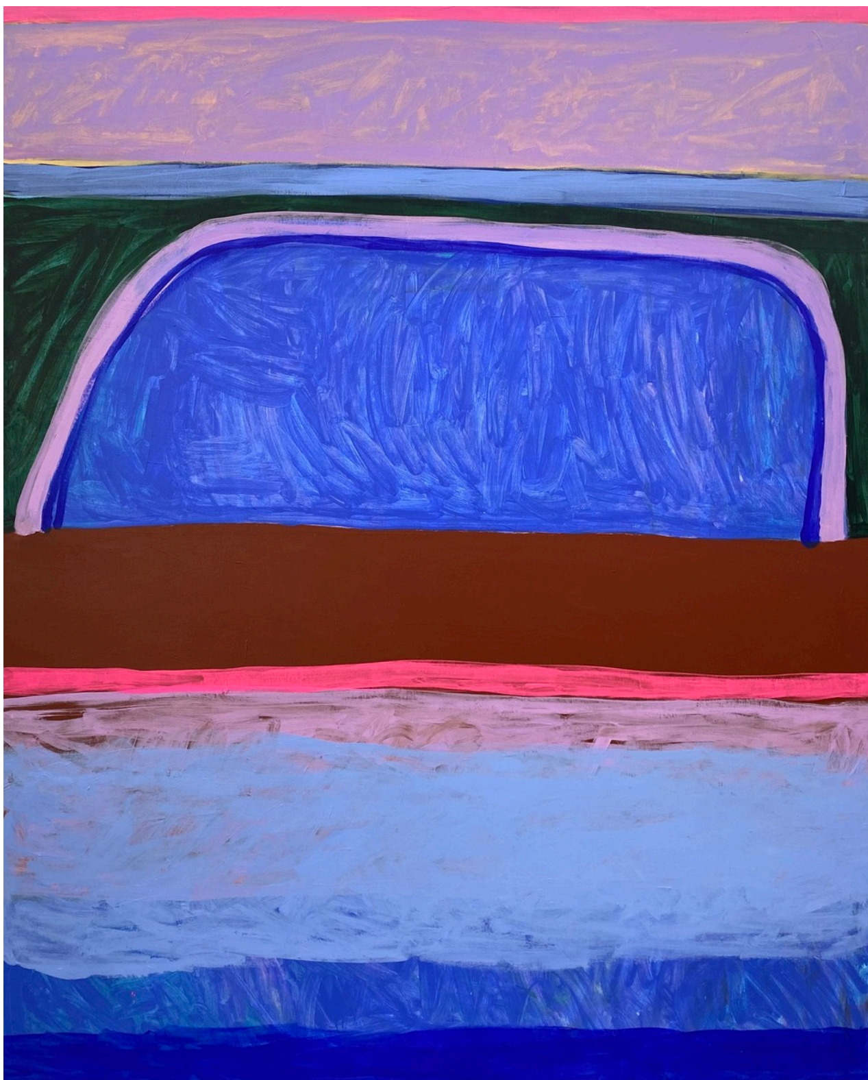
My Waterways, 2024 Acrylic on canvas 141 x 116 x 5 cm Framed in Tasmanian oak $ 5,200