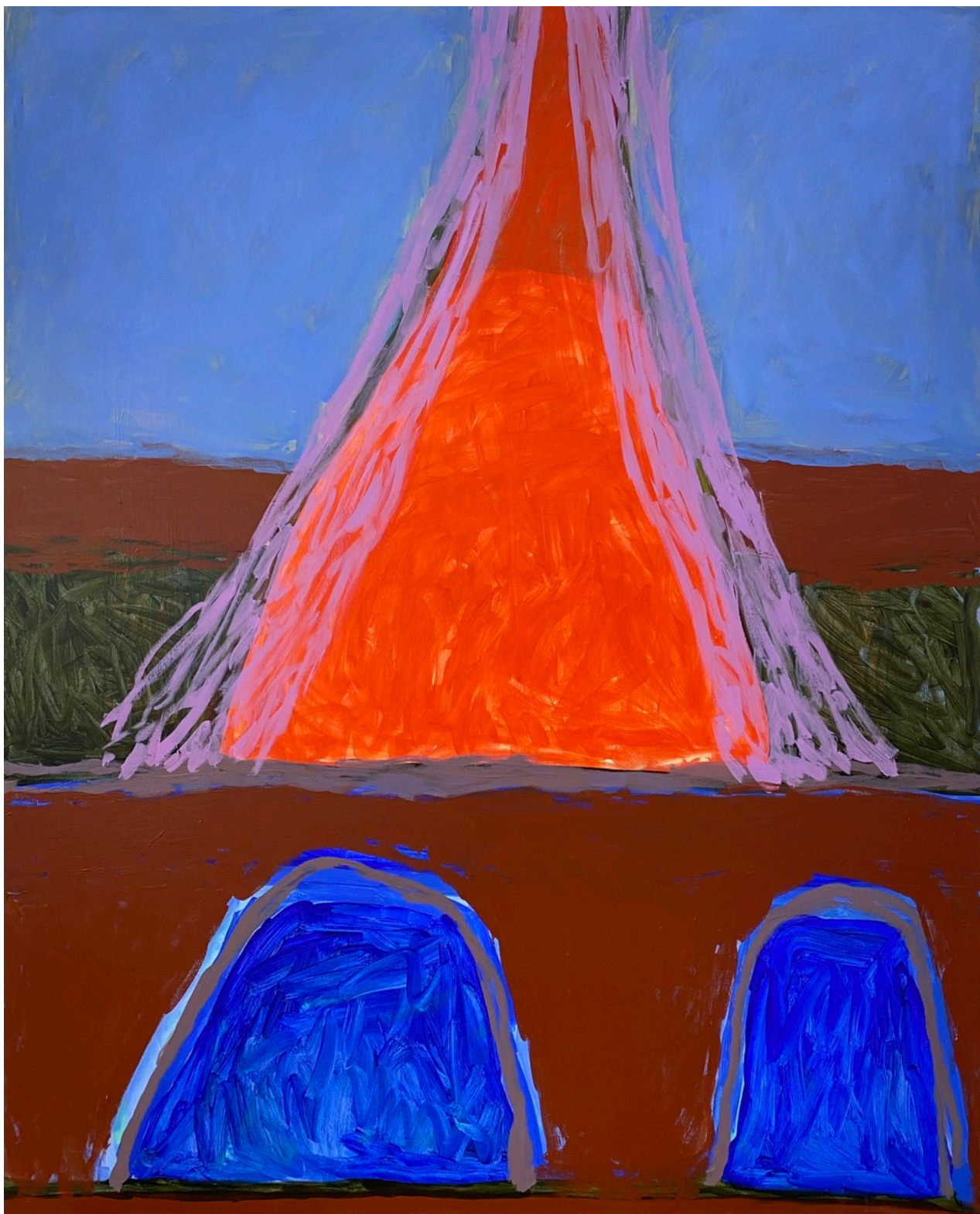
Surrender to Her, 2024 Acrylic on canvas 141 x 116 x 5 cm Framed in Tasmanian oak $ 5,200