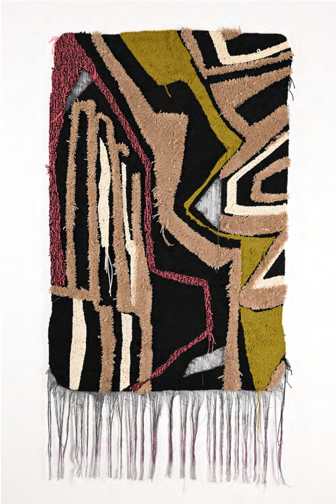
Follow, 2024 Wool on linen 220 x 115 cm $ 5,750