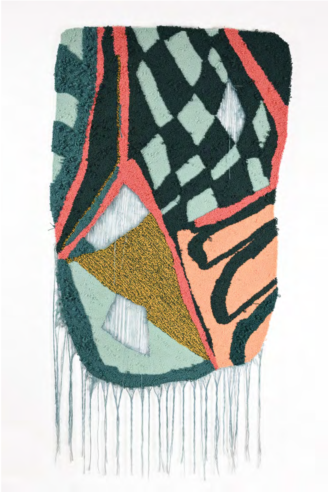
Golden Wattle, 2024 Wool on linen 240 x 130 cm $ 5,750