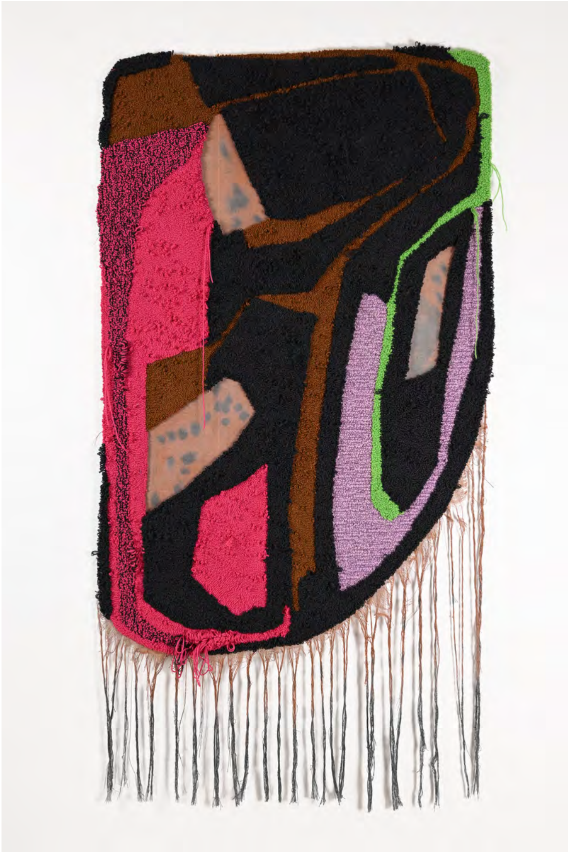
Freddo, 2024 Wool on linen 220 x 115 cm $ 5,750