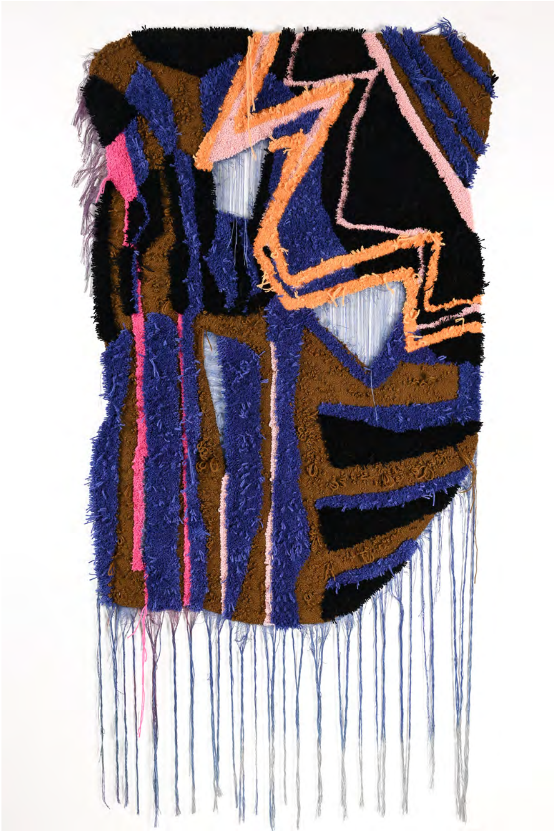
Soft Animal , 2024 Wool on linen 240 x 120 cm $ 5,750