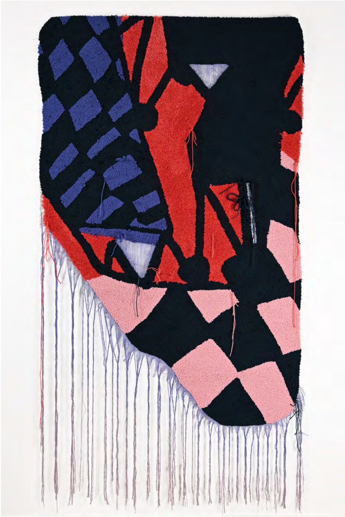
Protection, 2024 Wool on linen 235 x 125 cm $ 5,750