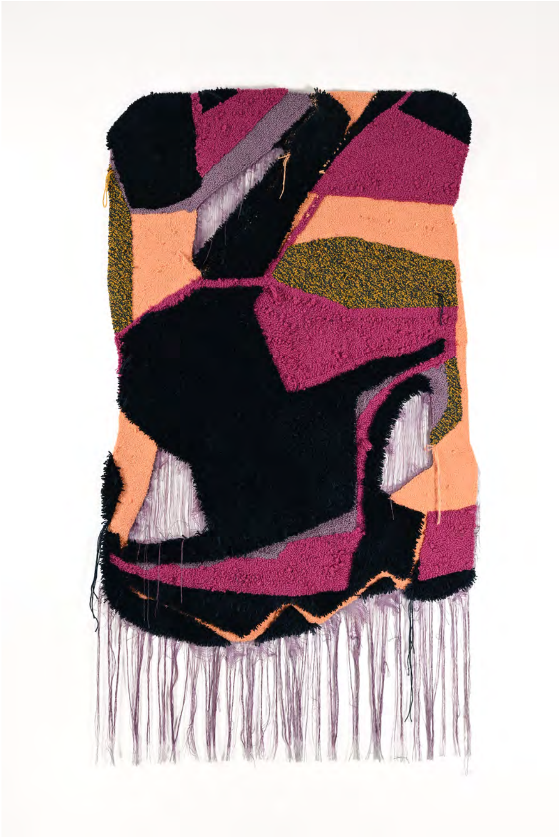
Crush, 2024 Wool on linen 210 x 110 cm $ 5,750