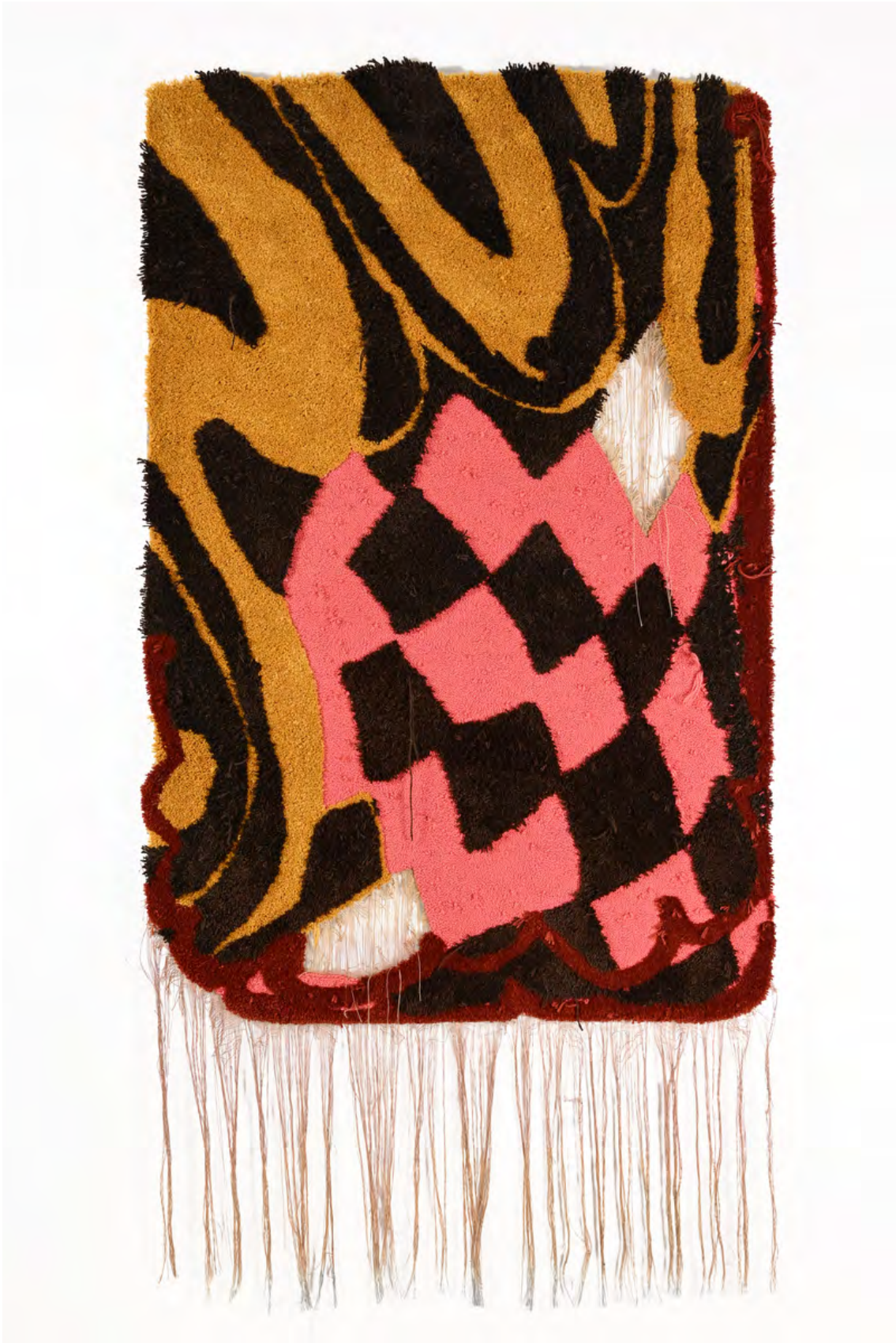
Stage Fright , 2024 Wool on linen 230 x 120 cm $ 5,750