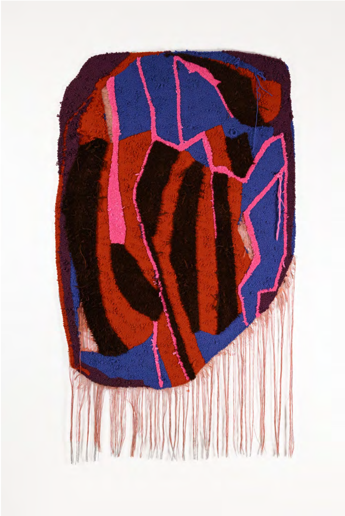
Fruit, 2024 Wool on linen 200 x 120 cm $ 5,750