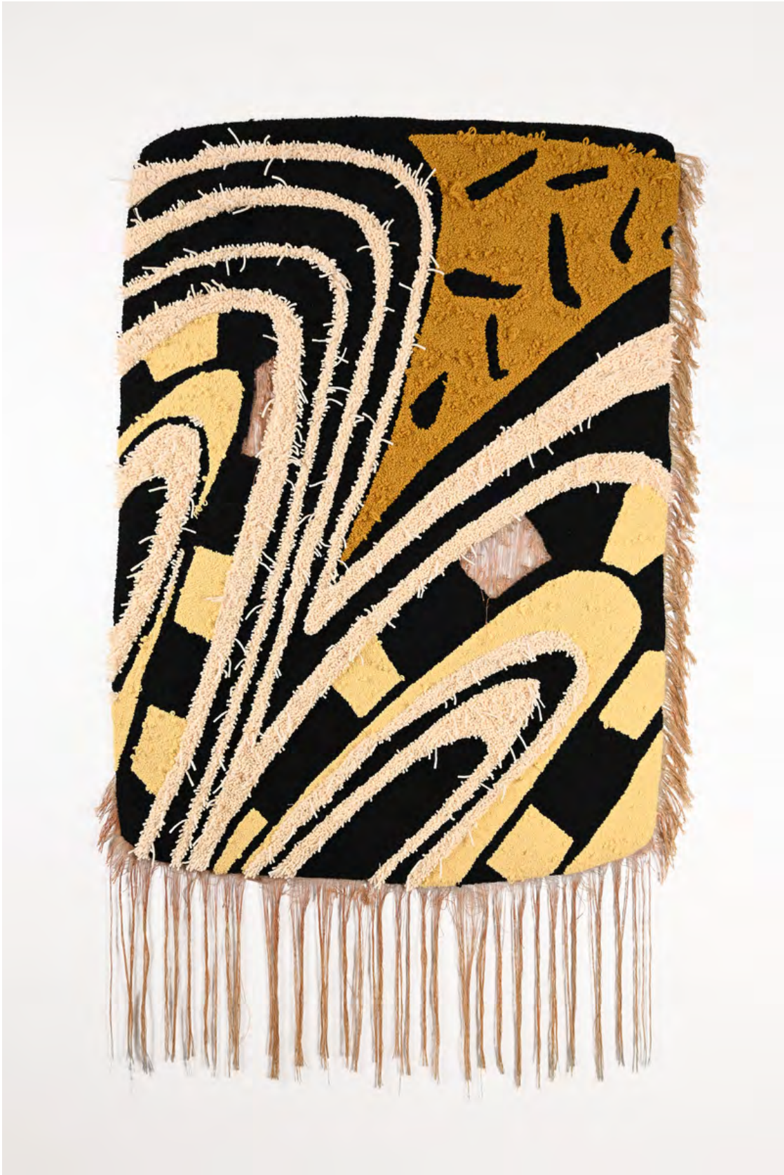
Big Egg , 2024 Wool on linen 220 x 130 cm $ 5,750