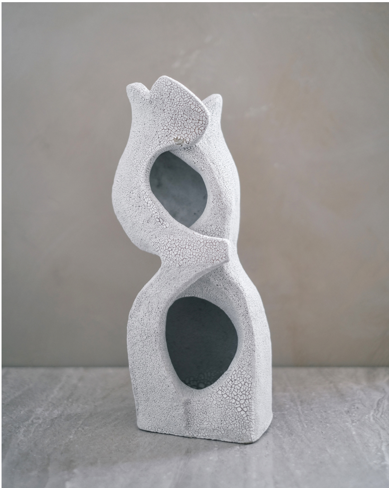
Because A Flower II, 2024 Stoneware, white crackle glaze $ 1,250