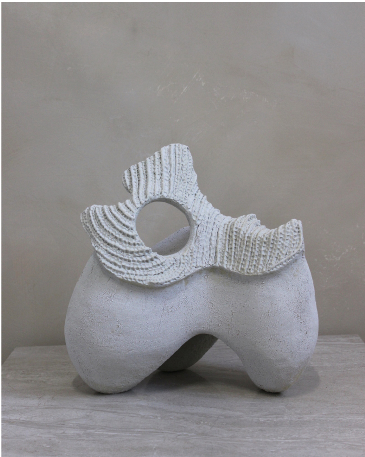
Water Memory II , 2024 Stoneware, ecru crackle glaze $ 1,900