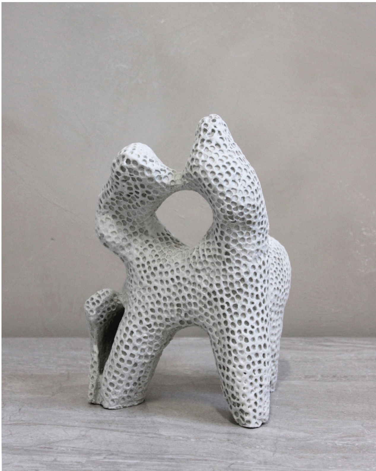
Water Memory I , 2024 Stoneware, matte clear glaze $ 1,350