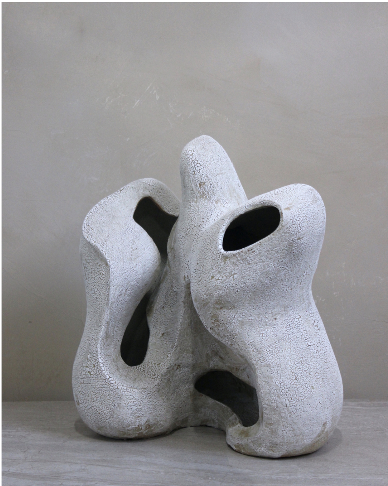
Outside Looking In , 2024 Stoneware, white crackle glaze $ 1,800