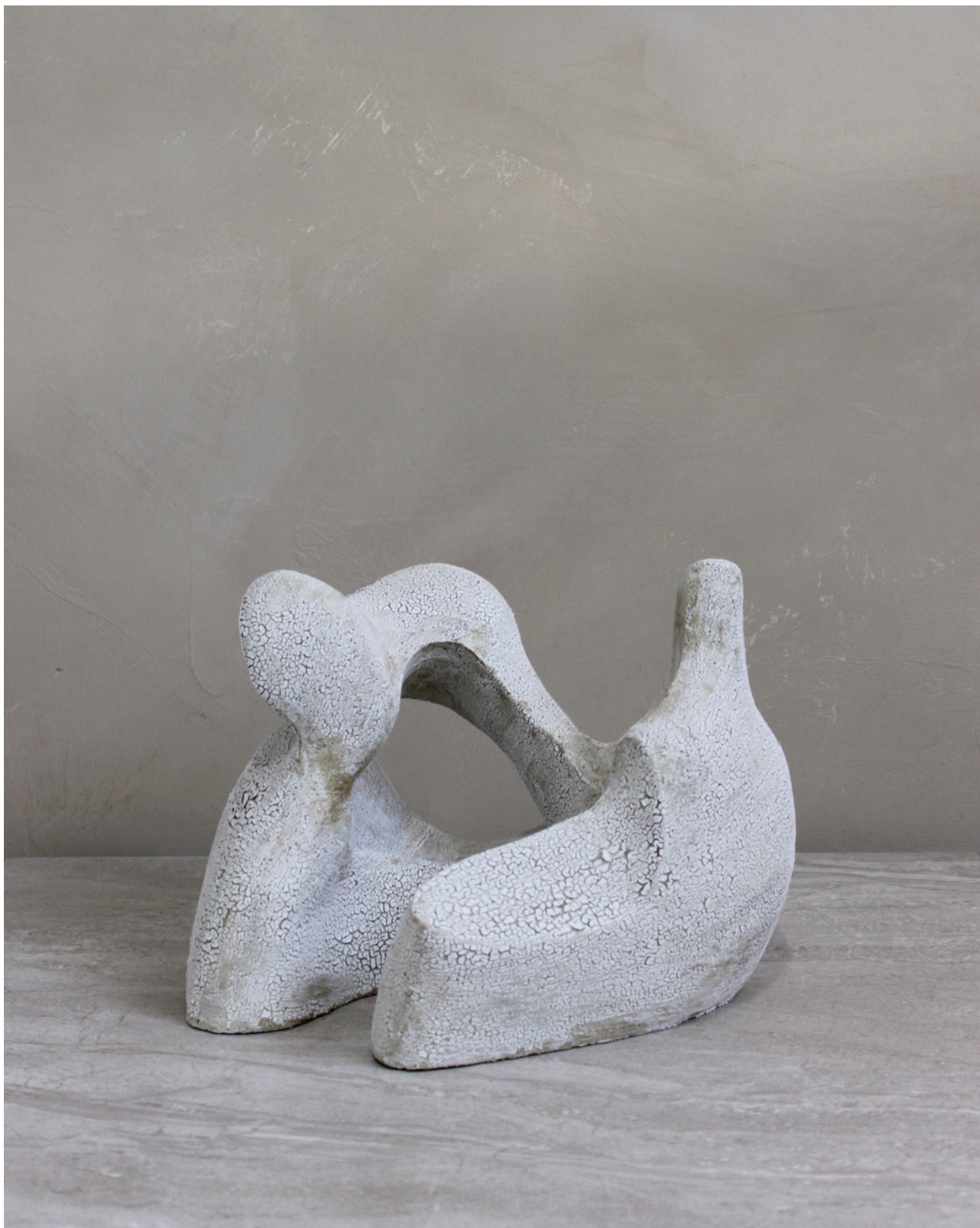
An Exchange Nonetheless, 2024 Stoneware, white crackle glaze $ 1,450