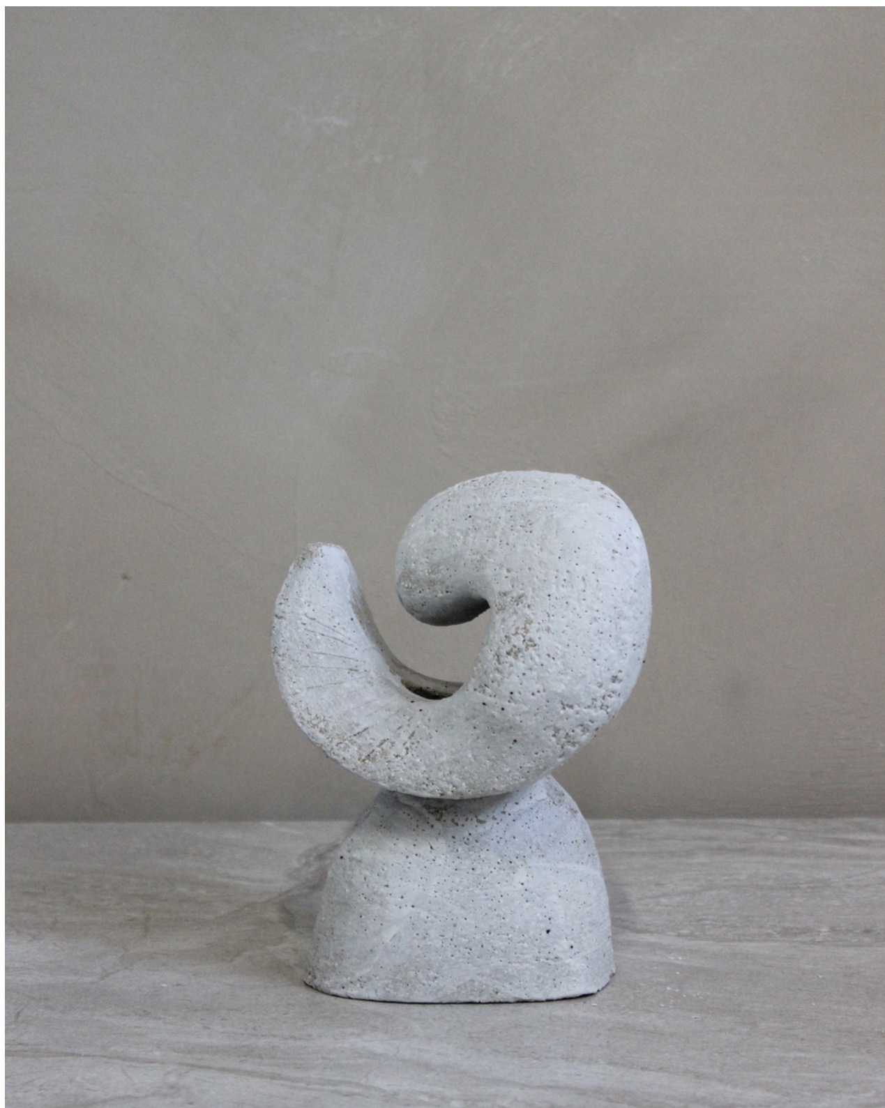
Dawn Chorus, 2024 Stoneware, white porcelain slip $ 850