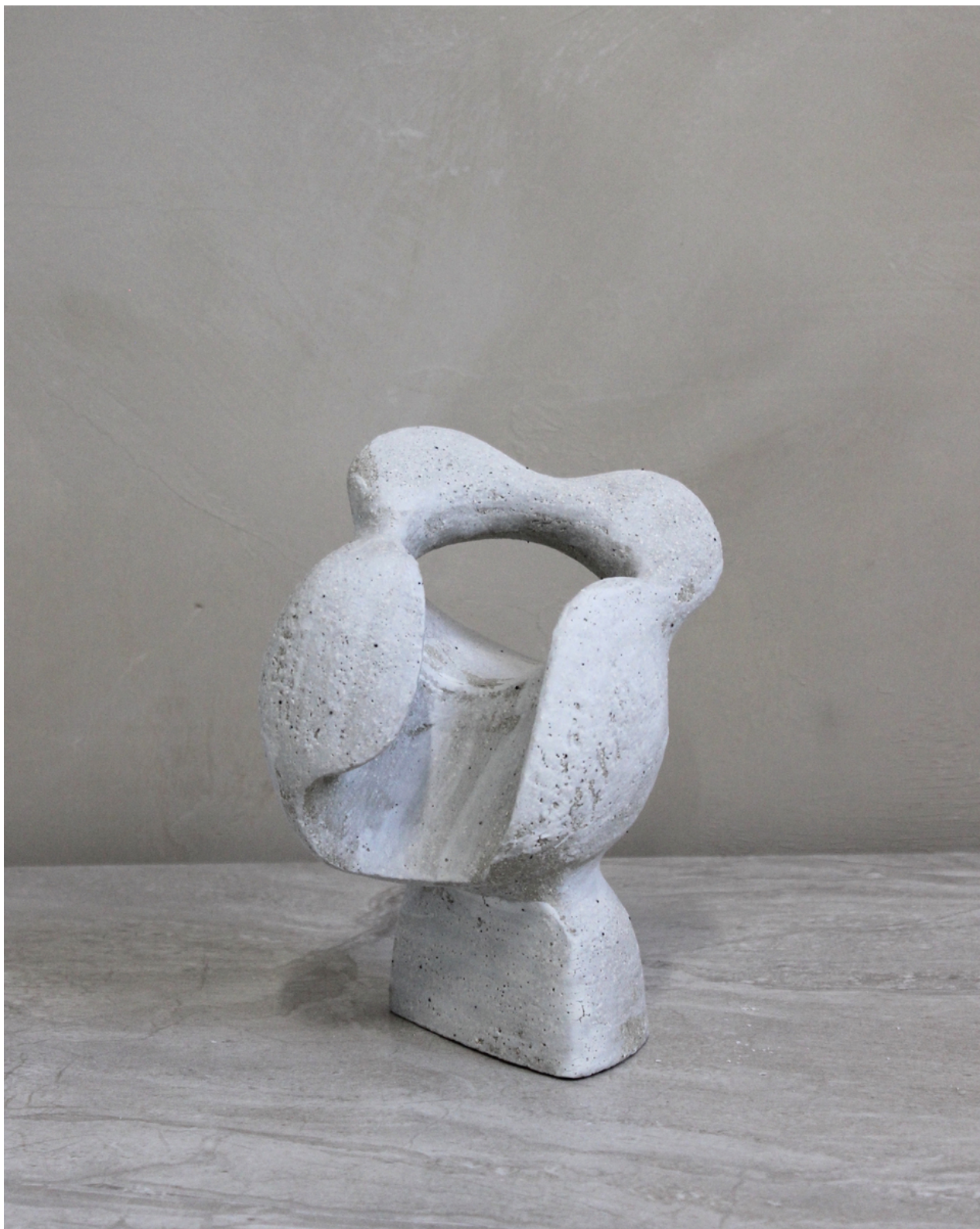
Because A Flower I, 2024 Stoneware, white porcelain slip $ 850