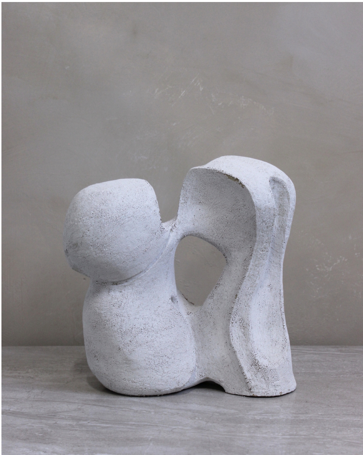
Solitude , 2024 Stoneware, ecru crackle glaze $ 1,450