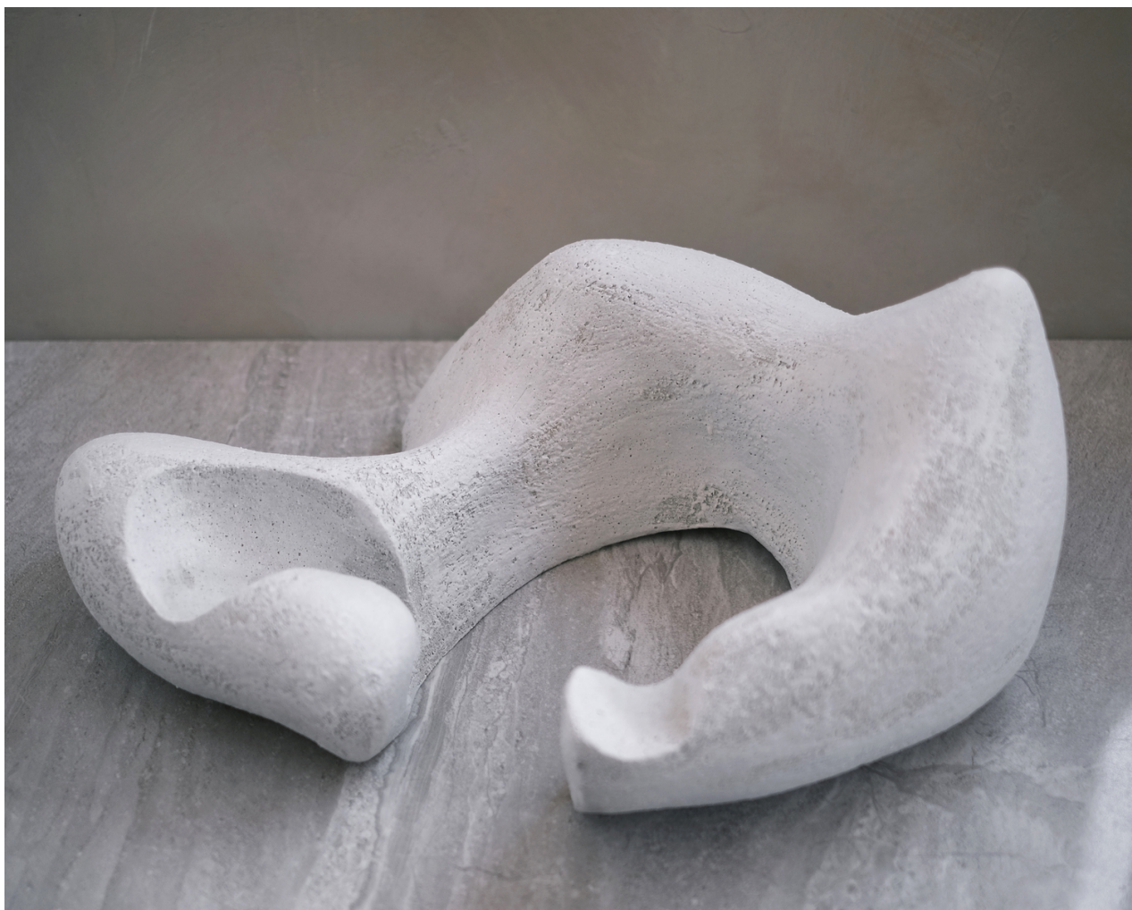
Exhale Retention , 2024 Stoneware clay, porcelain slip $ 1,850