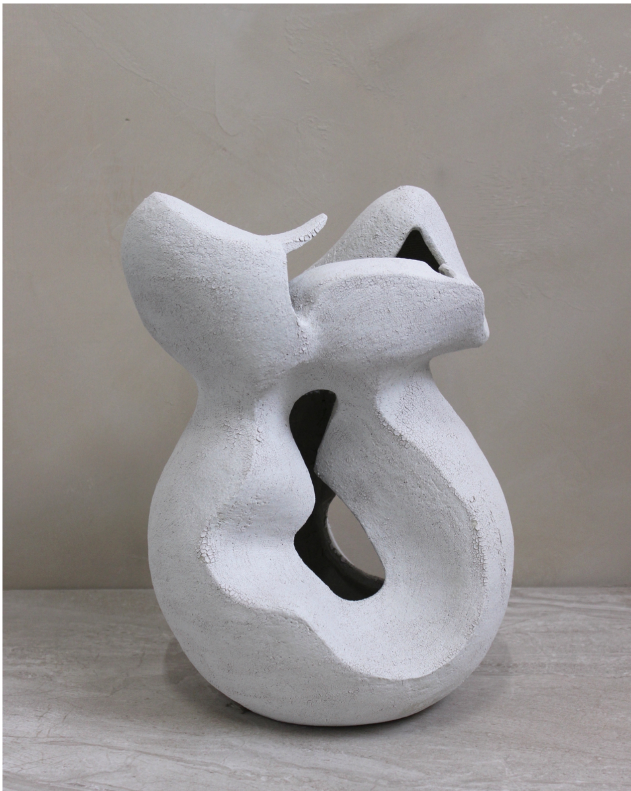
Shifting Winds, 2024 Stoneware, ecru crackle glaze $ 1,650