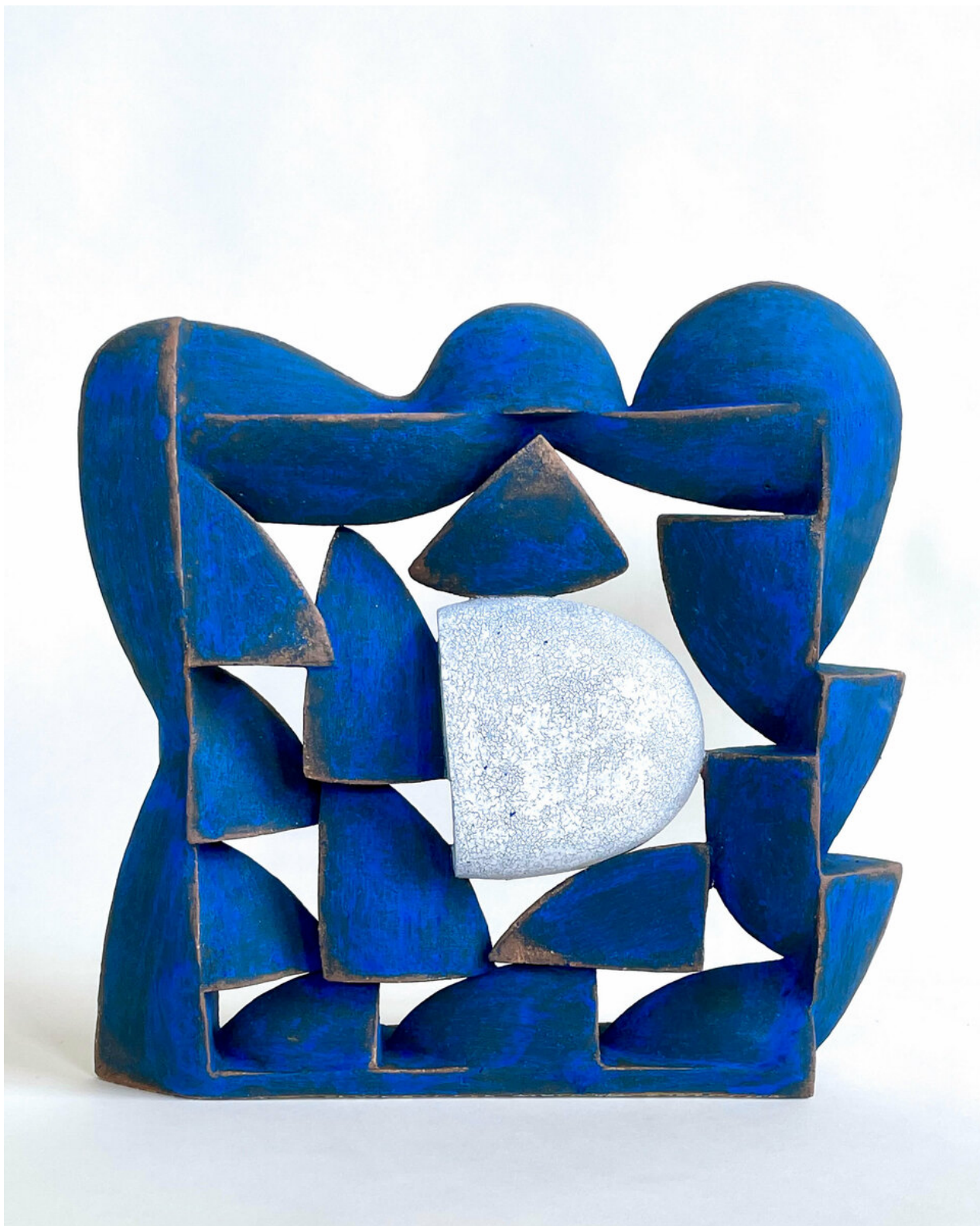
The Salt Water Cure , 2024

Stoneware, slip, terra sigillata, blue wash, black wash, acrylic