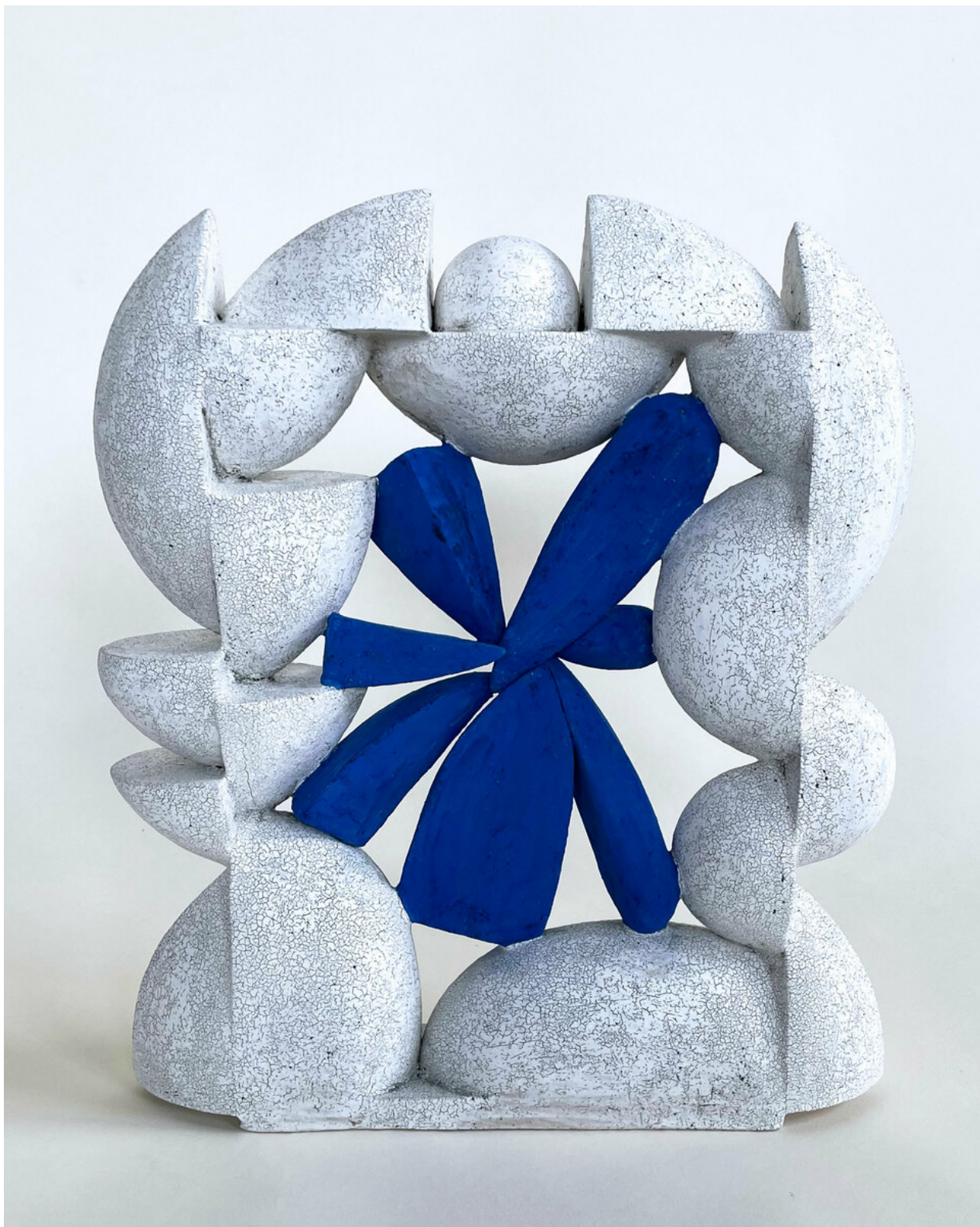
What We Lost Can Still Be Found, 2024 Stoneware, terra sigillata, black wash, blue wash 35.6 x 30.5 x 7.6 cm $ 4,500