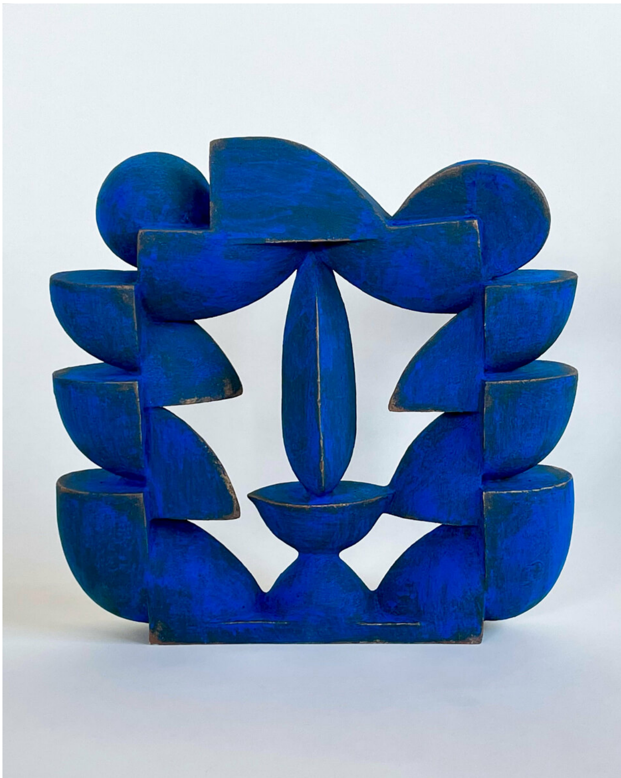
The First One of Your Kind, 2024 Stoneware, slip, blue wash 35.5 x 35.9 x 10.2 cm $ 4,500