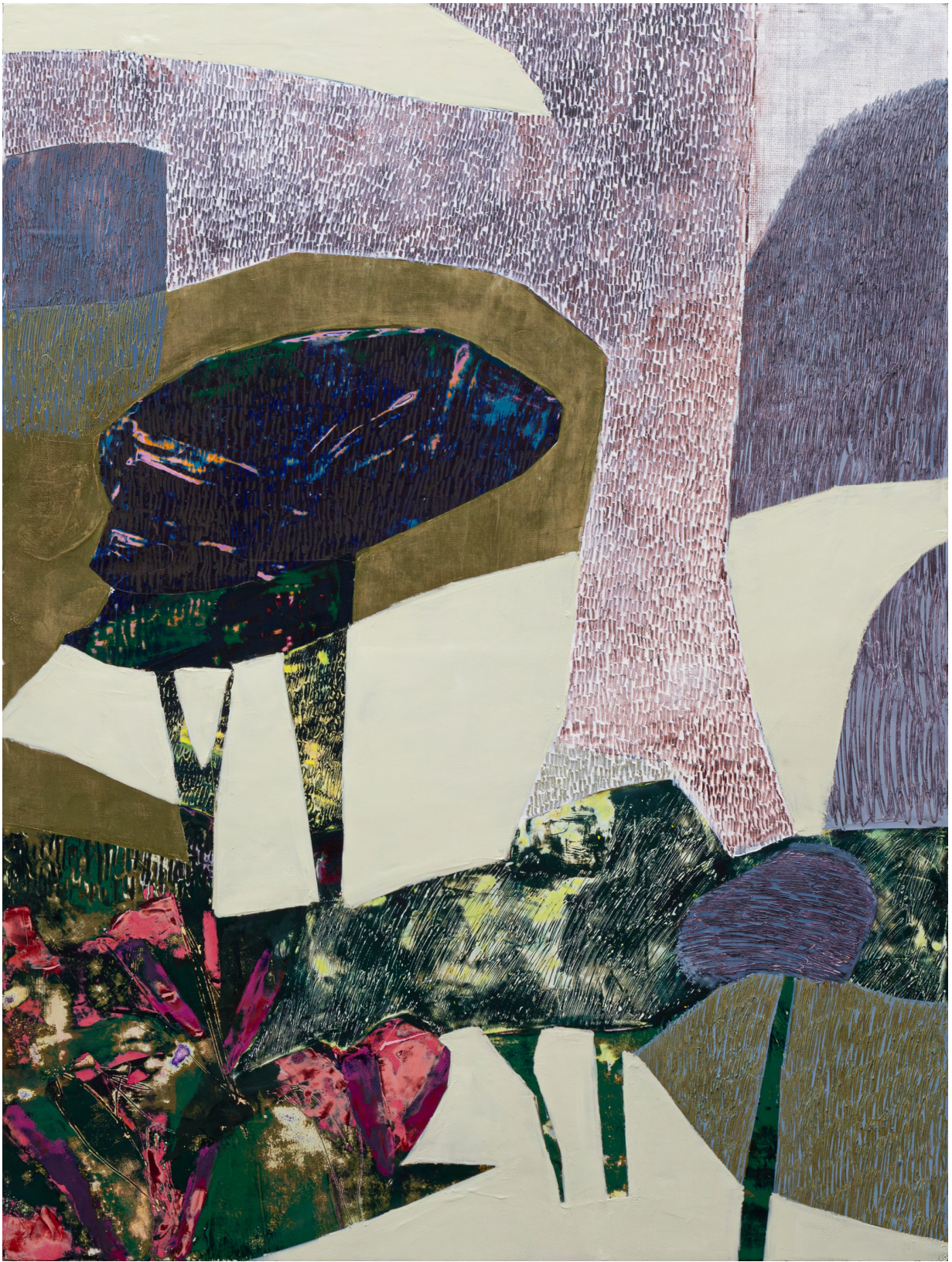
Barefoot Bear Hunt, 2024 Oil + cold wax on panel 122cm H x 92cm W Framed in dark timber $4600