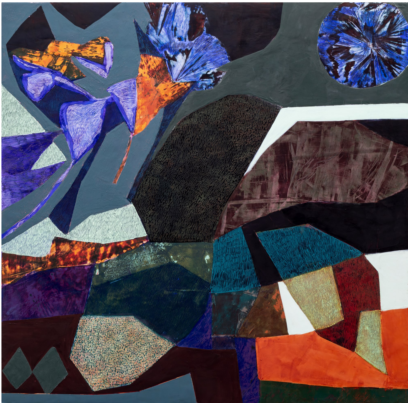
Terrarium , 2024 Oil + cold wax on panel 122cm H x 122cm W Framed in dark timber $5200