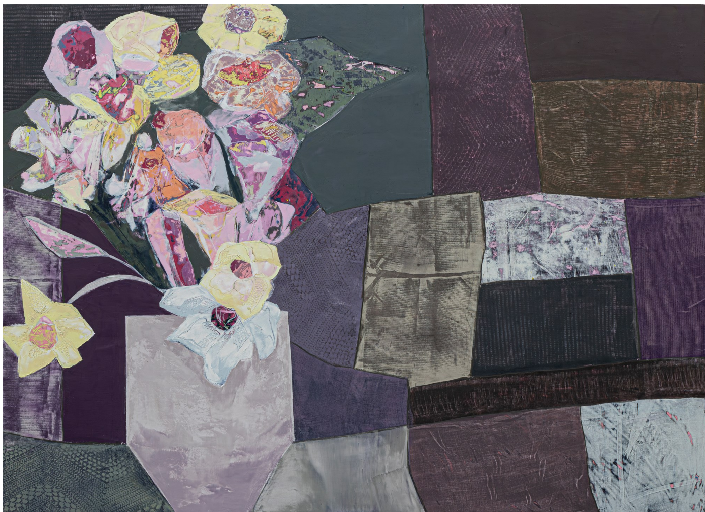
I Bought Myself Flowers, 2024 Oil + cold wax on panel 102cm H x 142cm W Framed in dark timber $4900