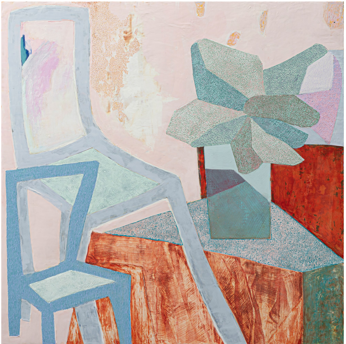
An Invitation to Sit with Self, 2024 Oil + cold wax on panel 152cm H x 152cm W Framed in dark timber $6400