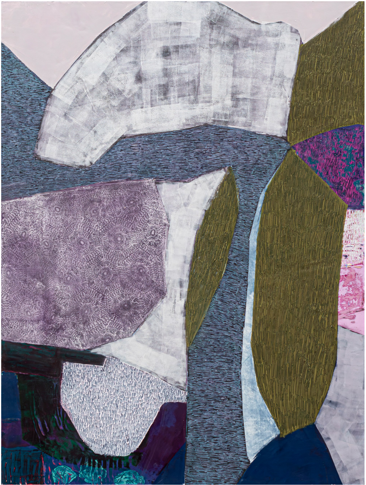
Checkpoint , 2024 Oil + cold wax on panel 122cm H x 92cm W Framed in dark timber $4600