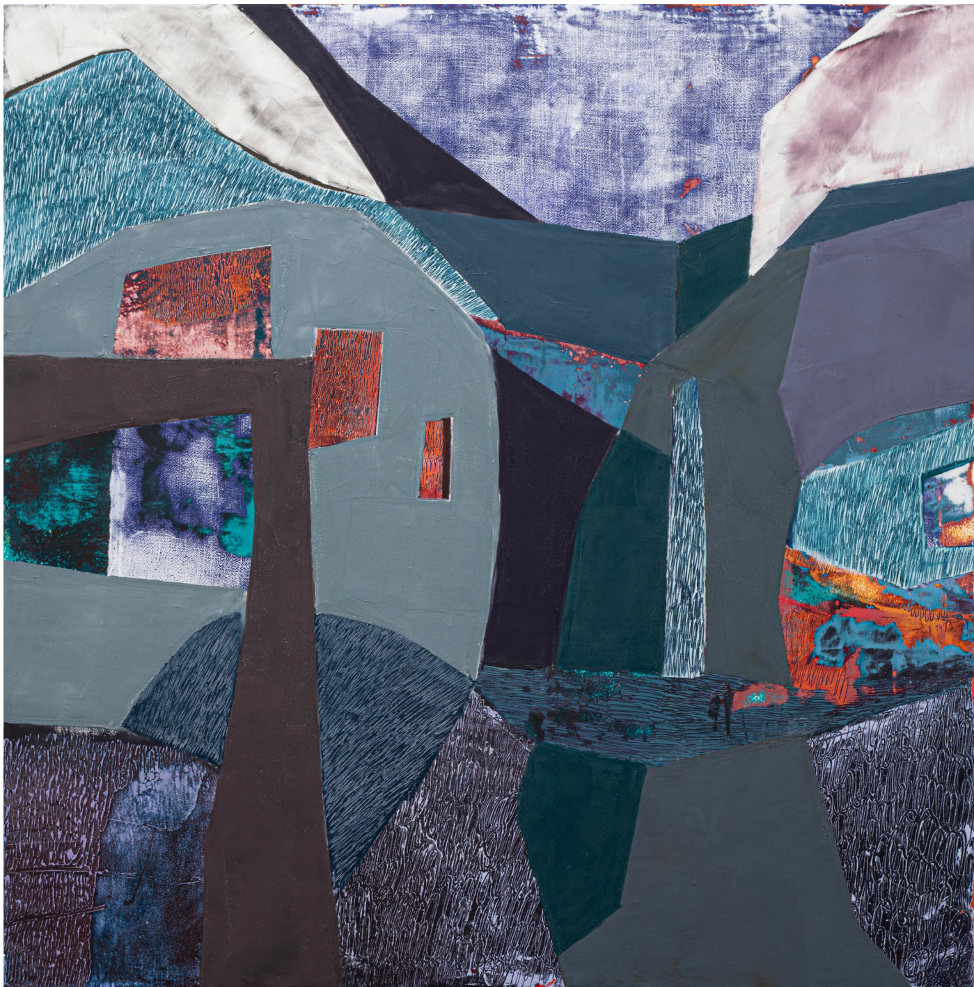
Whispers in the Trees, 2024 Oil + cold wax on panel 82cm H x 82cm W Framed in dark timber $2900