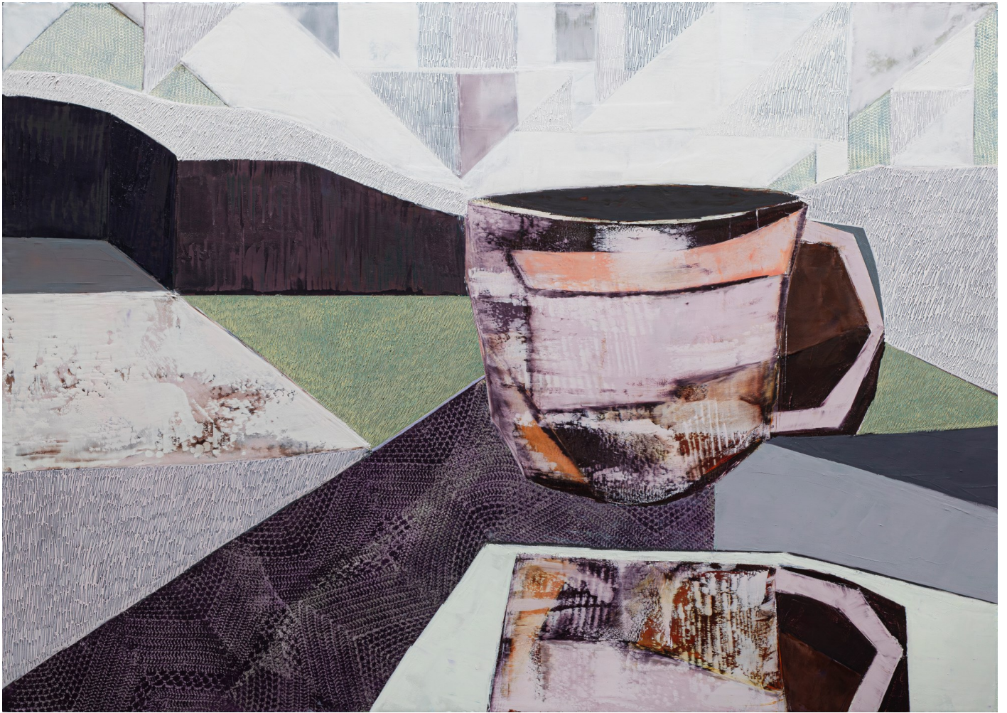
Reflections of an Empty Cup, 2024 Oil + cold wax on panel 102cm H x 142cm W Framed in dark timber $4900