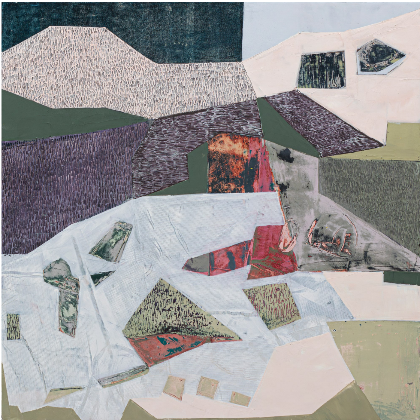
Parts of a Whole , 2024 Oil + cold wax on panel 82cm H x 82cm W Framed in dark timber $2900