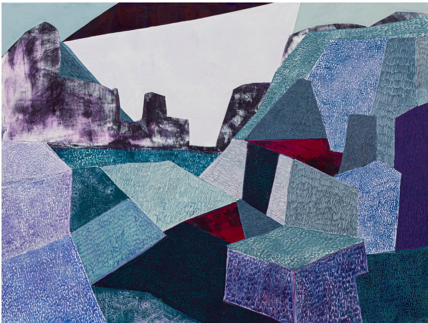
Marking Time, 2024 Oil + cold wax on panel 92cm H x 122cm W Framed in dark timber $4600