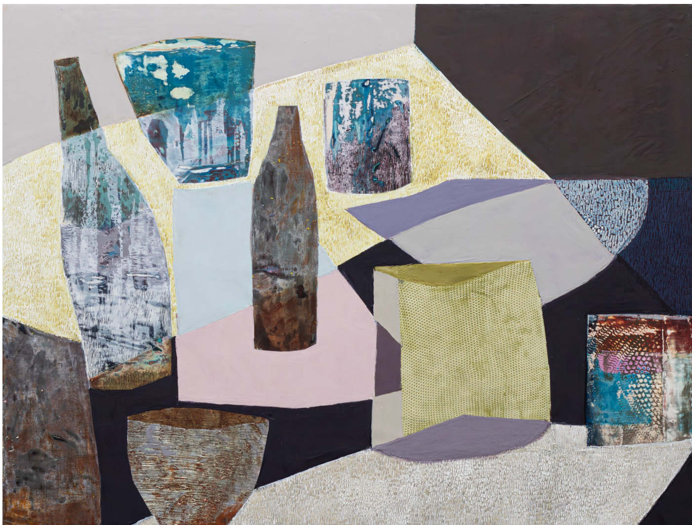
Hand Me Another Cup to Fill, 2024 Oil + cold wax on panel 92cm H x 122cm W Framed in dark timber $4600