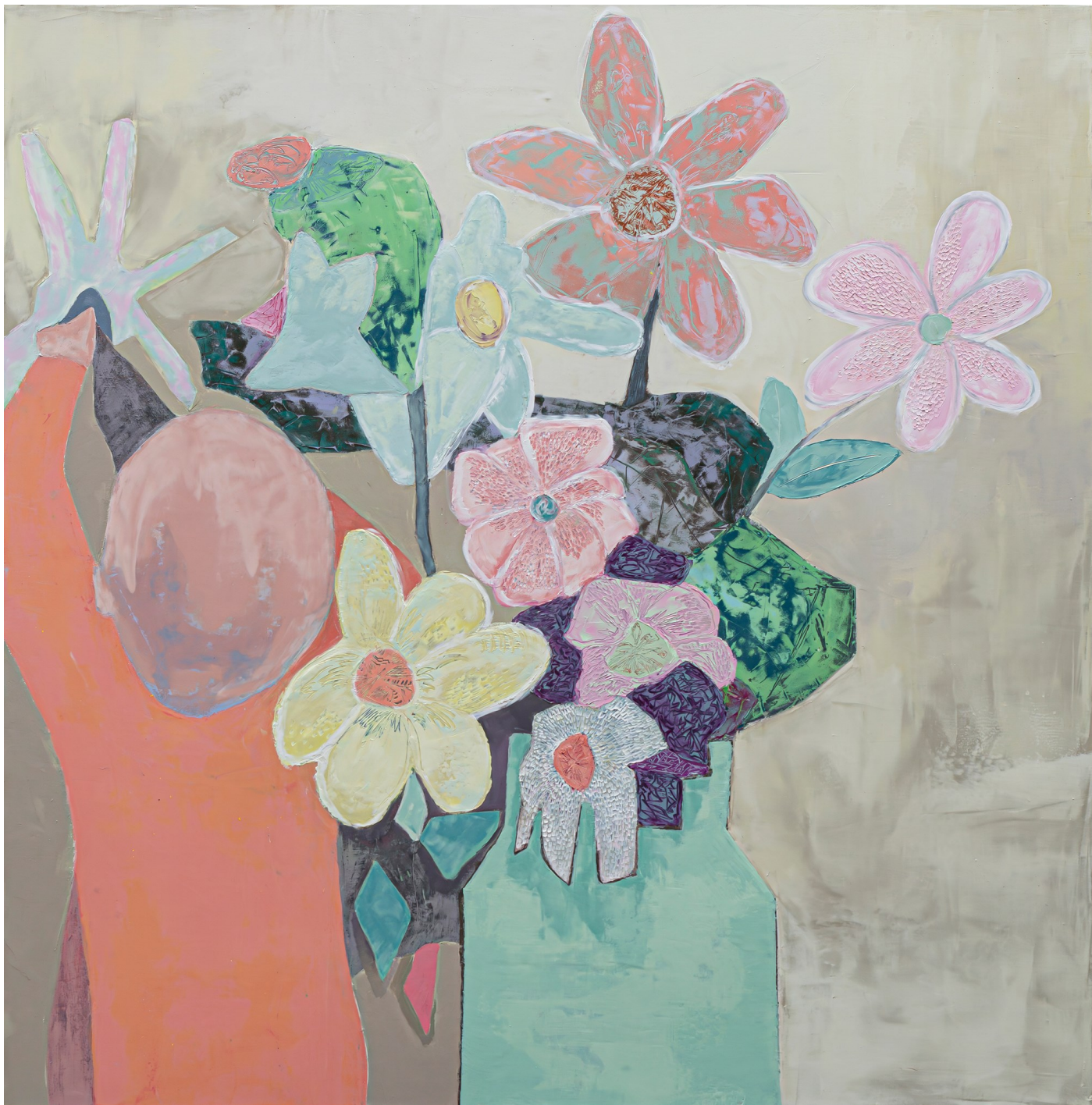
Lessons in Light , 2024 Oil + cold wax on panel 122cm H x 122cm W Framed in dark timber $5200