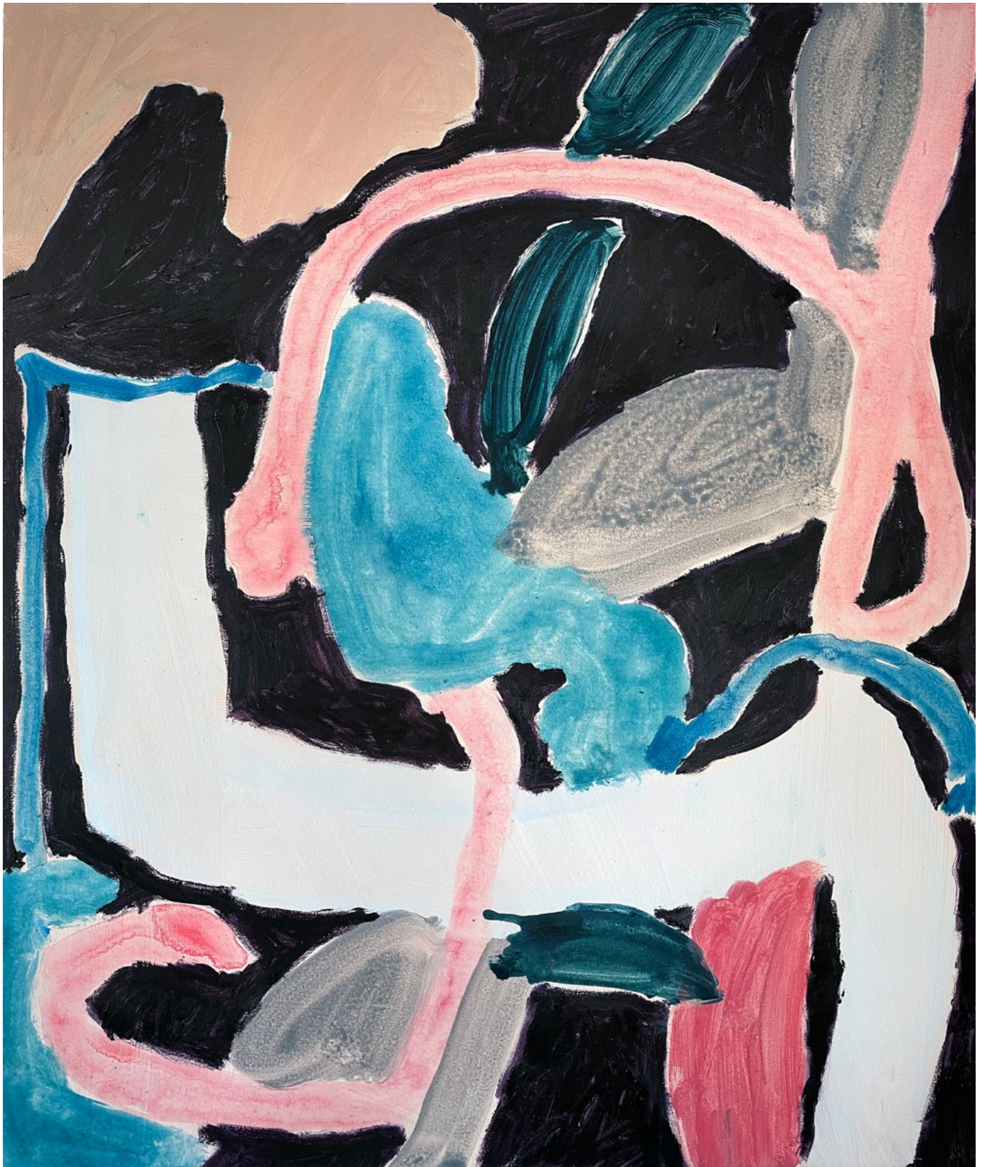
Lollipopper , 2023 Acrylic on board 62cm H x 52cm W Framed in Tasmanian oak $3000