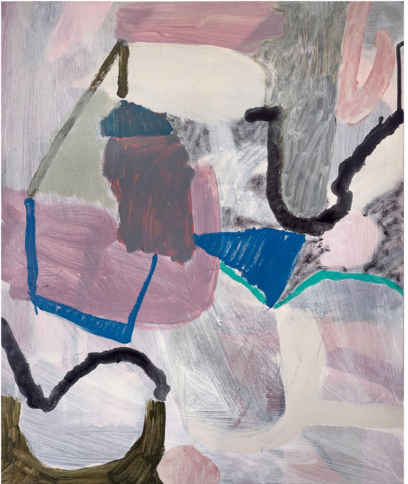
The Unravelling , 2023 Acrylic on board 62cm H x 52cm W Framed in Tasmanian oak $3000