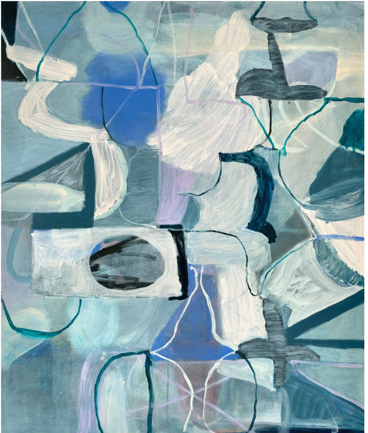
Entanglement , 2023 Acrylic on linen 118cm H x 100cm W Framed in Tasmanian oak $5800