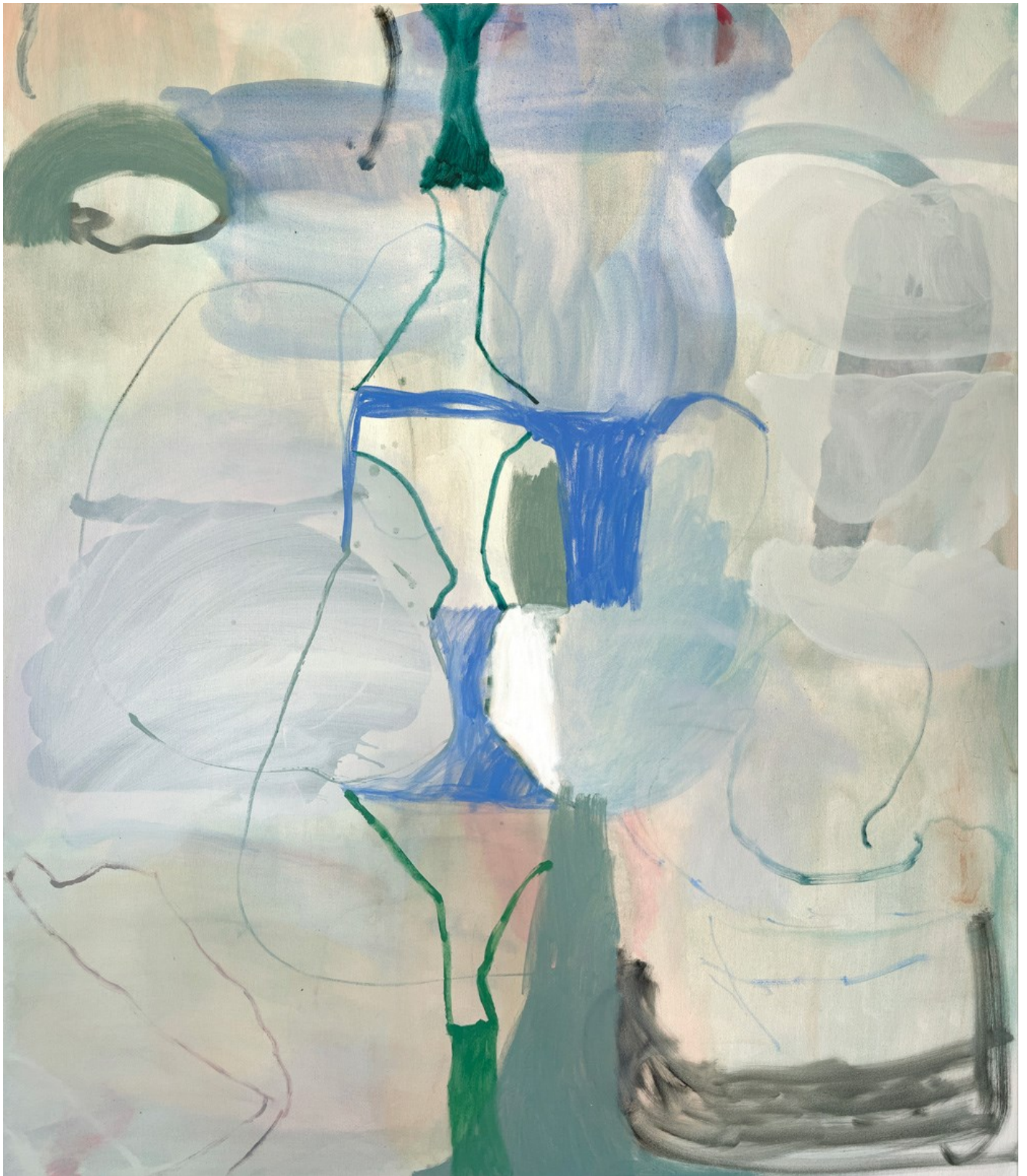
Dropping In , 2023 Acrylic on linen 153cm H x 133cm W Framed in Tasmanian oak $7800