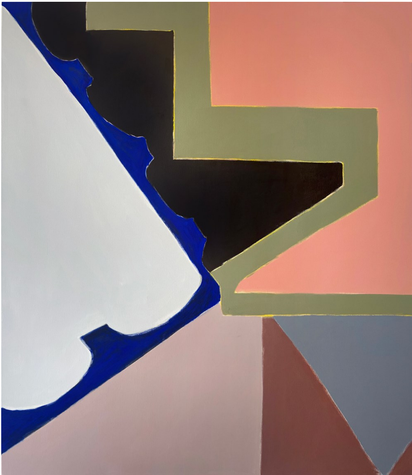
Higher Order, 2023 Acrylic on linen 153cm H x 133cm W Framed in Tasmanian oak $7800