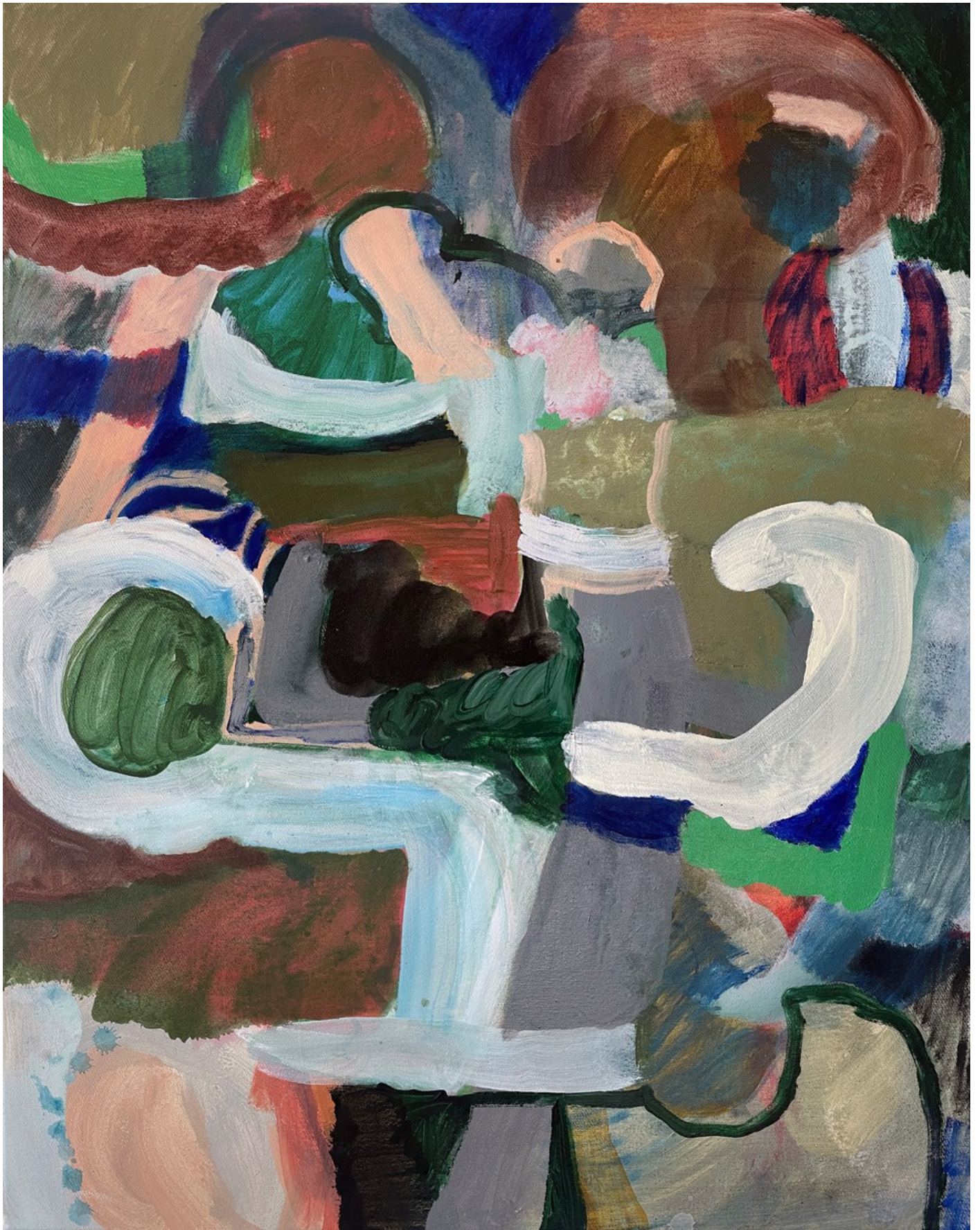
Dreaming Awake, 2023 Acrylic on canvas 83cm H x 79cm W Framed in Tasmanian oak $3900