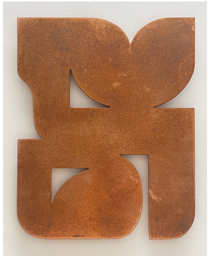
The Balance (Left) , 2024 Cut copper wall sculpture 25cm H x 25cm W $900