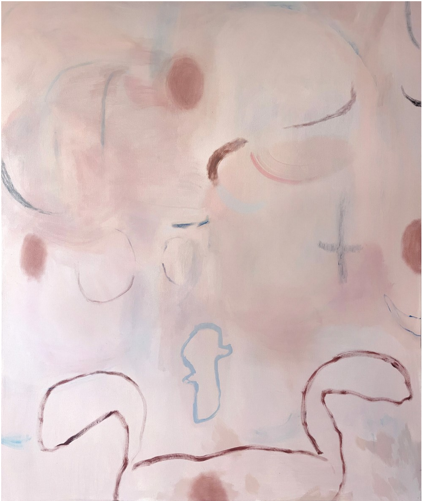
Suspended in Bliss , 2023 Acrylic on linen 153cm H x 133cm W Framed in Tasmanian oak $7800