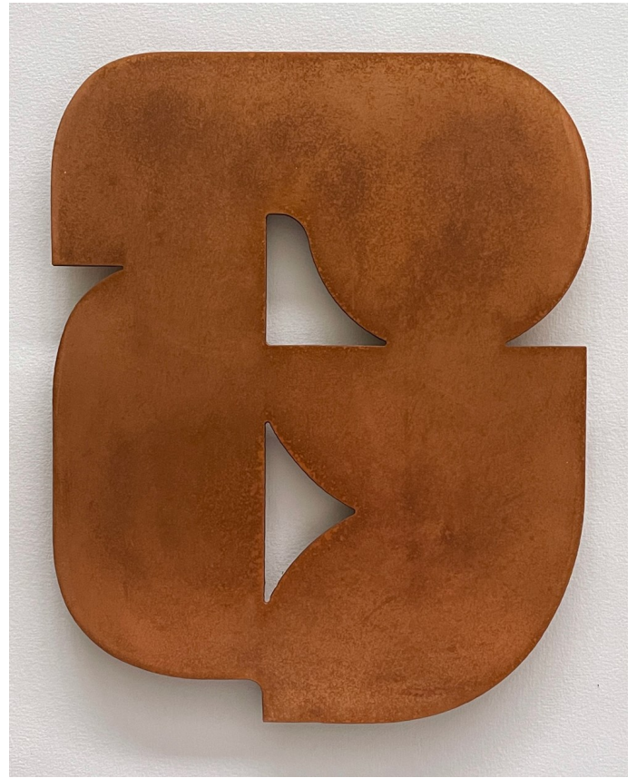
I Thank You (Left), 2024 Cut copper wall sculpture 25cm H x 25cm W $900