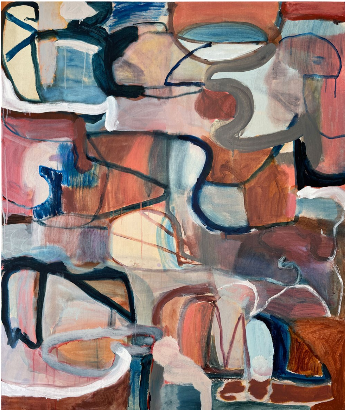
All the Hopes and Dreams, 2023 Acrylic on linen 123cm H x 103cm W Framed in Tasmanian oak $5800