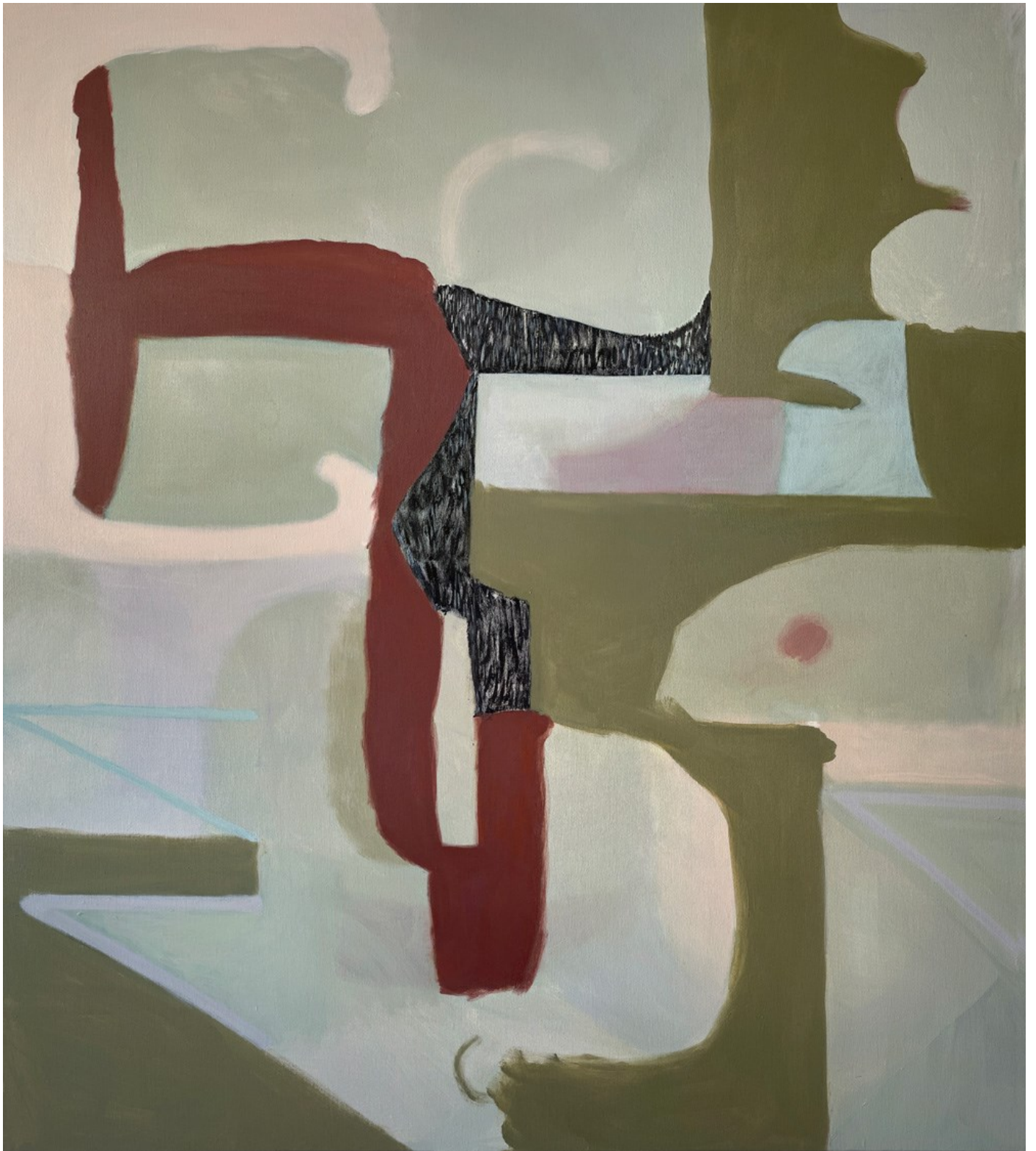
The Edge, 2023 Acrylic on linen 138cm H x 123cm W Framed in Tasmanian oak $7000