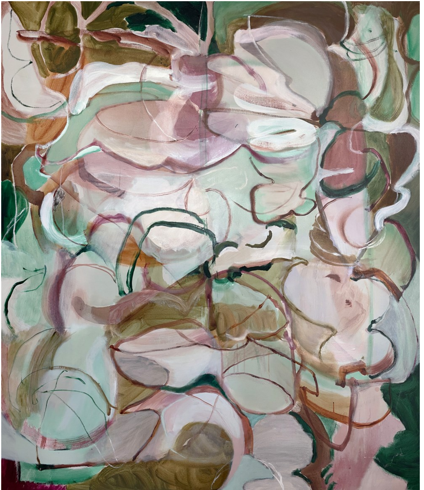
And So She Was Becoming , 2023 Acrylic on linen 153cm H x 133cm W Framed in Tasmanian oak $7800