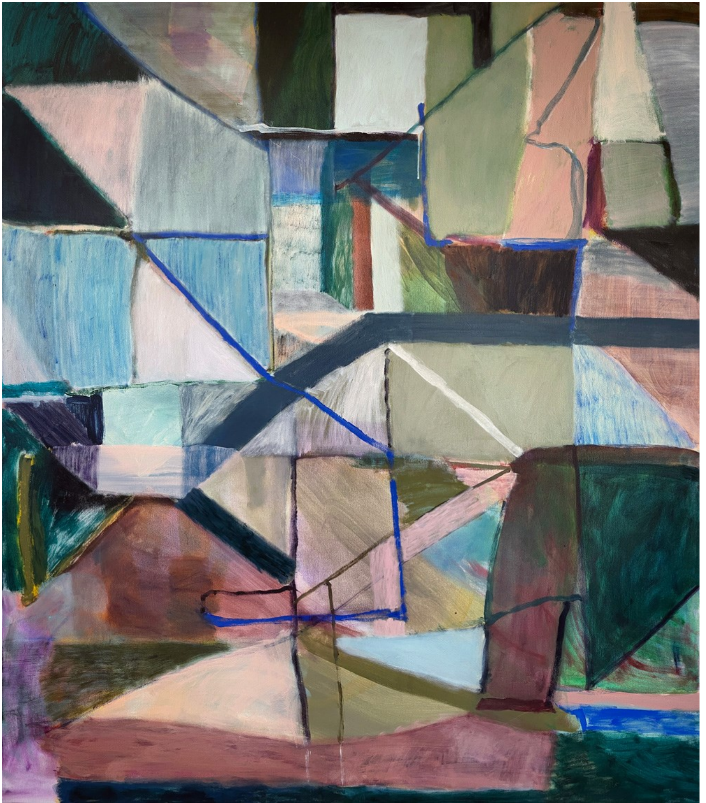
All the Ways Possible, 2023 Acrylic on linen 153cm H x 133cm W Framed in Tasmanian oak $7800