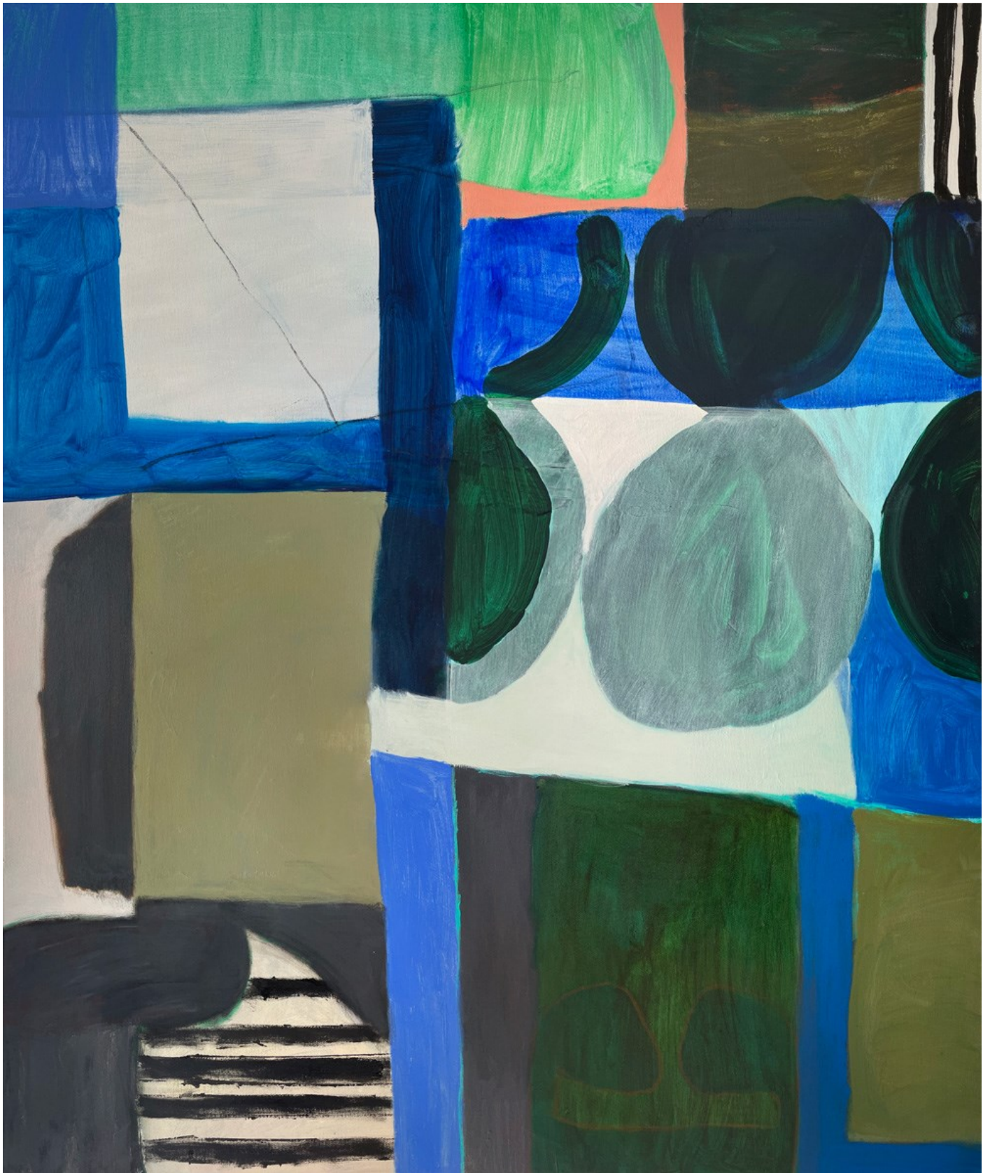
Ascension, 2023 Acrylic on linen 123cm H x 103cm W Framed in Tasmanian oak $5800