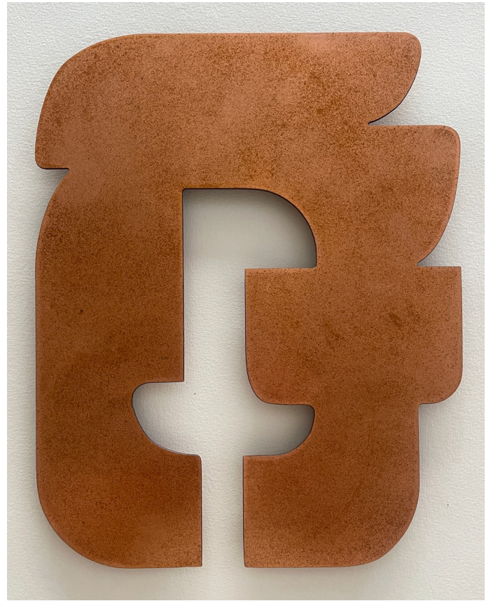
Keyhole (Left), 2024 Cut copper wall sculpture 25cm H x 25cm W $900