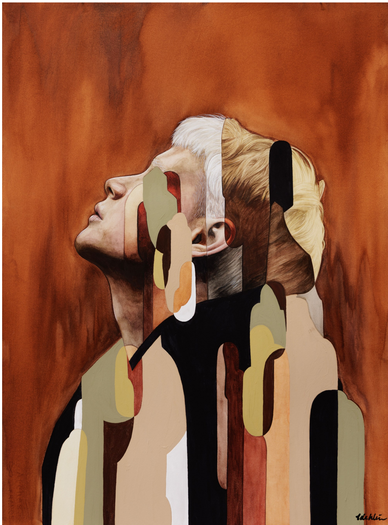
In Wittenoom , 2023 Watercolour, gouache + acrylic on paper 87.5cm x 68.5cm Framed under Perspex in Tasmanian oak $3900