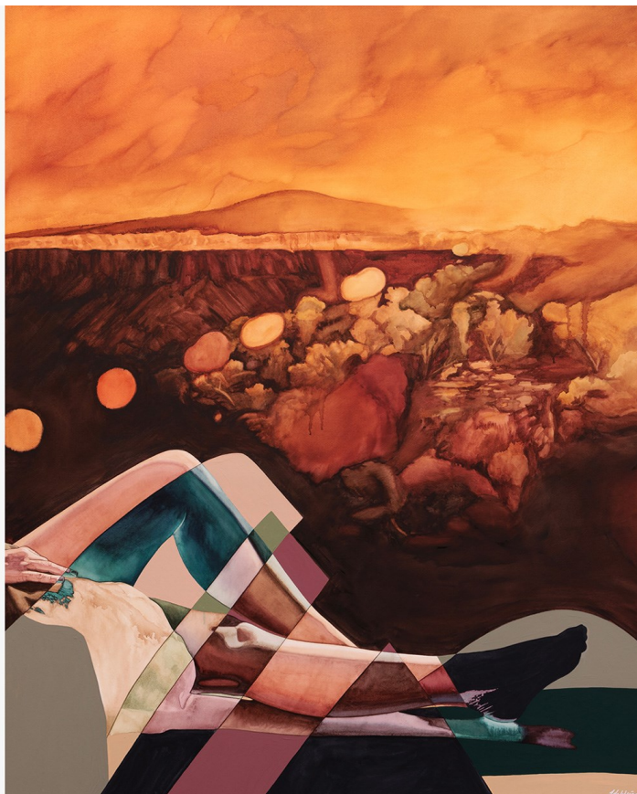
The Changing Lands, 2023 Watercolour, gouache + acrylic on paper Two framed panels 144cm H x 117cm W each Framed under Perspex in Tasmanian oak $12,000