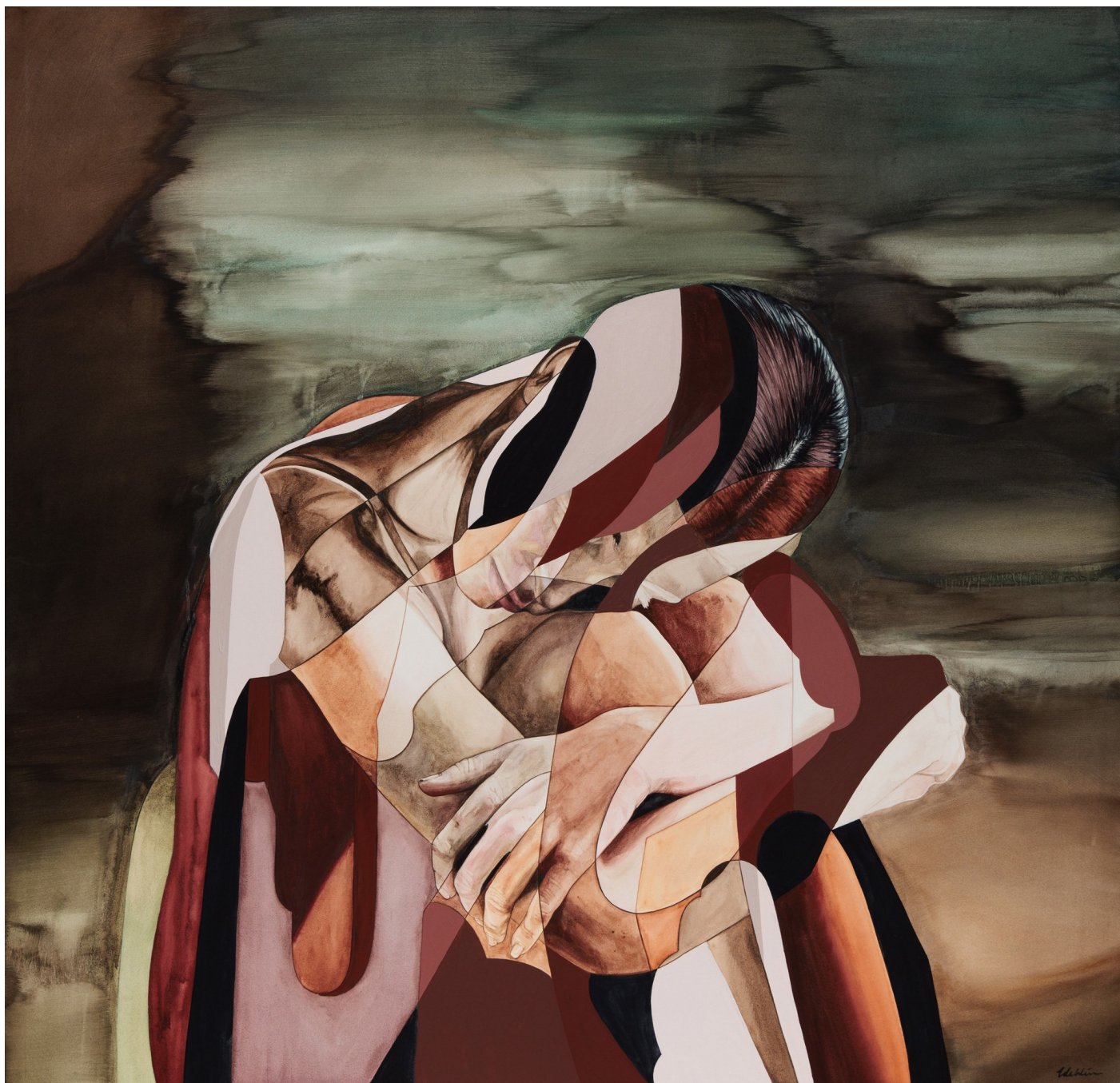
In the Shade, 2023 Watercolour, gouache + acrylic on paper 123cm x 127cm Framed under Perspex in Tasmanian oak SOLD