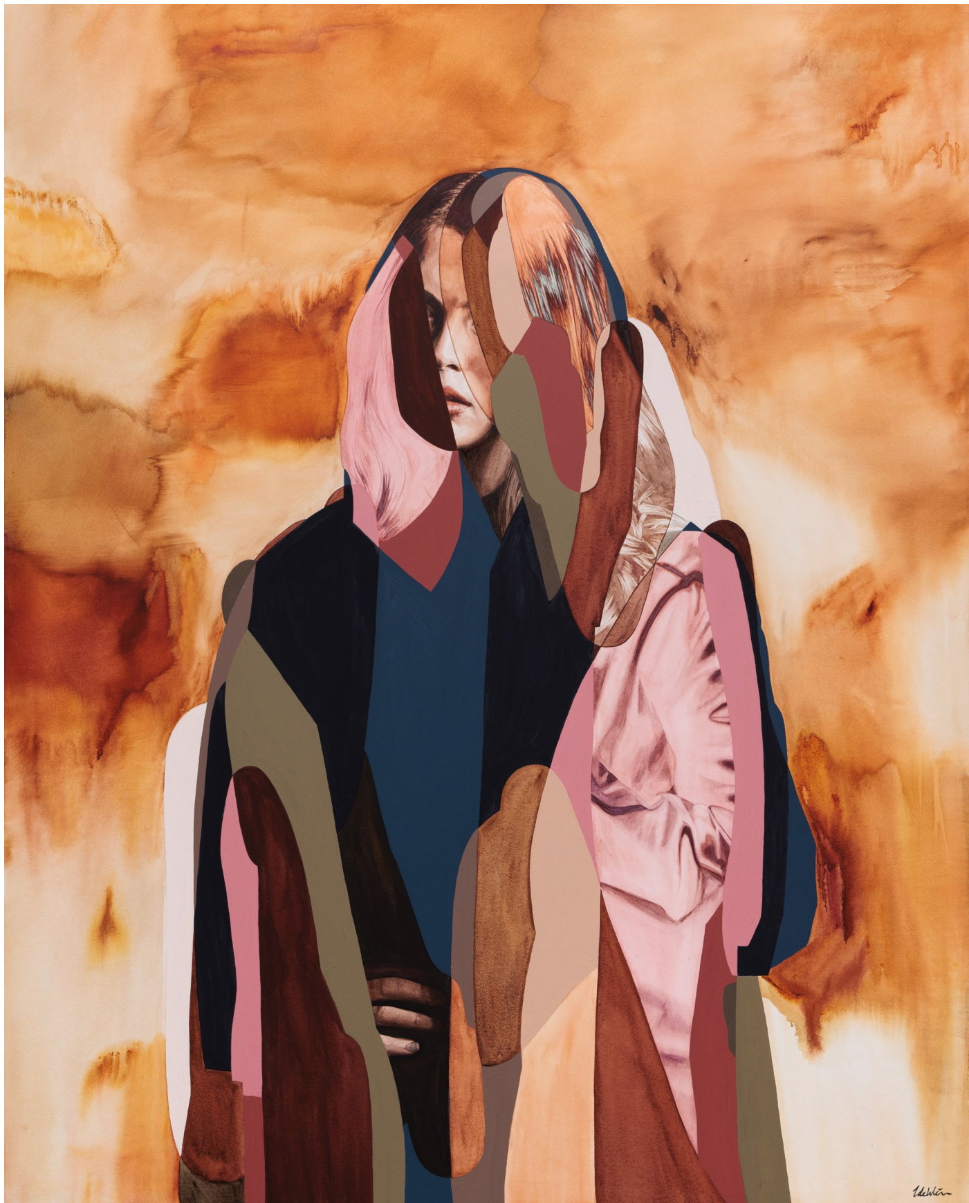
Remembering the Sun, 2023 Watercolour, gouache + acrylic on paper 153cm x 127cm Framed under Perspex in Tasmanian oak SOLD