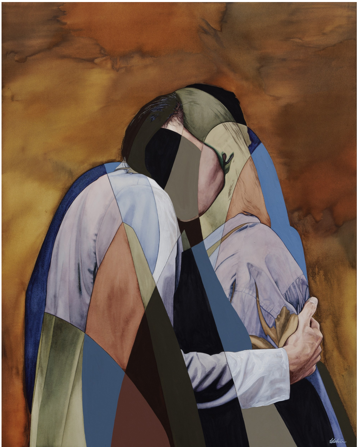
Strangers of Heart, 2023 Watercolour, gouache + acrylic on paper 125cm x 101cm Framed under Perspex in Tasmanian oak $6000