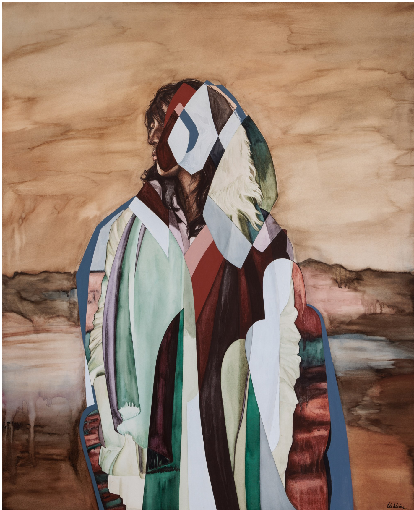
The Water Over the Stone, 2023 Watercolour, gouache + acrylic on paper 153cm x 127cm Framed under Perspex in Tasmanian oak $7000