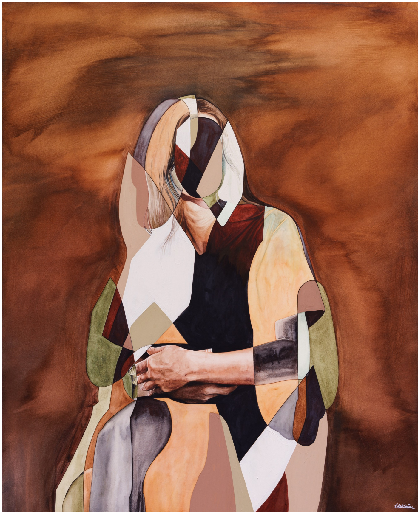
When the Sky Turned Red, 2023 Watercolour, gouache + acrylic on paper 153cm x 127cm Framed under Perspex in Tasmanian oak $7000