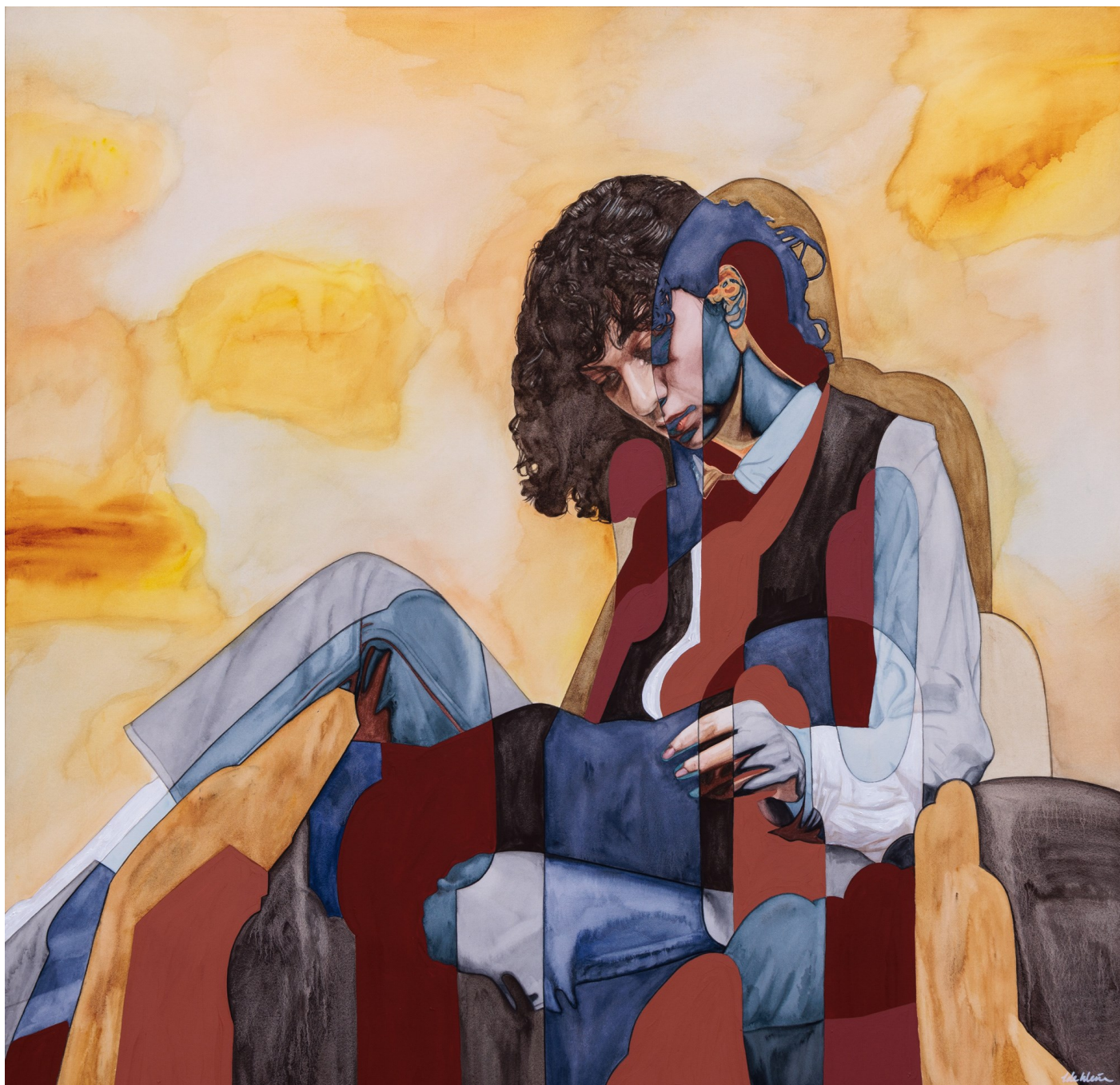
Rewritten, 2023 Watercolour, gouache + acrylic on paper 123cm x 127cm Framed under Perspex in Tasmanian oak $6500