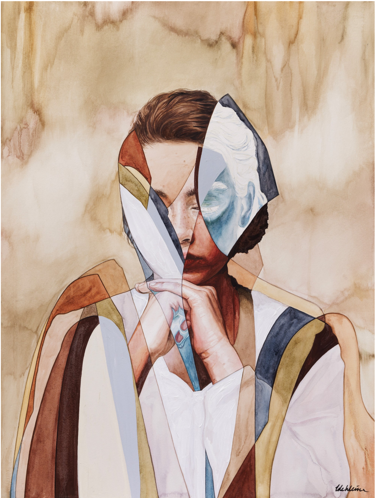
In the Liminal , 2023 Watercolour, gouache + acrylic on paper 87.5cm x 68.5cm Framed under Perspex in Tasmanian oak SOLD