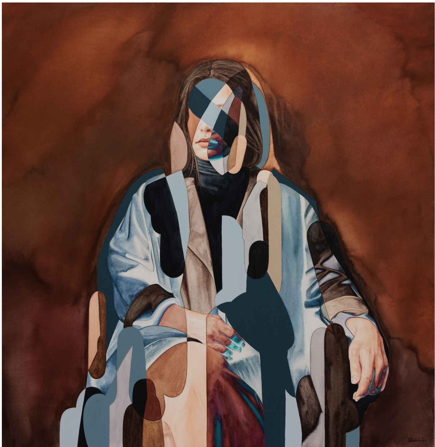
Blue Tailings, 2023 Watercolour, gouache + acrylic on paper 123cm x 127cm Framed under Perspex in Tasmanian oak $6500