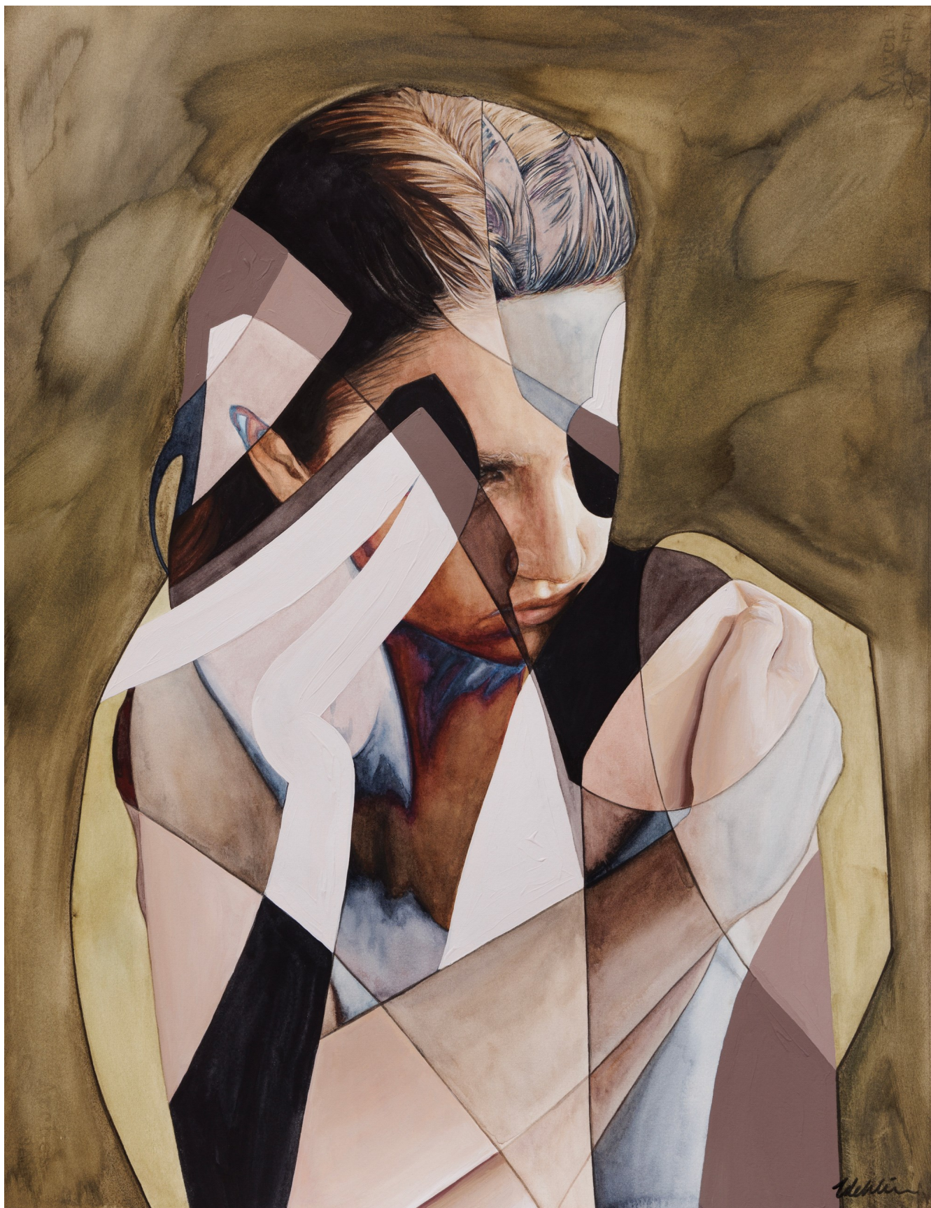
Running Waters , 2023 Watercolour, gouache + acrylic on paper 87.5cm x 68.5cm Framed under Perspex in Tasmanian oak $3900