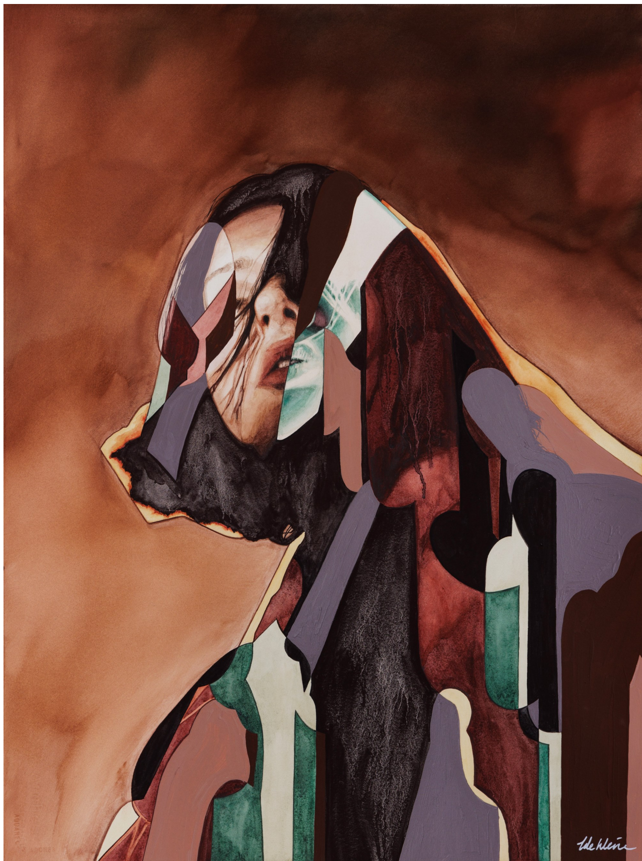
As the Ash Fell , 2023 Watercolour, gouache + acrylic on paper 87.5cm x 68.5cm Framed under Perspex in Tasmanian oak $3900