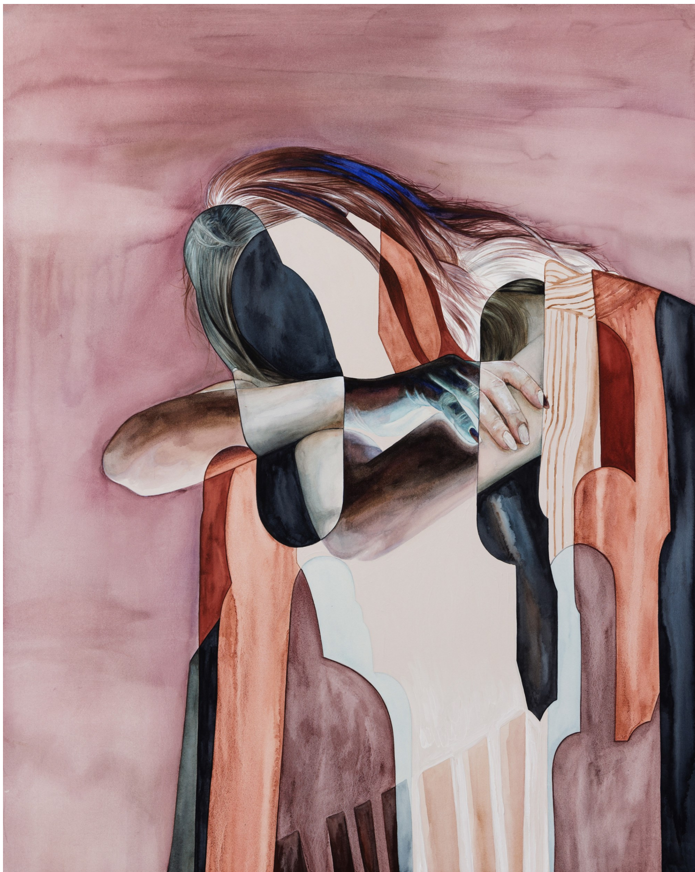
Unspoken , 2023 Watercolour, gouache + acrylic on paper 125cm x 101cm Framed under Perspex in Tasmanian oak SOLD