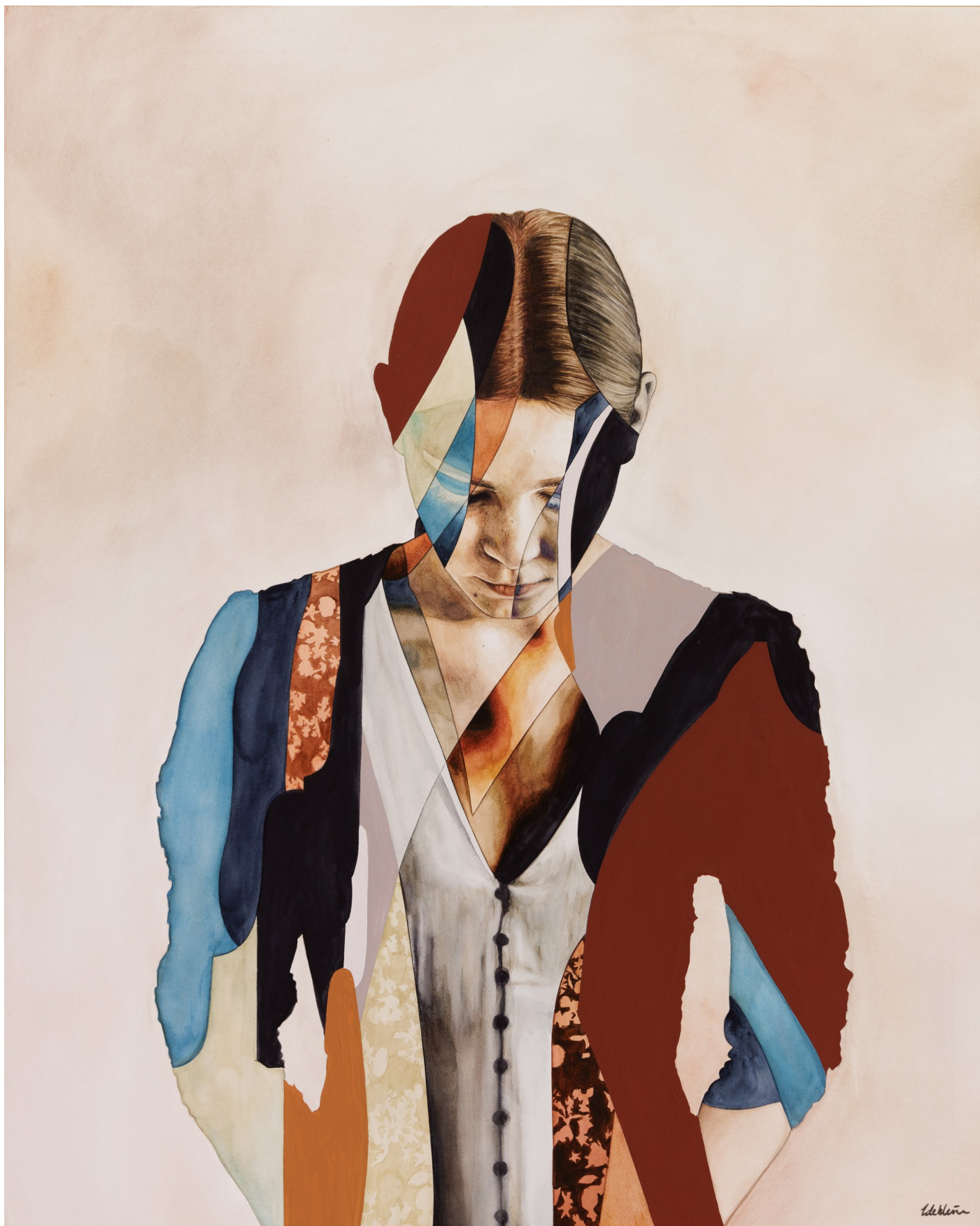
What Was Left, 2023 Watercolour, gouache + acrylic on paper 125cm x 101cm Framed under Perspex in Tasmanian oak SOLD