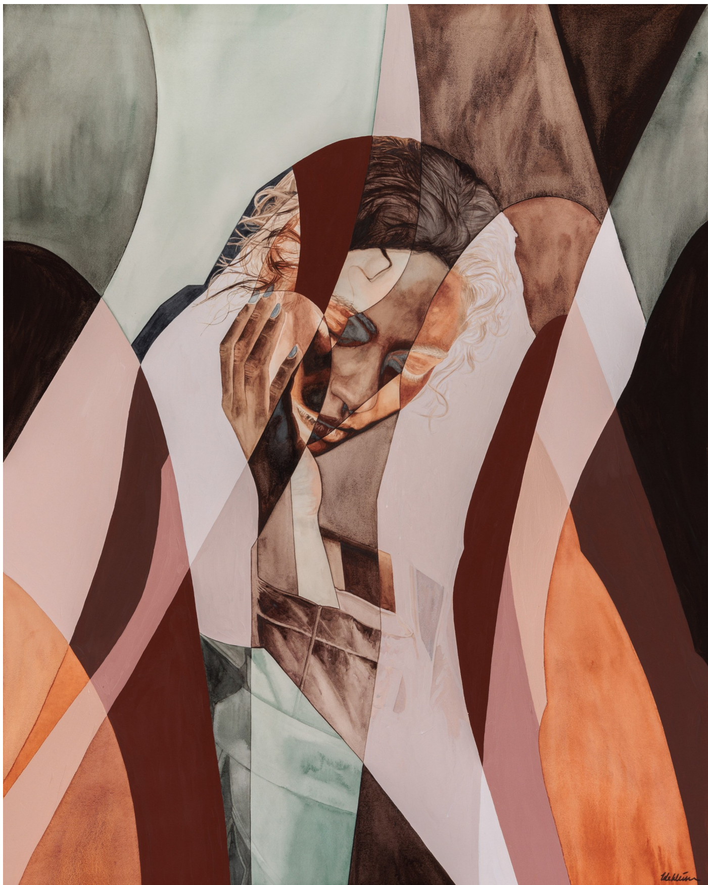
The Home I Built, 2023 Watercolour, gouache + acrylic on paper 125cm x 101cm Framed under Perspex in Tasmanian oak $6000