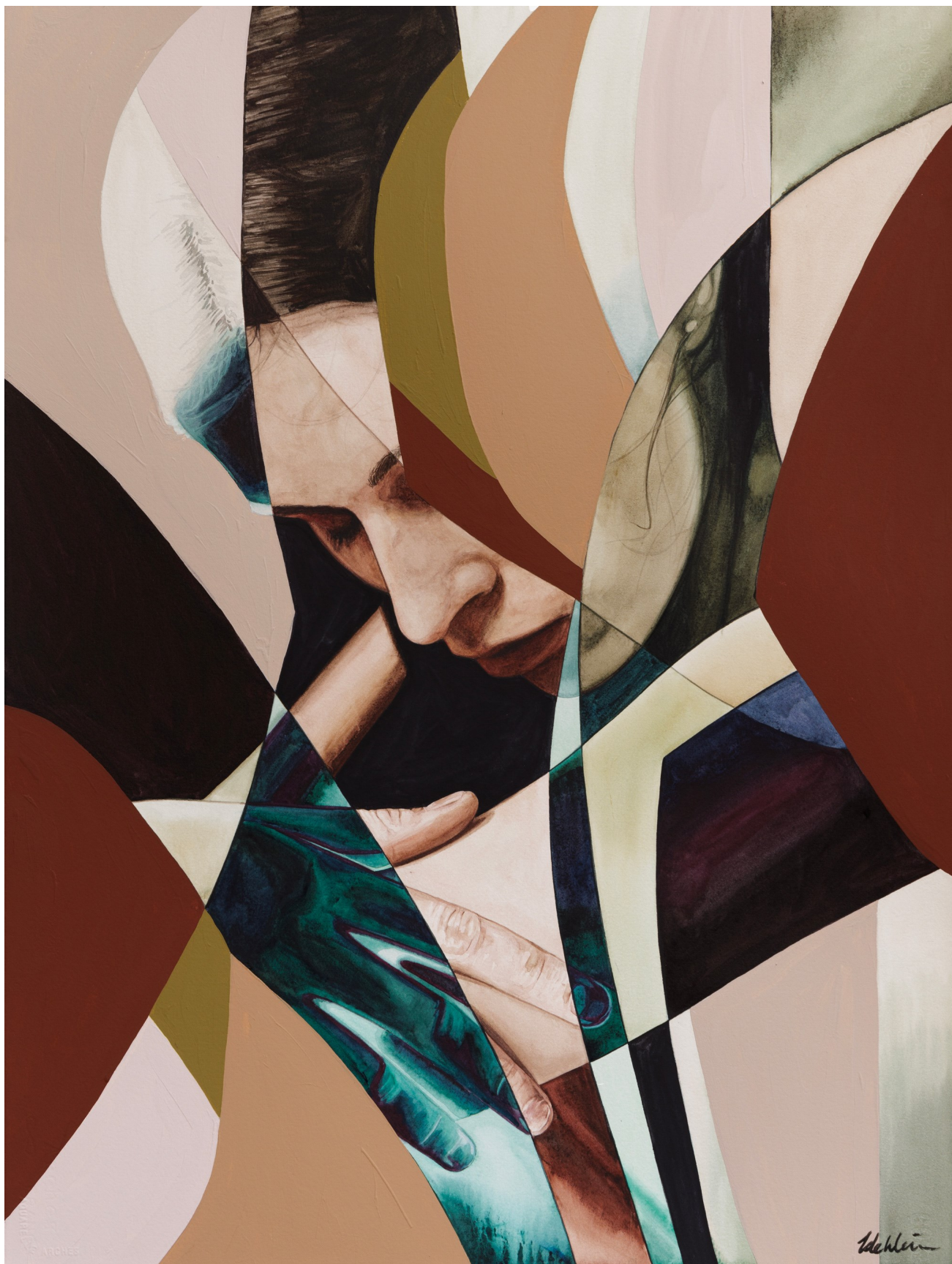
New Versions, 2023 Watercolour, gouache + acrylic on paper 87.5cm x 68.5cm Framed under Perspex in Tasmanian oak $3900