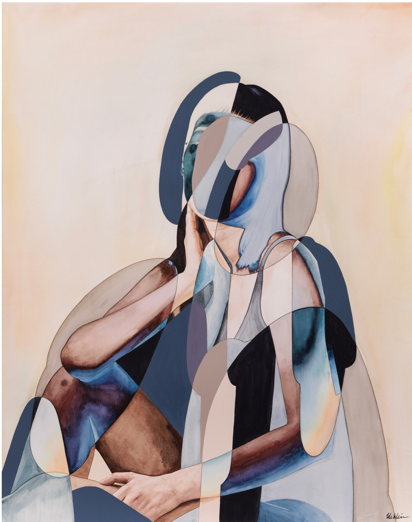
Another Dream , 2023 Watercolour, gouache + acrylic on paper 125cm x 101cm Framed under Perspex in Tasmanian oak $6000