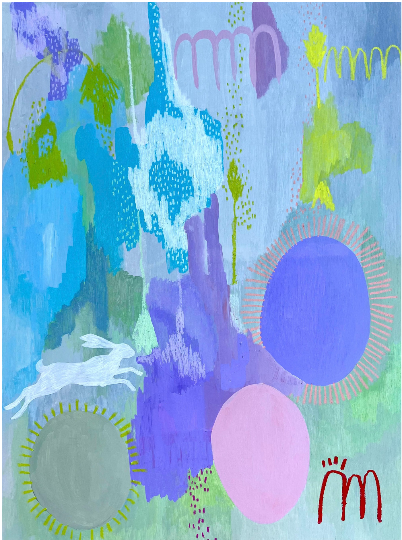
So, go Acrylic + oil stick on timber board 61cm x 46cm $985