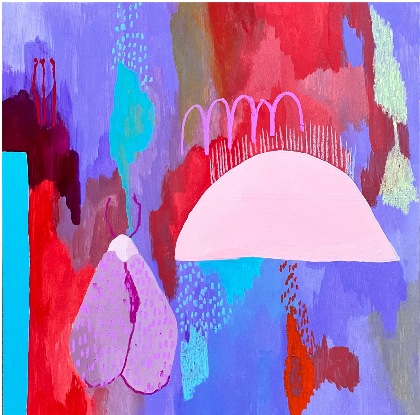
Tremble Acrylic + oil stick on timber board 31cm x 31cm $885