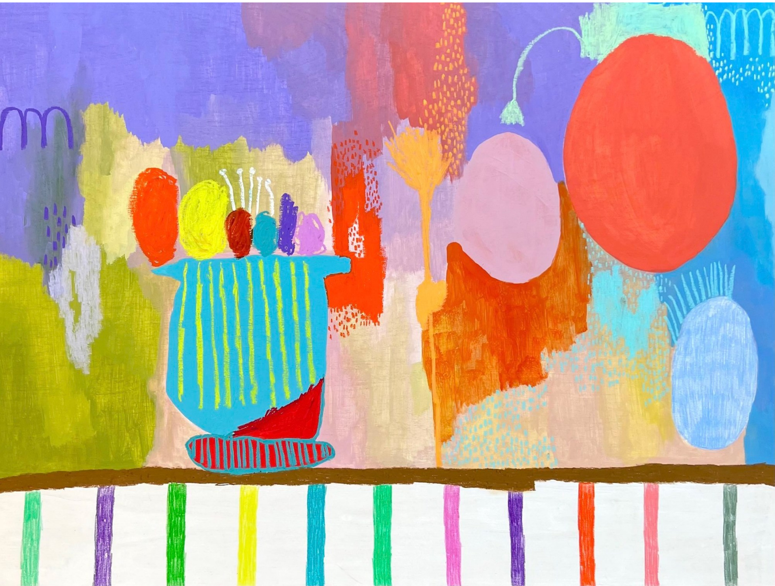
The Deep Echoes Acrylic, coloured pencil + oil stick on timber board 46cm x 61cm $985