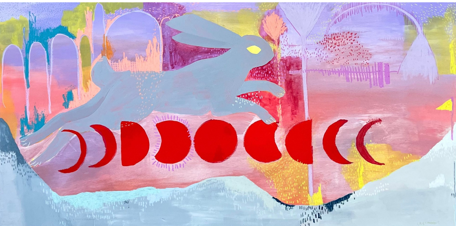
Until the Darkness Softly Clears Acrylic + oil stick on marine ply 61cm x 121cm Framed in oak $1900