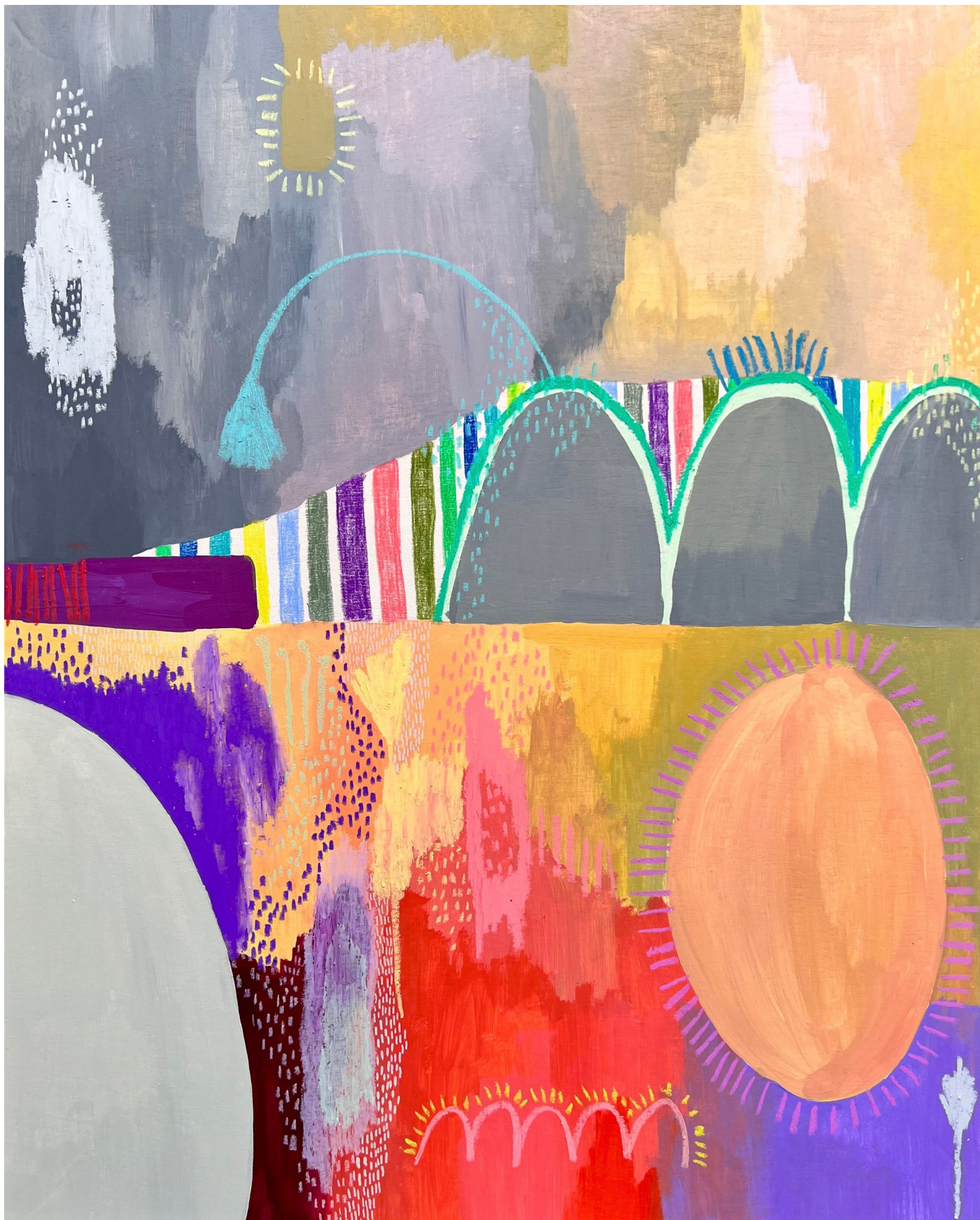
A Tenuous Silence Acrylic + oil stick on timber board 51cm x 41cm $925