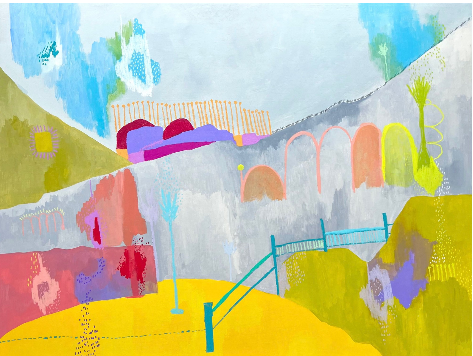
The Shifting of Sleep Acrylic + oil stick on timber board 76cm x 101cm $1700