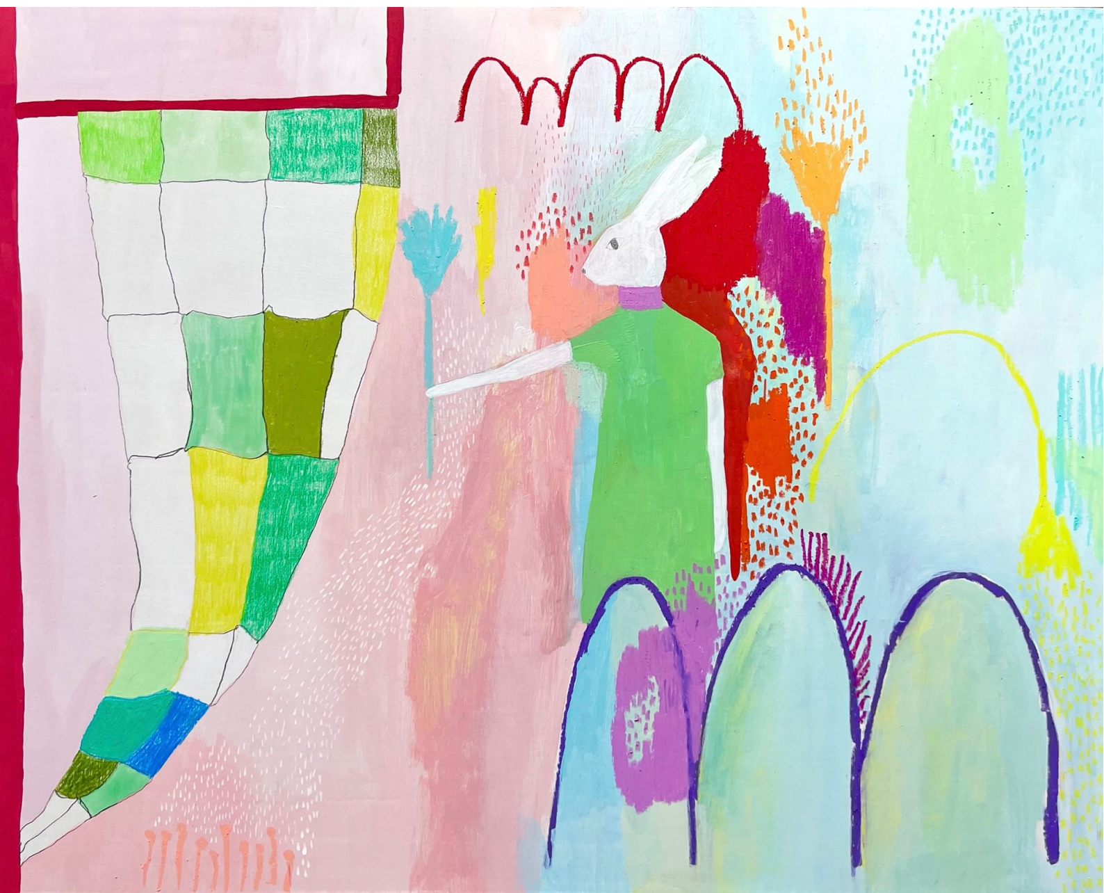
The Offering Acrylic, coloured pencil + oil stick on timber board 41cm x 51cm $925