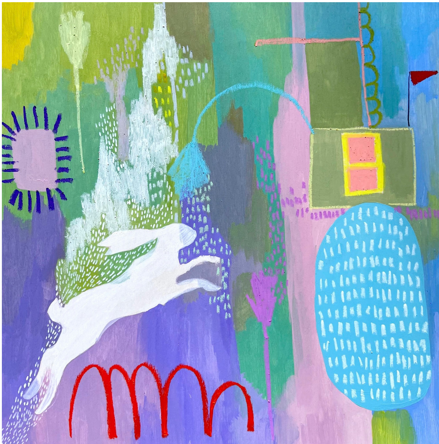
Whispering in an Empty House Acrylic + oil stick on timber board 31cm x 31cm $885