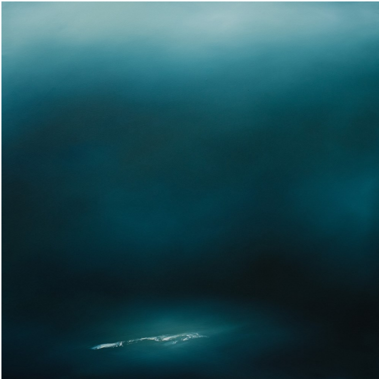
THERESA HUNT Seas Within a Sea Oil on canvas 152cm x 152cm $6500 Framed