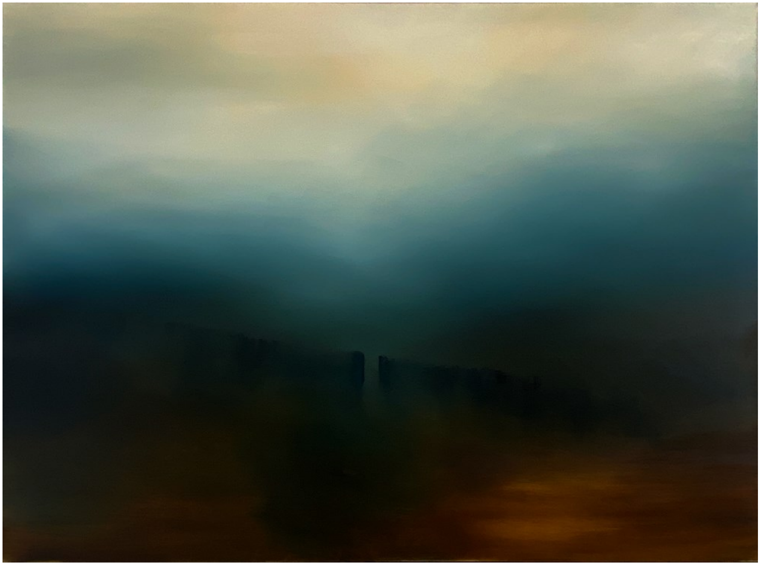
THERESA HUNT Beyond Fiesole Oil on canvas 152cm x 202cm $9800 Framed