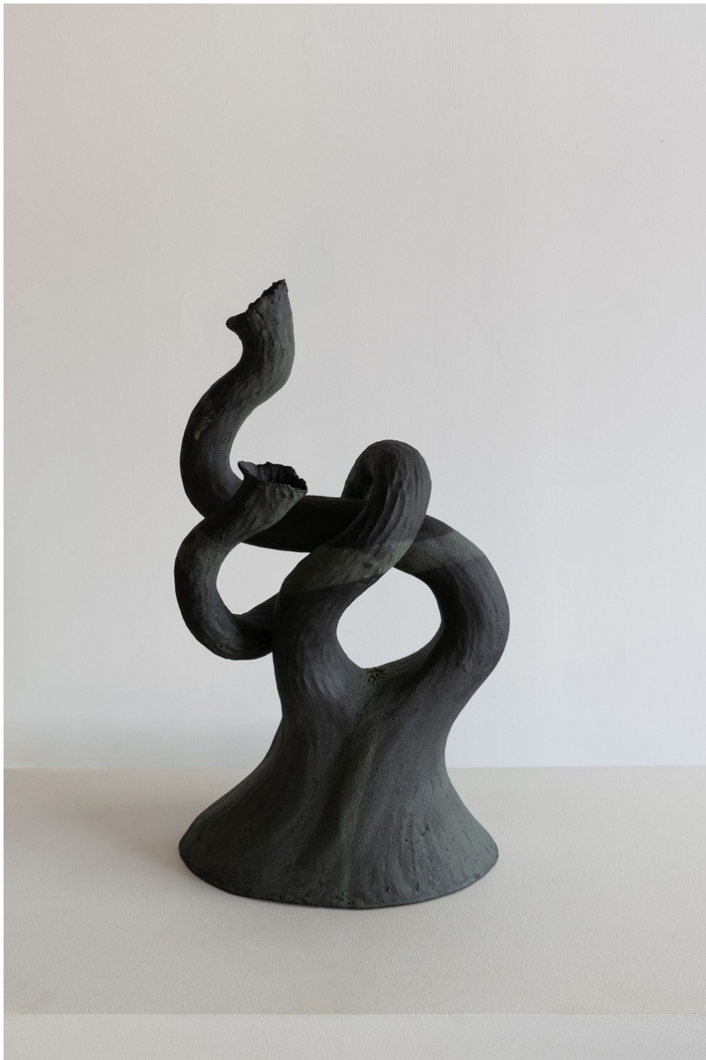
KERRY LEVY Wild Geese Australian stoneware, charcoal black glaze 75cm x 45cm x 31cm $4200