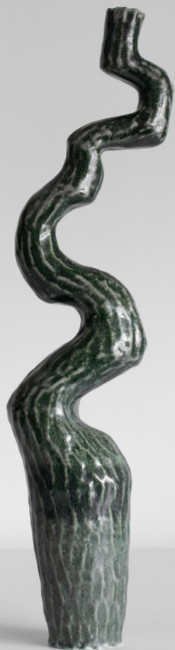
KERRY LEVY Asymmetry Vessel #20.54 Australian stoneware, satin green glaze 56cm x 13cm x 9cm $980