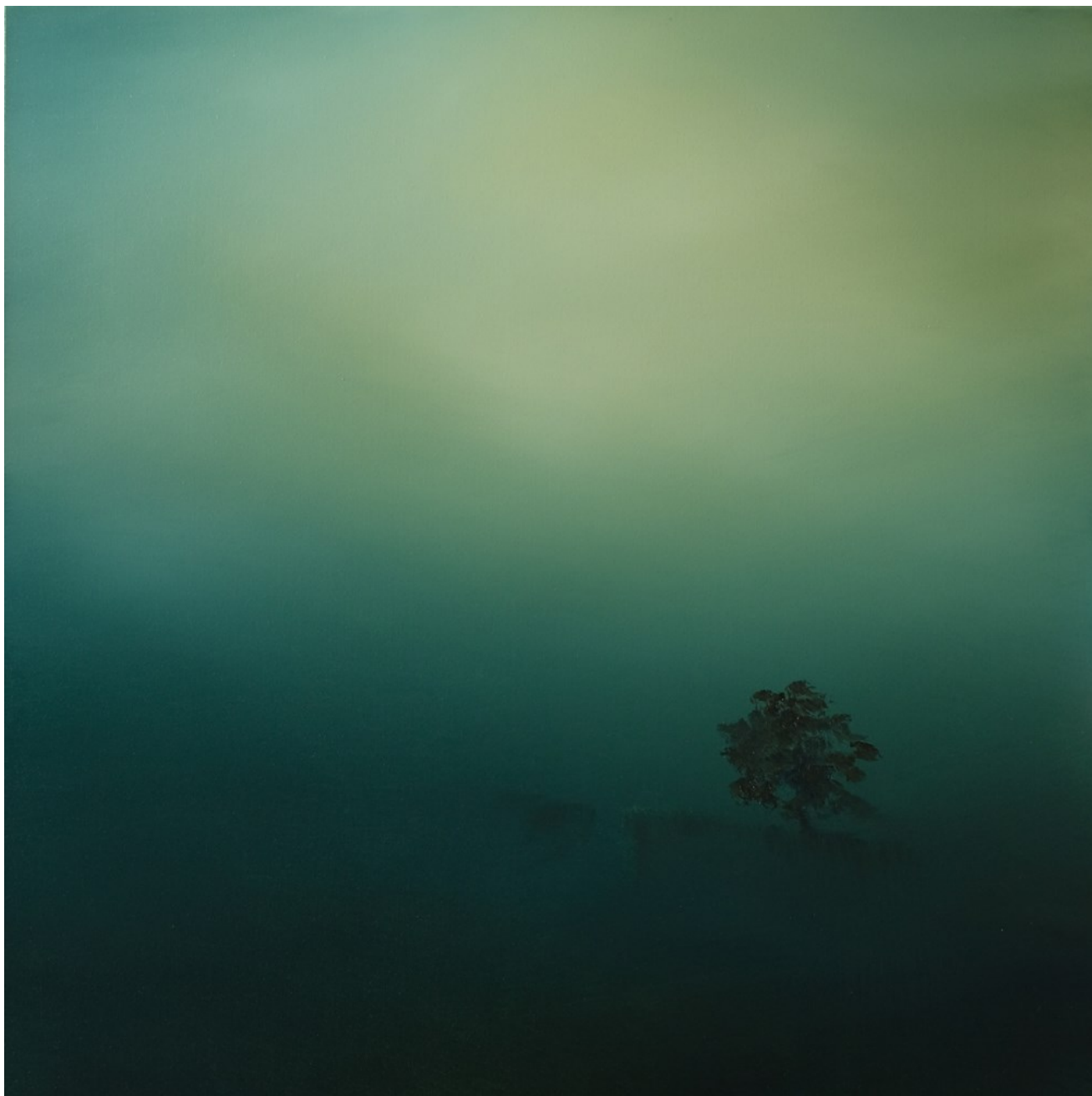
THERESA HUNT The Marker Tree Oil on canvas 102cm x 102cm $4200 Framed