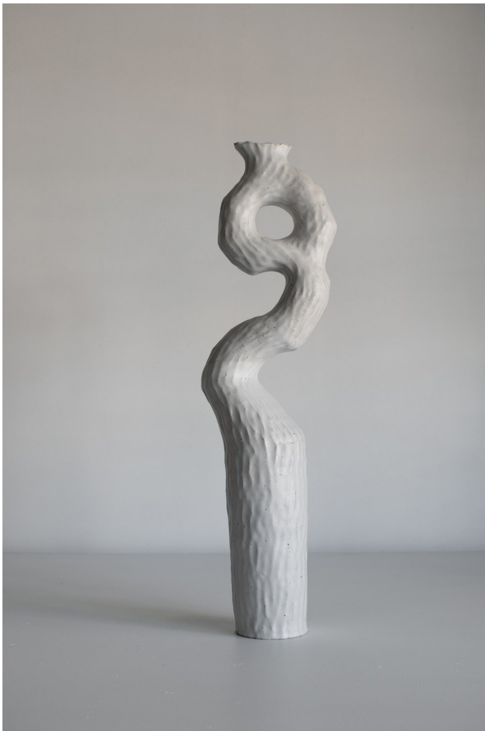
KERRY LEVY Asymmetry Vessel #20.03 Australian stoneware, soft white glaze 61cm x 17cm x 11cm $1200