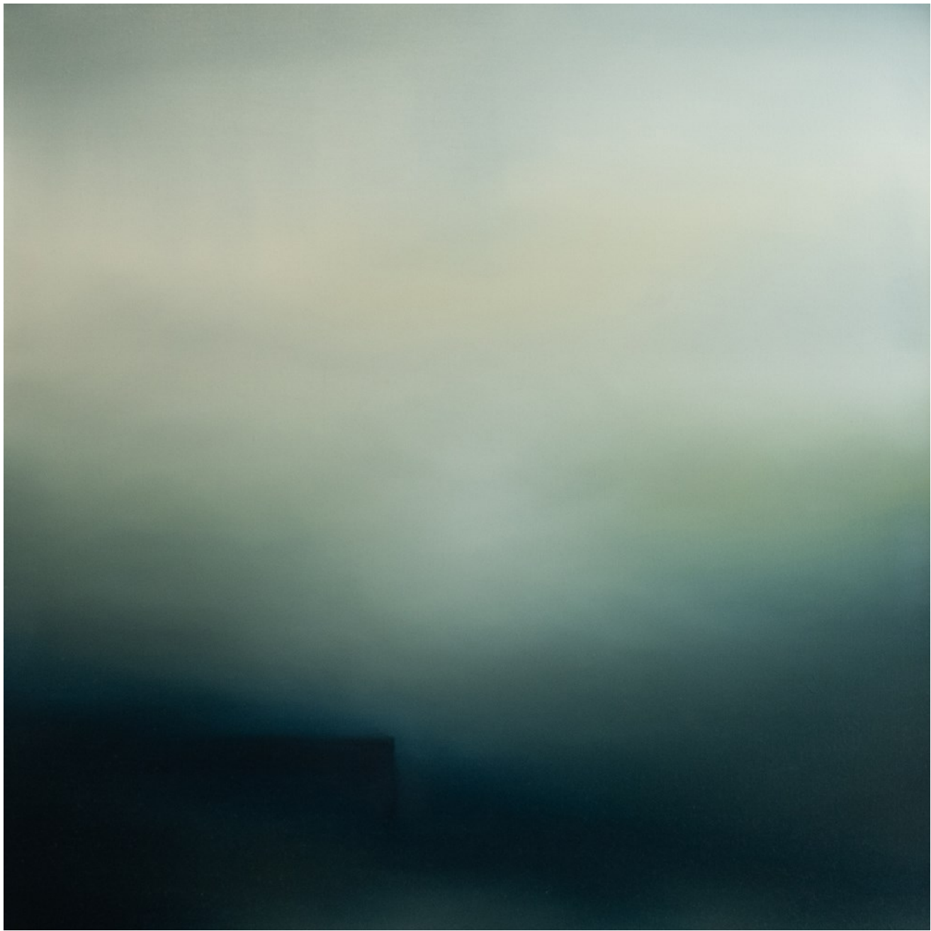
THERESA HUNT Point Perpendicular Oil on linen 102cm x 102cm $4200 Framed