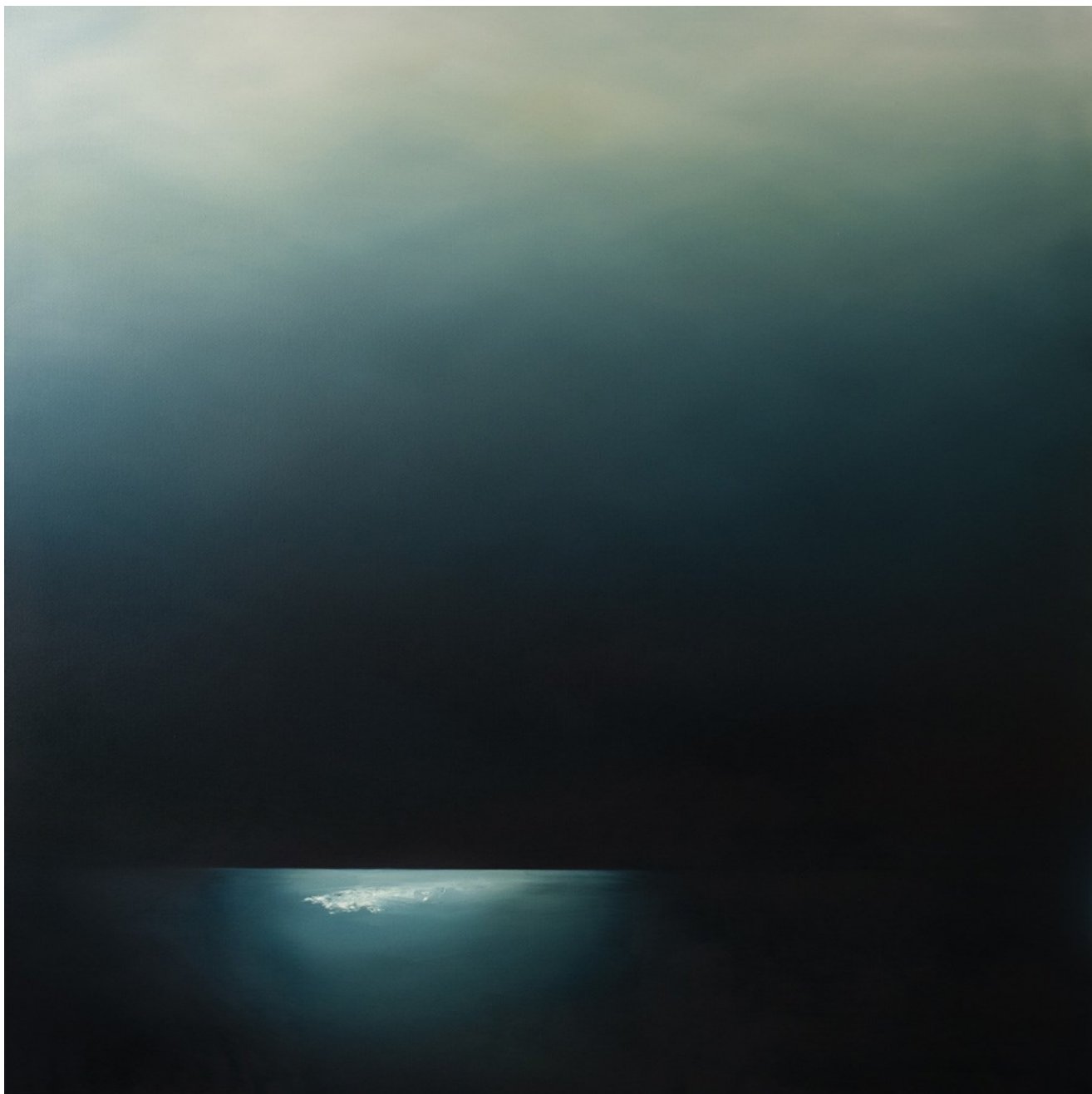
THERESA HUNT Wishing on the Moonlight Oil on canvas 152cm x 152cm $6500 Framed