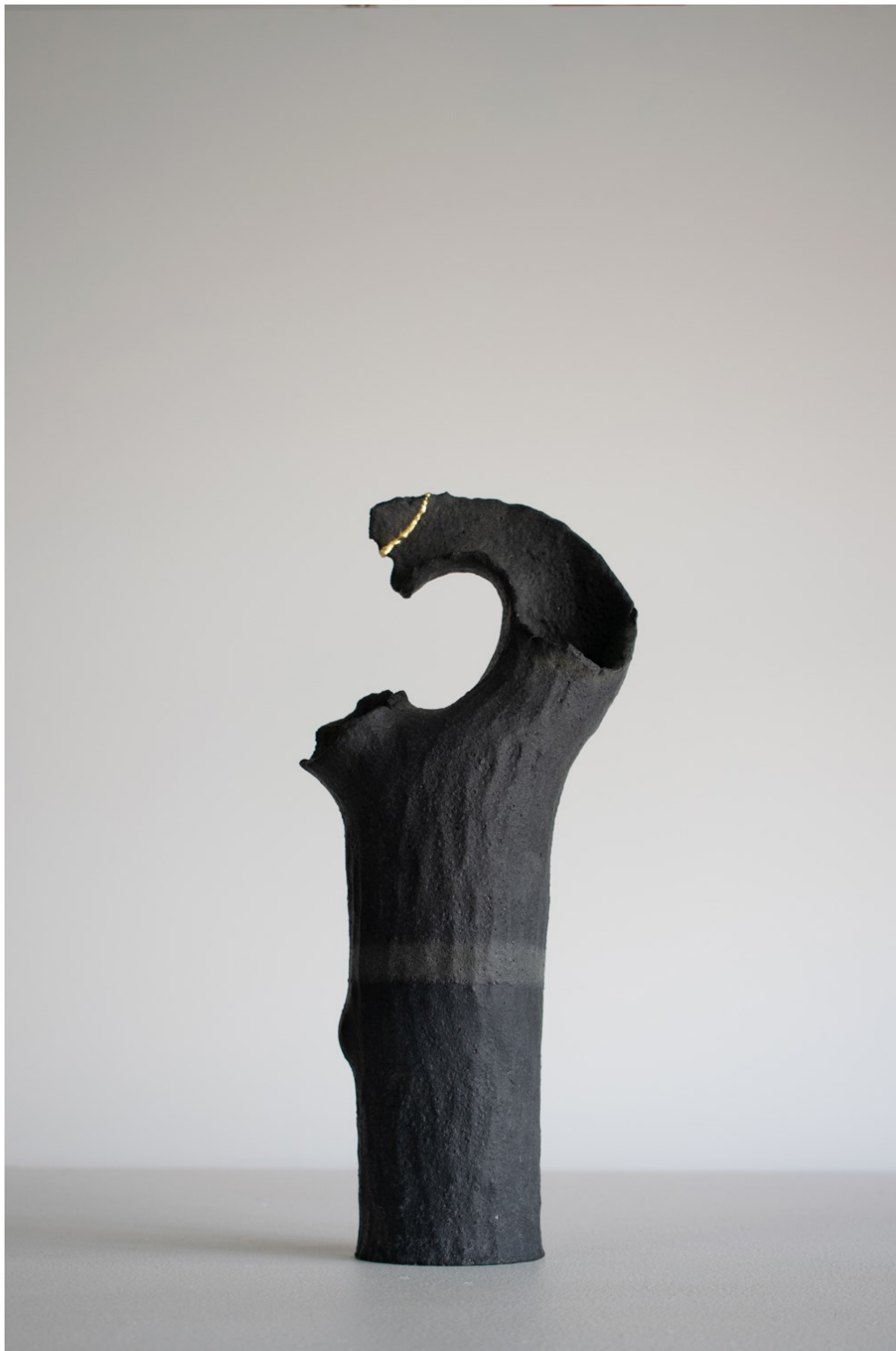
KERRY LEVY Torn Onishi Vase #19.61 Australian stoneware, resin, 23ct gold leaf, charcoal black glaze 37cm x 16cm x 25cm $680