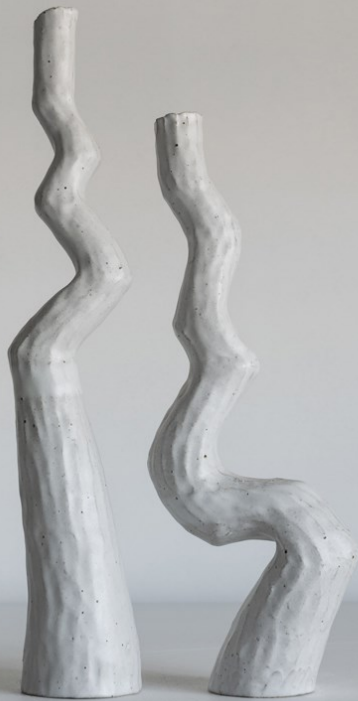
KERRY LEVY Asymmetry Pair #20.52/53 Australian stoneware, soft white glaze 36cm x 14cm x 7cm 43.5cm x 9cm x 8cm $900