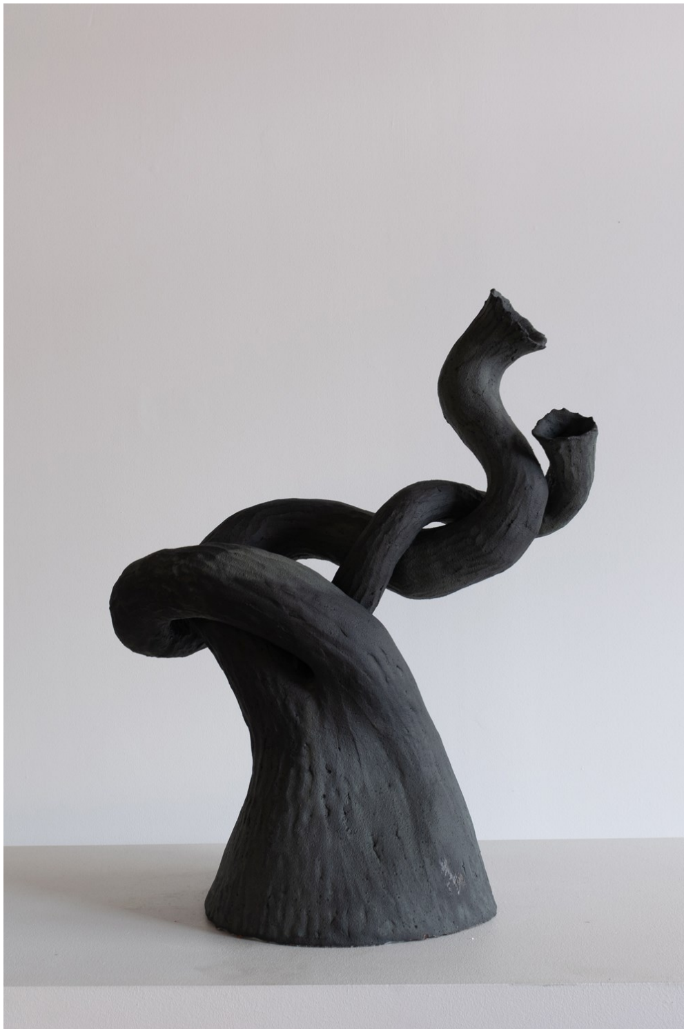
KERRY LEVY Sleeping in the Forest Australian stoneware, charcoal black glaze 72cm x 57cm x 34cm $4200