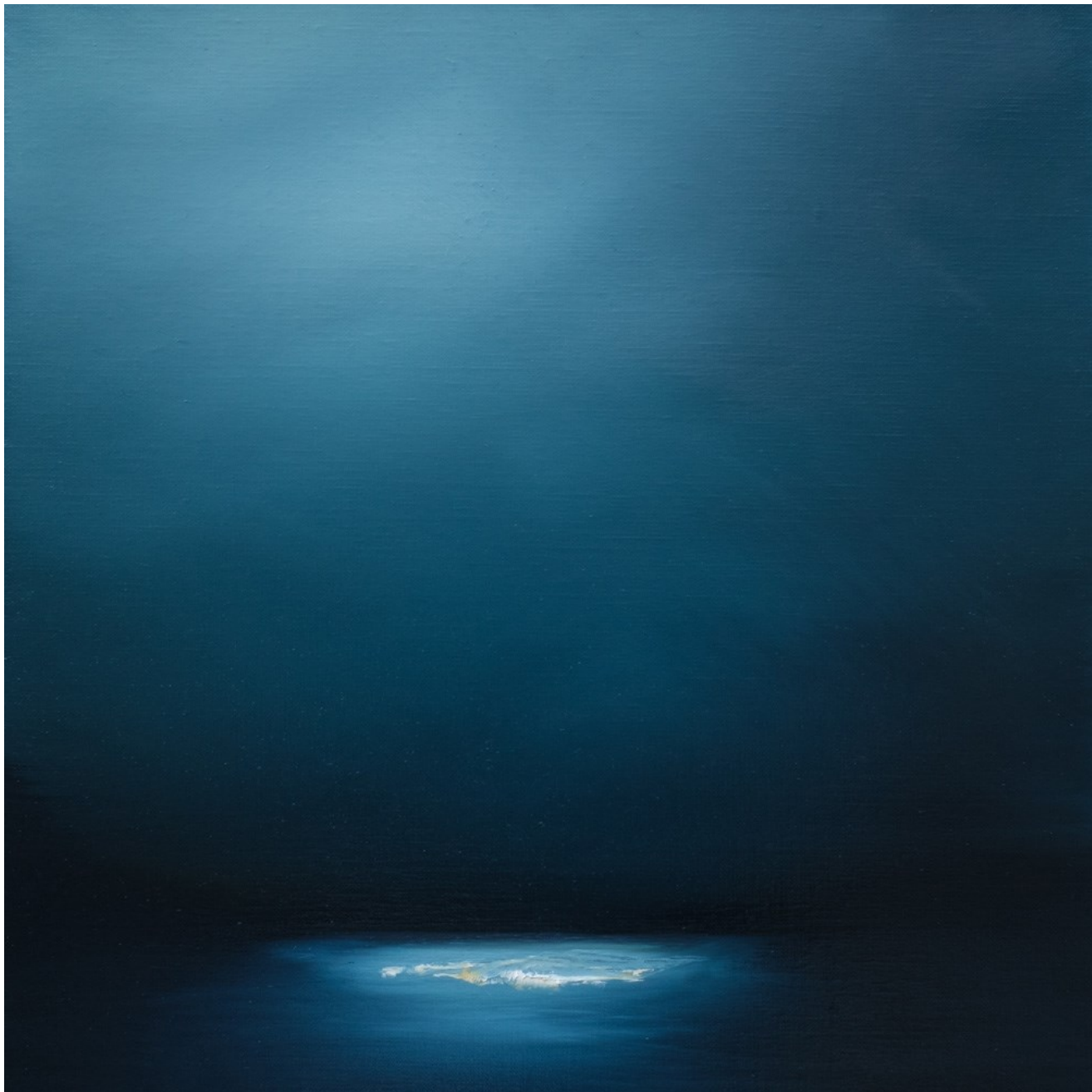
THERESA HUNT Smallwave Oil on linen 47cm x 47cm $1950 Framed