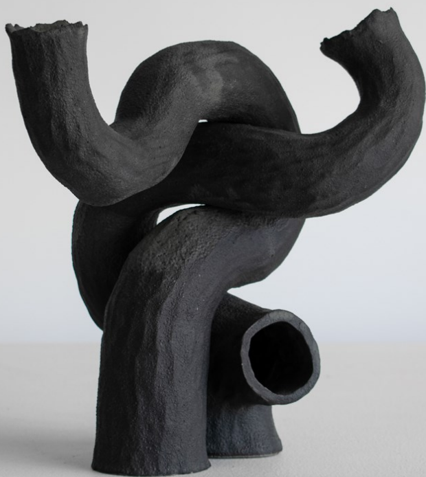
KERRY LEVY Entwined Pair #19.36/37 Australian stoneware, charcoal black glaze 33cm x 33cm x 25cm $1850