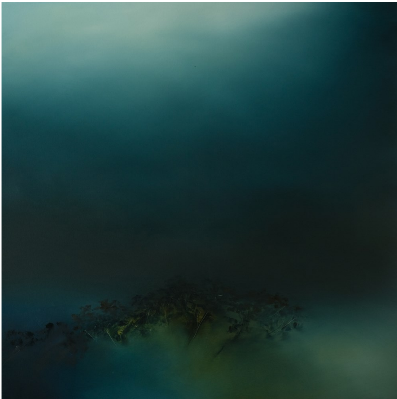
THERESA HUNT January on Fire Oil on canvas 122cm x 122cm $5200 Framed