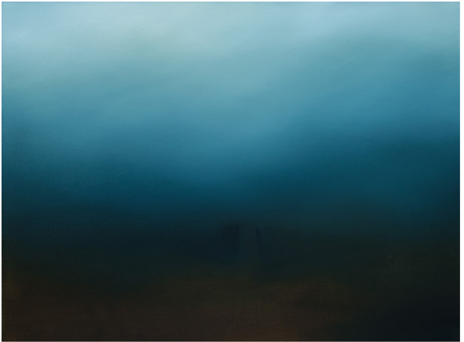
THERESA HUNT Somewhere in Leura Oil on canvas 92cm x 122cm $4500 Framed