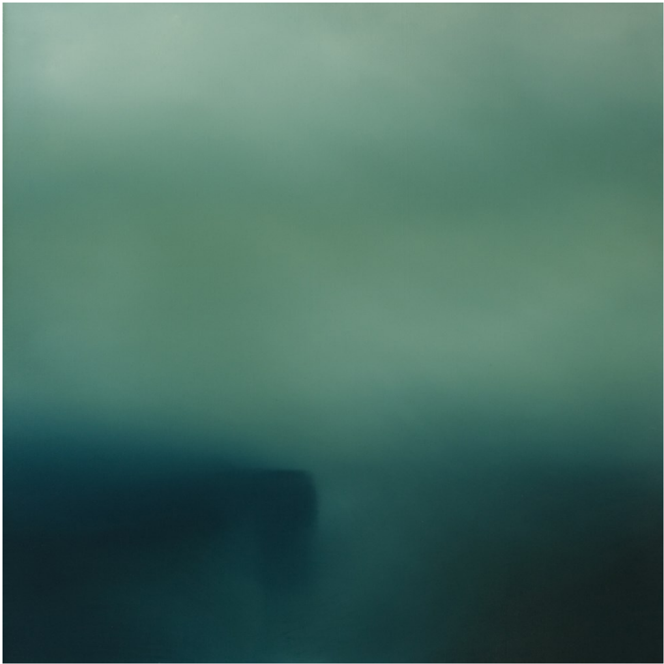
THERESA HUNT Uneven Light of Day Oil on linen 102cm x 102cm $4200 Framed