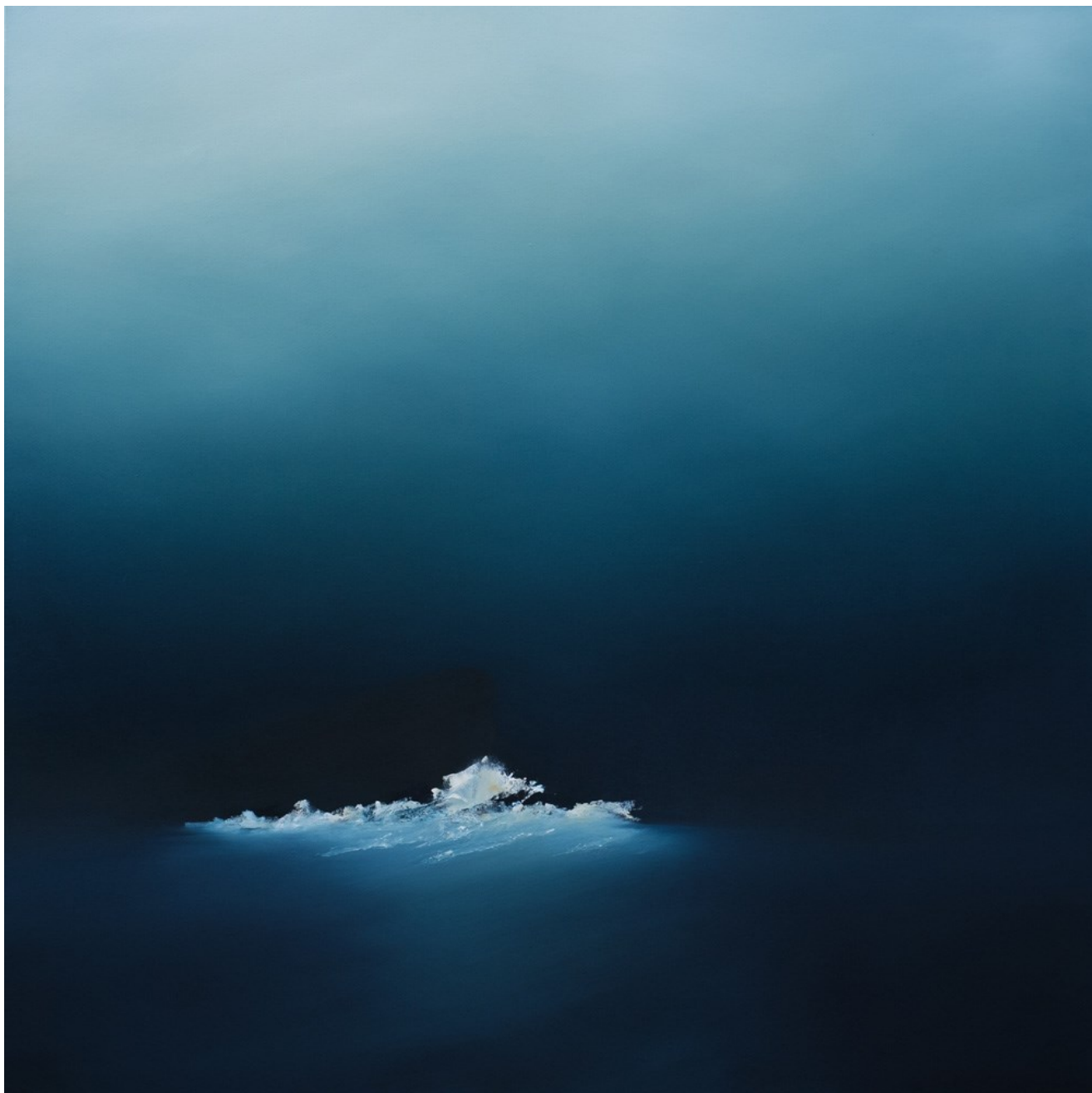
THERESA HUNT Avalon July 2020 Oil on canvas 152cm x 152cm $6500 Framed