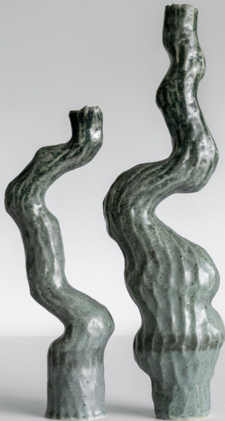
KERRY LEVY Asymmetry Pair #20.61/62 Australian stoneware, satin green glaze 40cm x 12cm x 7.5cm 30cm x 10cm x 6cm $1100