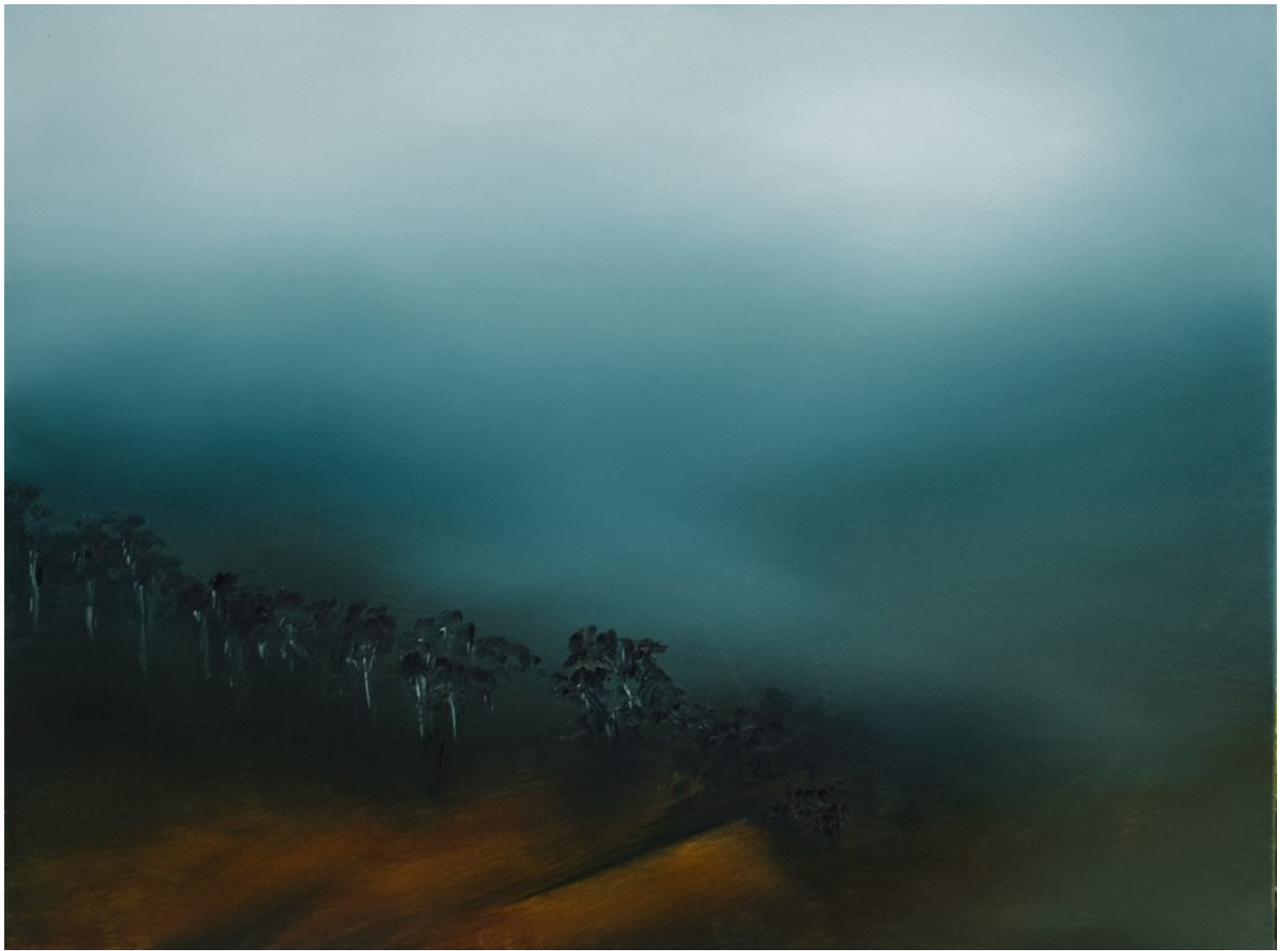
THERESA HUNT Valley Treeline Oil on canvas 92cm x 122cm $4500 Framed