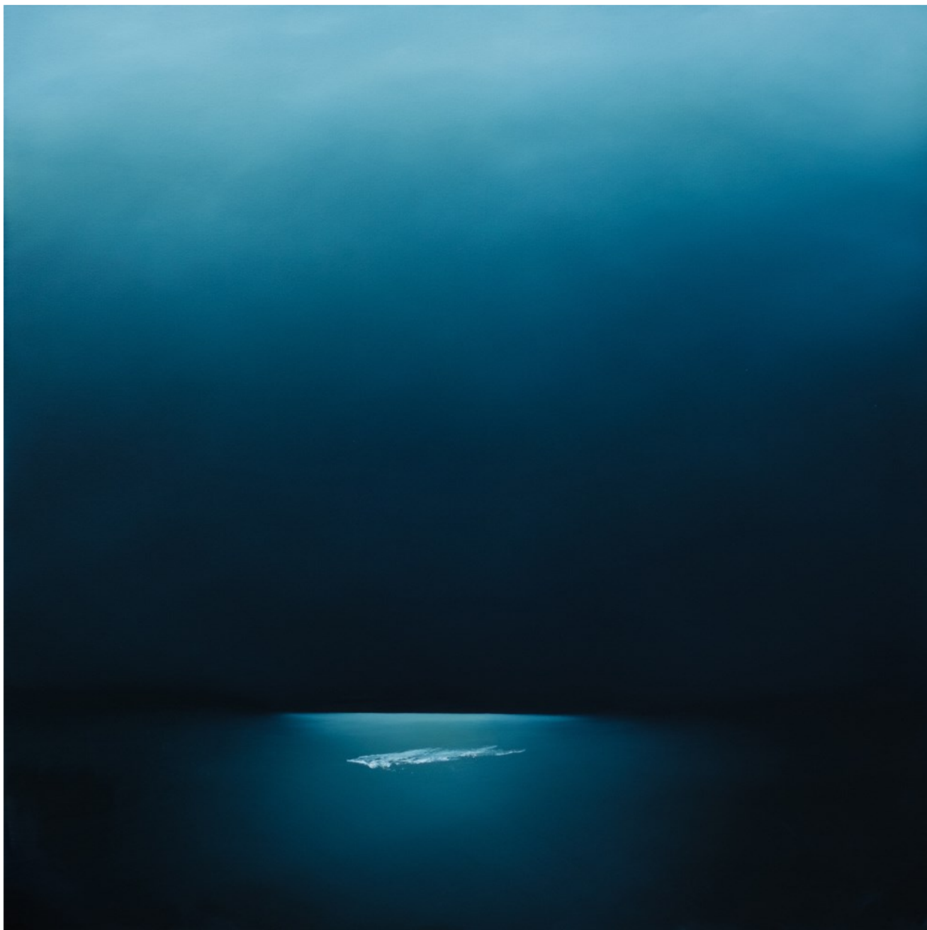
THERESA HUNT Waiting Wishing Oil on canvas 152cm x 152cm $6500 Framed