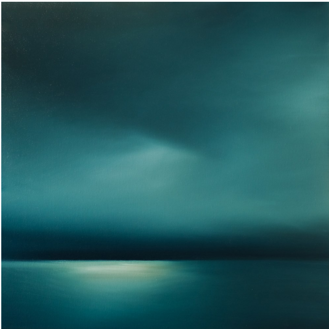
THERESA HUNT Winterlight Oil on canvas 47cm x 47cm $1950 Framed