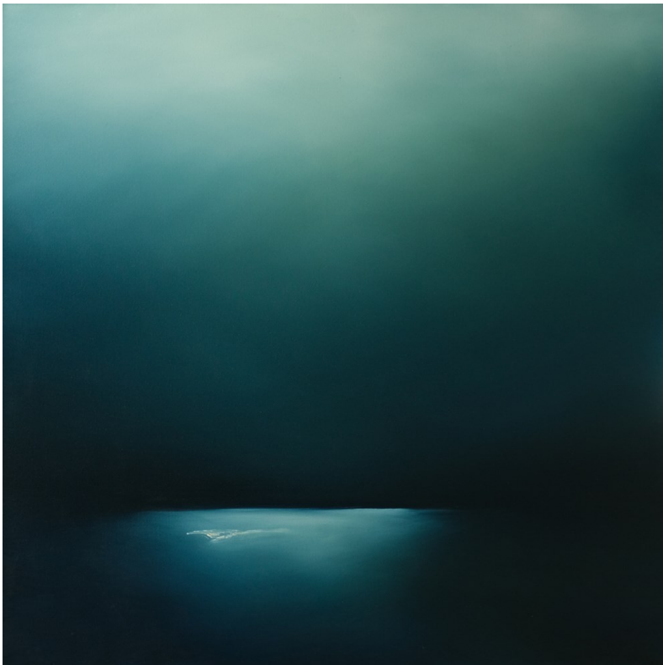
THERESA HUNT Under the Moonlight Oil on canvas 102cm x 102cm $4200 Framed