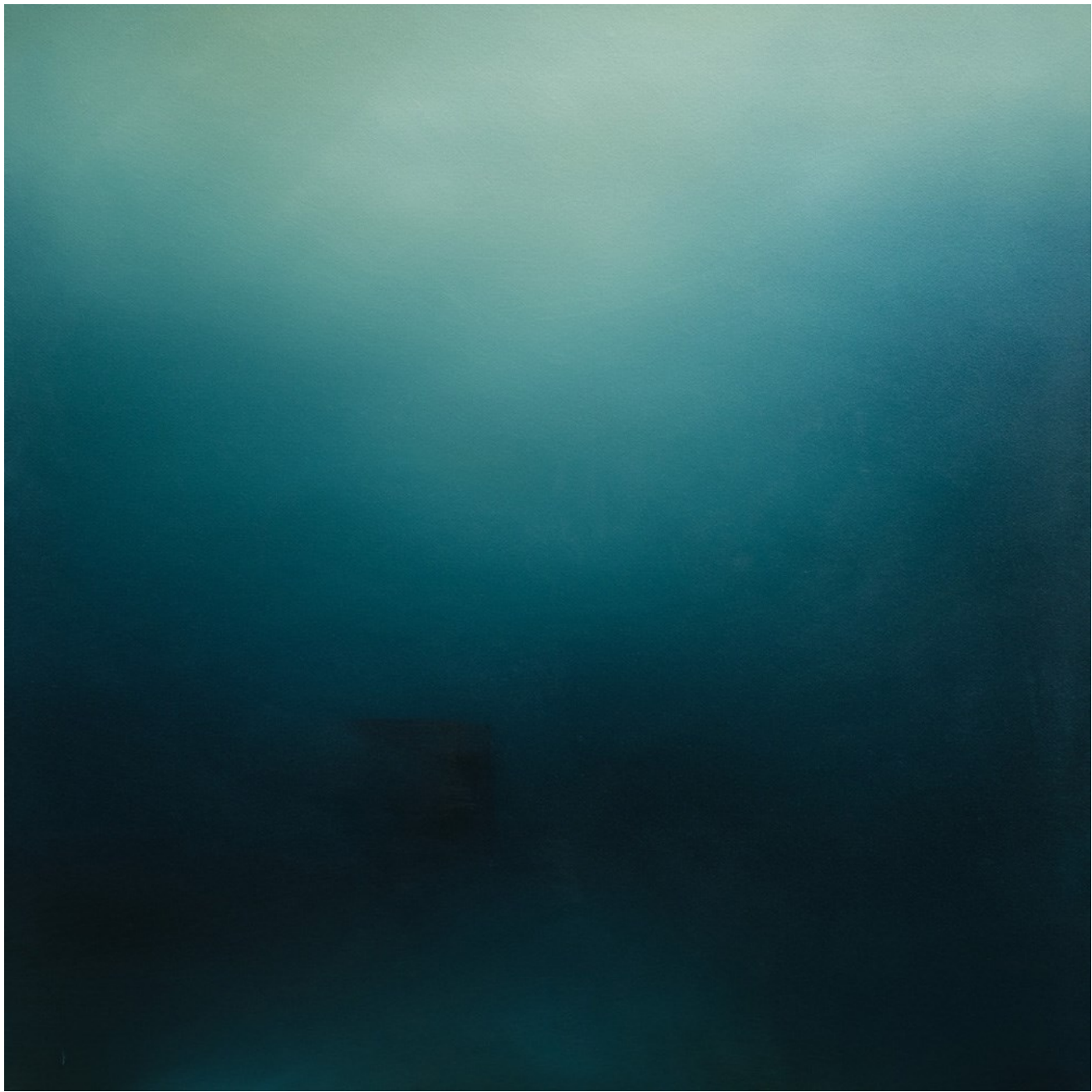
THERESA HUNT Through the Smoke Oil on canvas 122cm x 122cm $5200 Framed