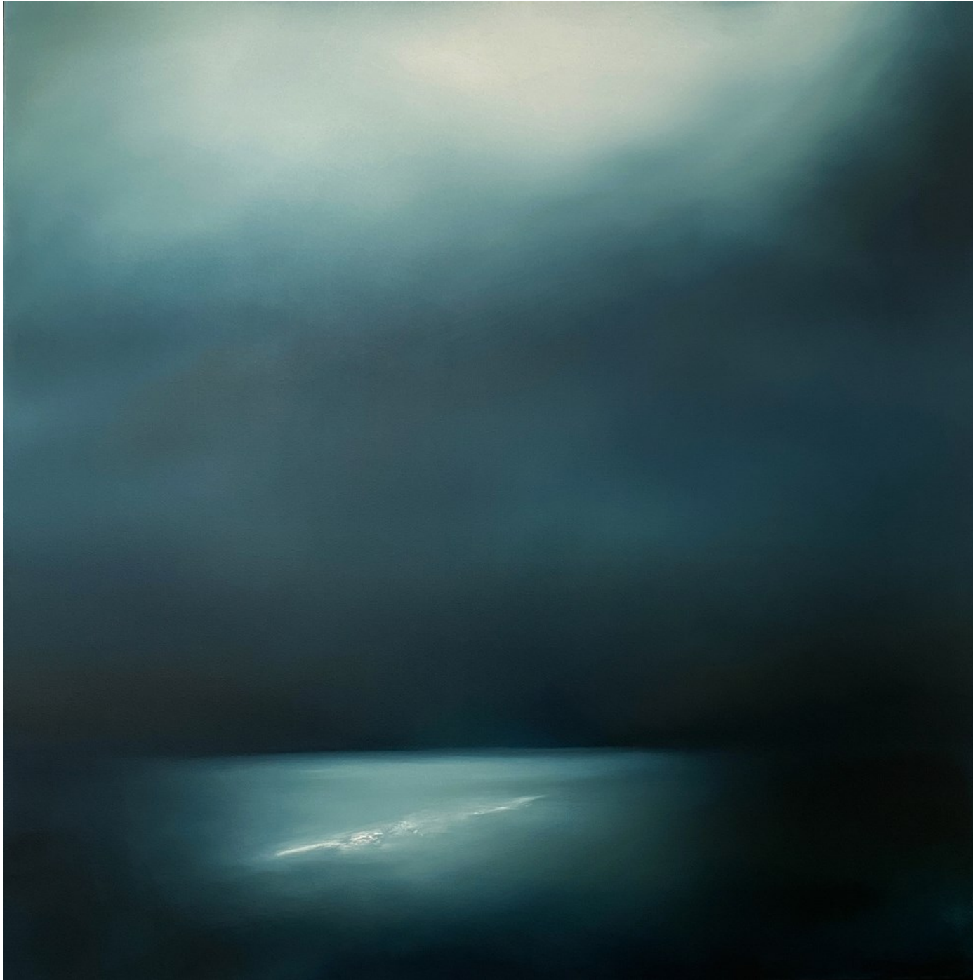
THERESA HUNT La Luna Oil on linen 152cm H x 152cm W Framed in dark wenge $6500