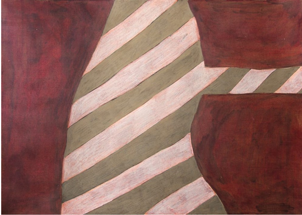
KERRIE OLIVER We Need to Move Together I Mixed media on Arches paper 59.5cm H x 76cm W Framed in raw Tasmanian oak with glass $2100