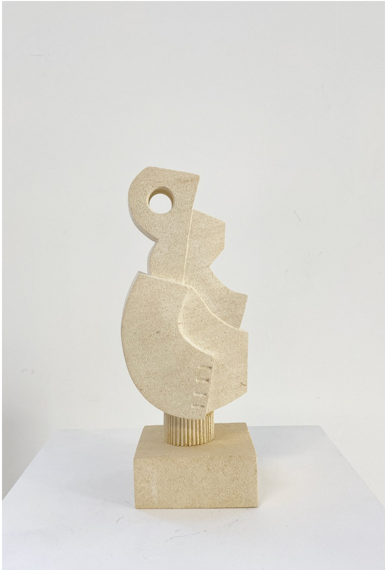
LUCAS WEARNE Form Study III Australian natural limestone 37cm H x 16.5cm W x 9.5cm D $700