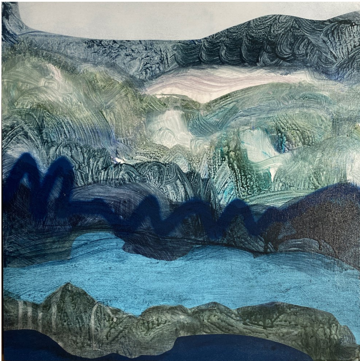
FLEUR STEVENSON Hawkesbury River in Blue Acrylic + spray paint on board 43.5cm H x 43.5cm W Framed in raw Tasmanian oak $950