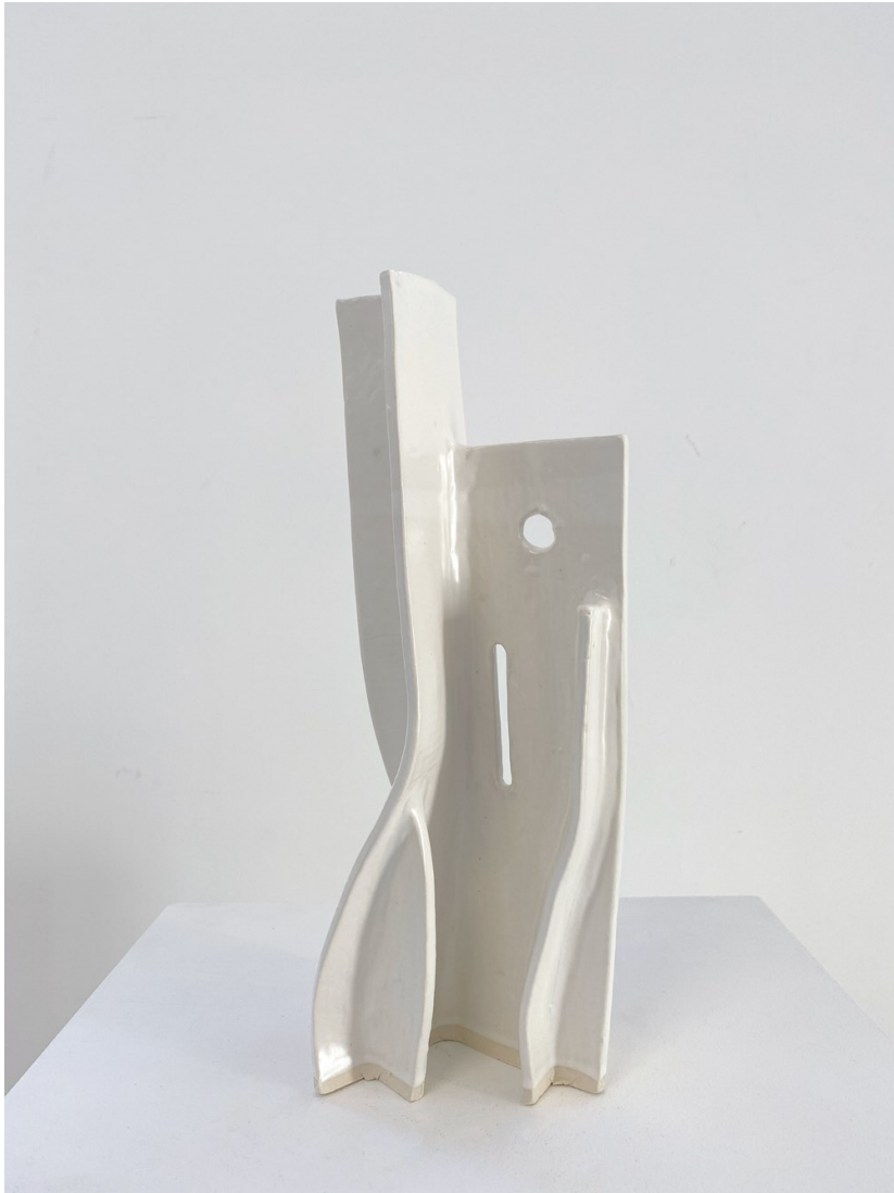
NATALIE ROSIN Maquette #20 White stoneware paper clay, white satin glaze 34cm H x 12cm W x 12cm D $620