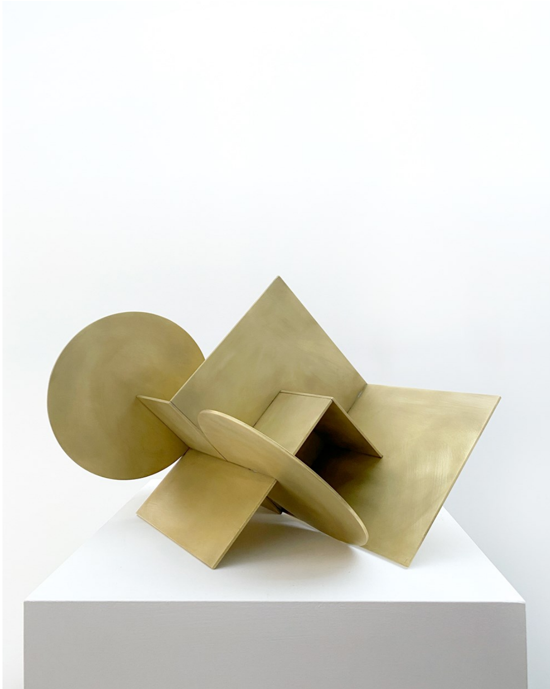
KATE BANAZI Space Between Coated Brass 40cm H x 40cm W x 30cm D Edition of 3 + 1 AP $4200