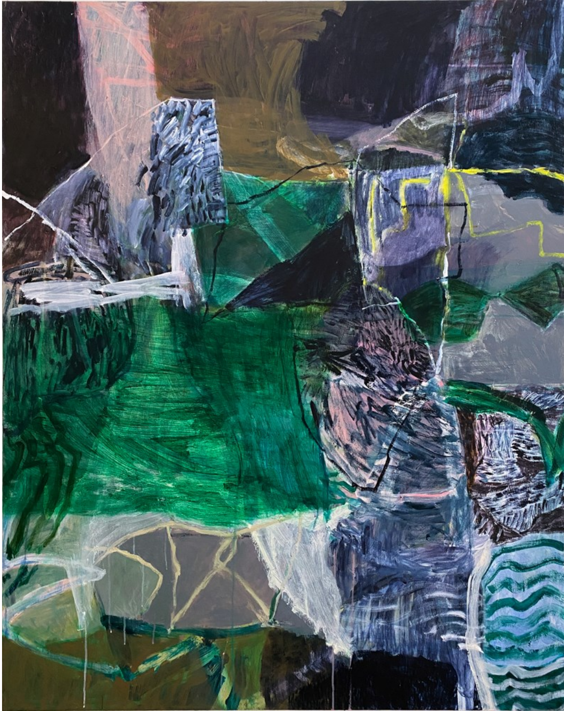
DIANA MILLER Epiphany Acrylic on board 150cm H x 120cm W $4500