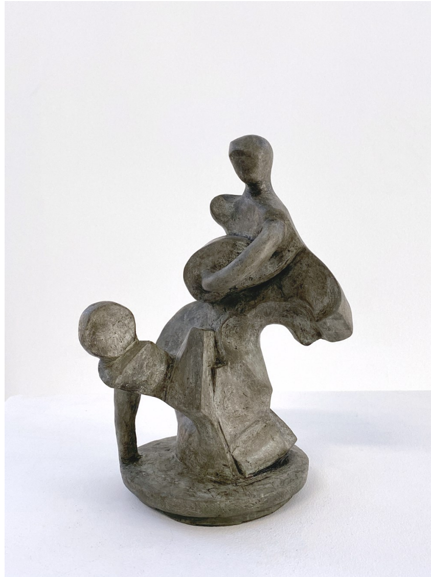
SCOTT McNEIL Theatre Types Dark stoneware 25cm H x 15cm W x 18cm D $1400