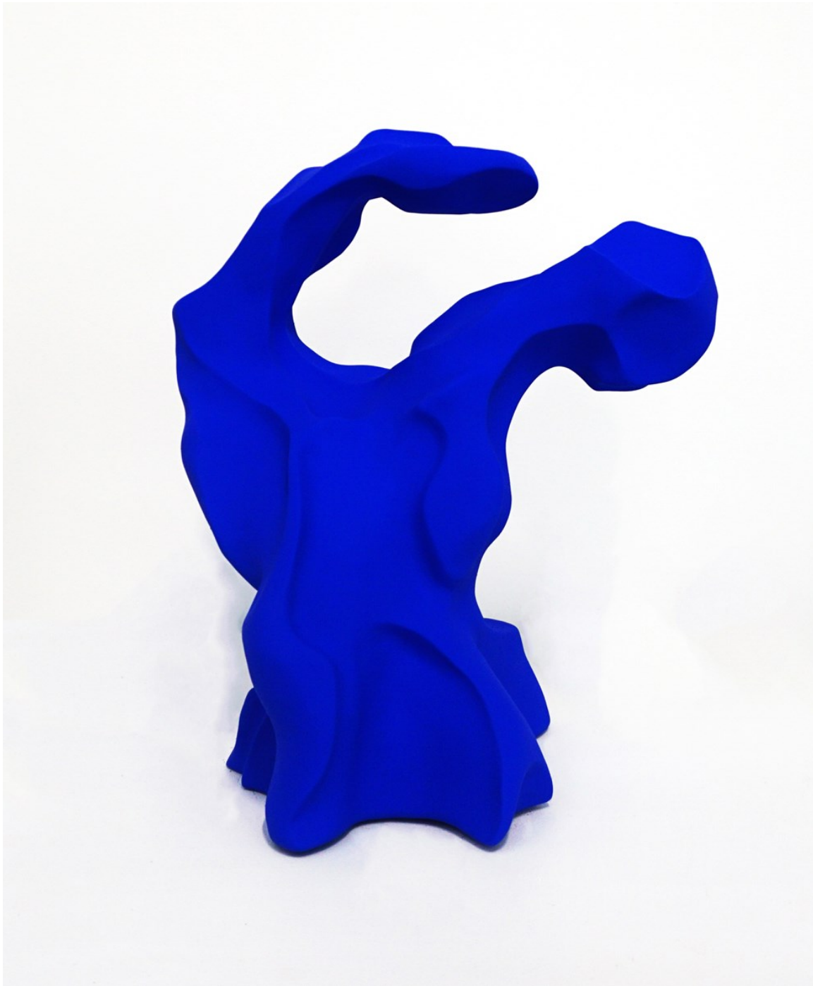
WILLIAM VERSACE Myth YKB Resin + pigment 33cm H x 30cm W x 22cm D Edition of 5 $2800