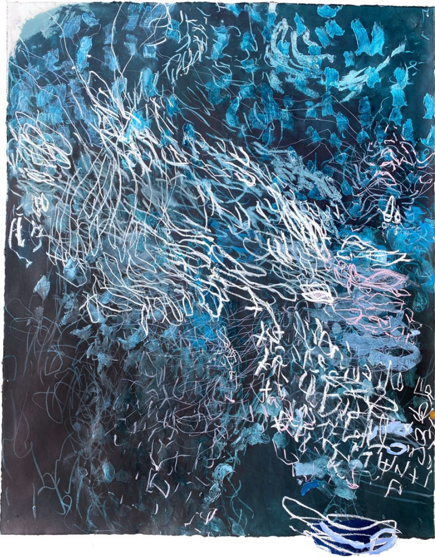
KATRINA O'BRIEN Cloudburst at The Reservoir Mixed media on Arches paper 148cm H x 127cm W Framed in raw Tasmanian oak with glass $4800