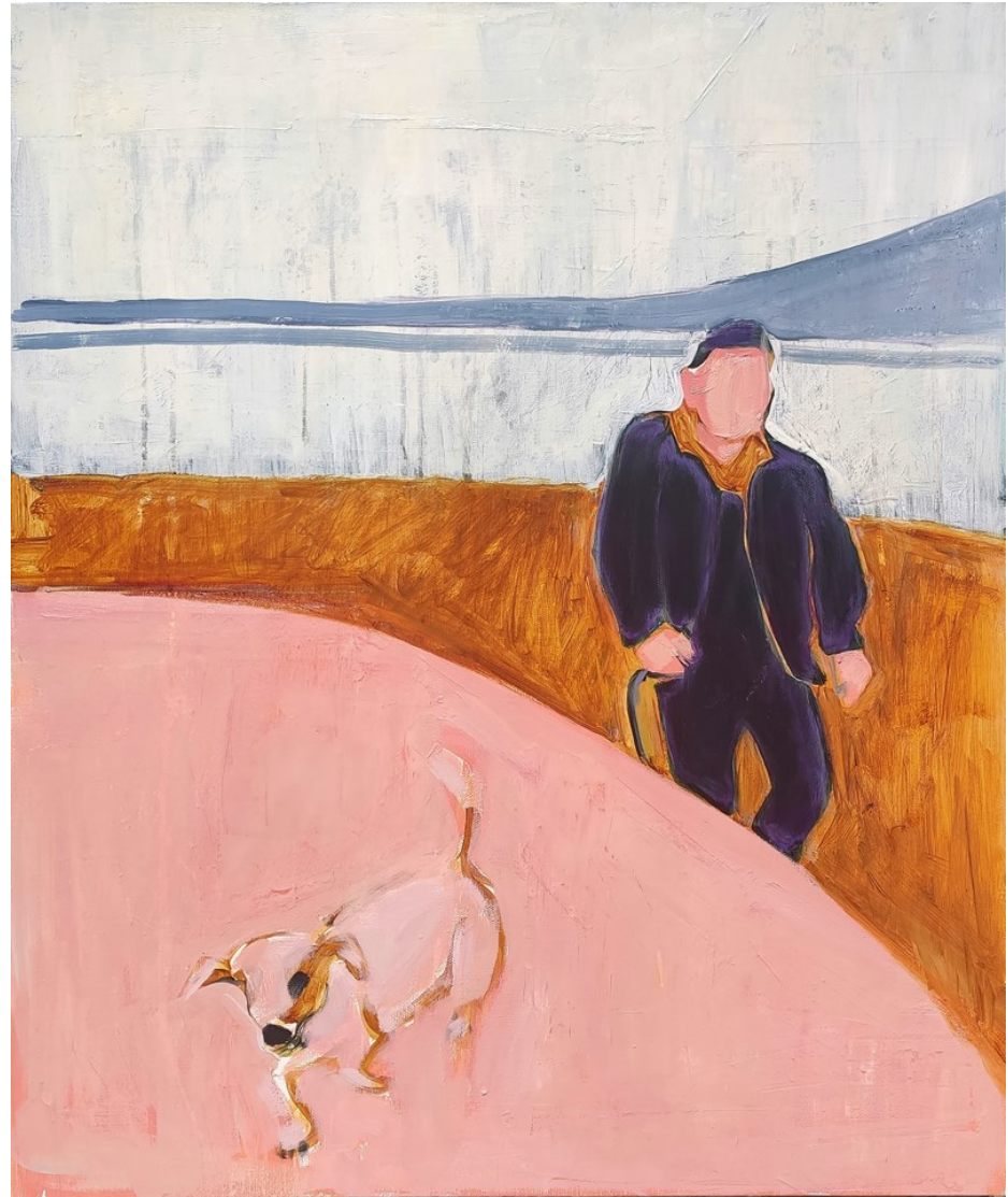
MARIA KOSTAREVA The Walk Oil on canvas 60cm H x 50cm W $1600