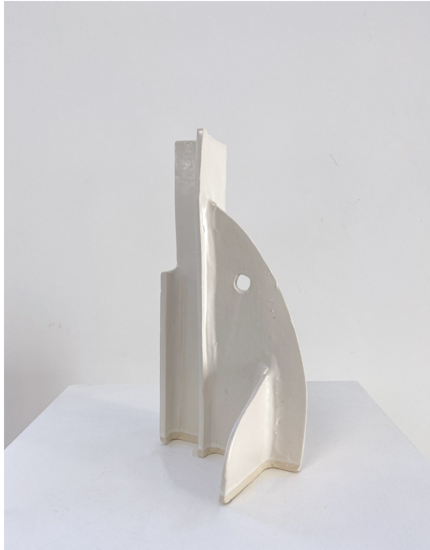
NATALIE ROSIN Maquette #19 White stoneware paper clay, white satin glaze 29cm H x 15cm W x 12cm D $540