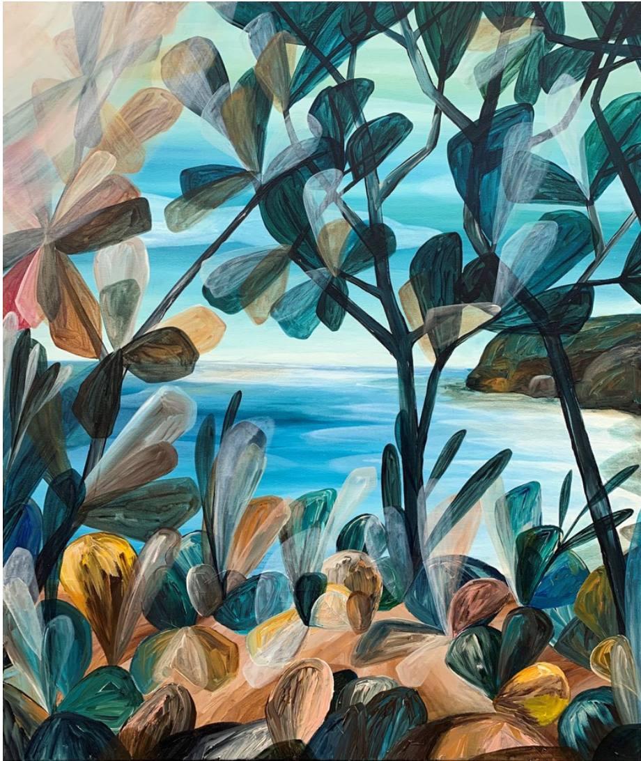
INGRID DANIELL Glimpse of hope, through the Shea Oaks Acrylic on cotton twill canvas 103cm H x 88cm W Framed in raw Tasmanian oak $2900