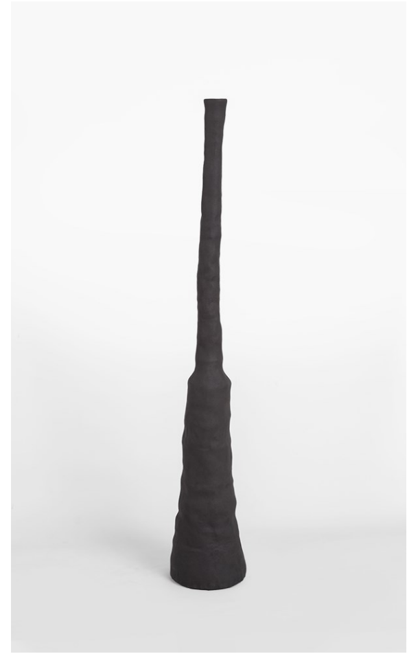
KARLIEN VAN ROOYEN Petrol Whistle Nude manganese stoneware 64.5cm H x 10cm W x 10cm D $800