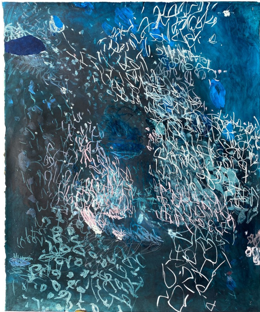
KATRINA O'BRIEN Unintended Echo (Chapter 35, Part 1) Mixed media on Arches paper 148cm H x 127cm W Framed in raw Tasmanian oak with glass $4800