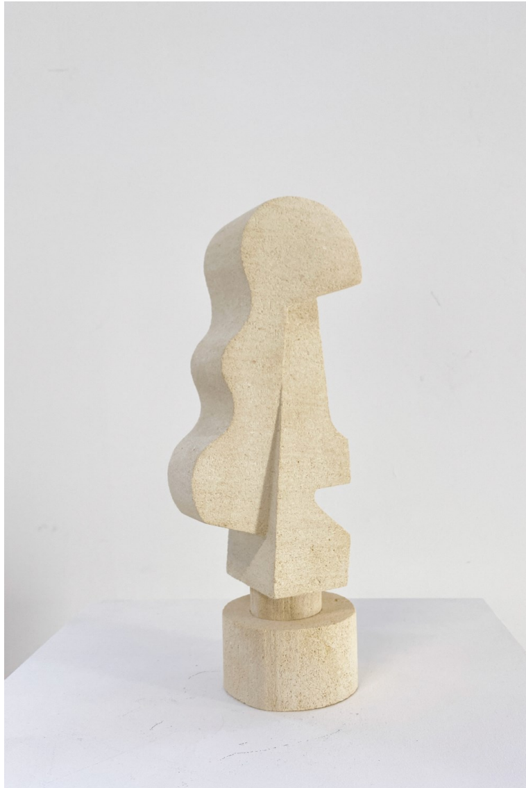
LUCAS WEARNE Form Study IV Australian natural limestone 37cm H x 10.5cm W x 10cm D $700