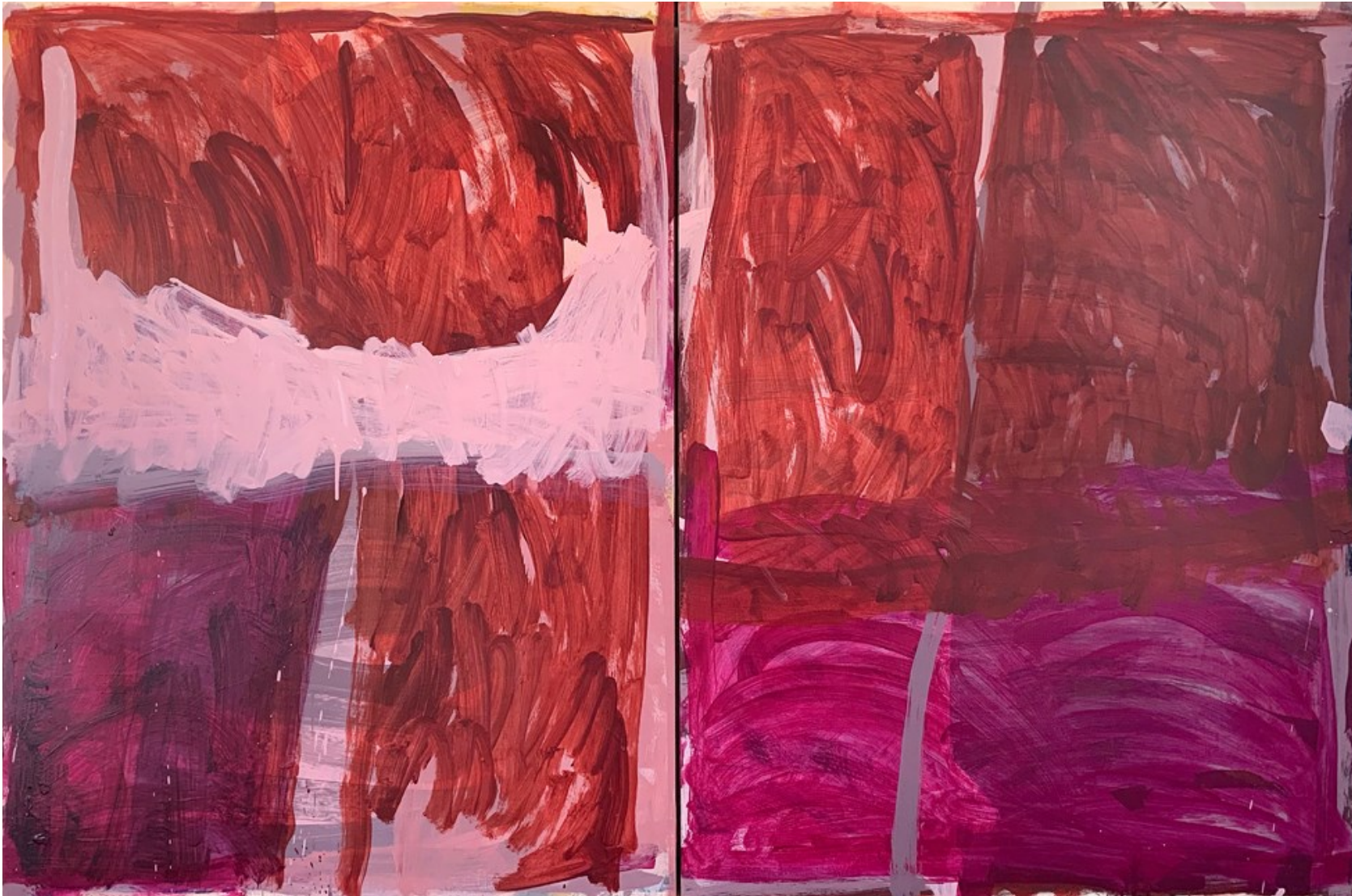
MONIQUE LOVERING The Odyssey Acrylic on board Diptych 105cm H x 156cm W Framed in raw Tasmanian oak $6000