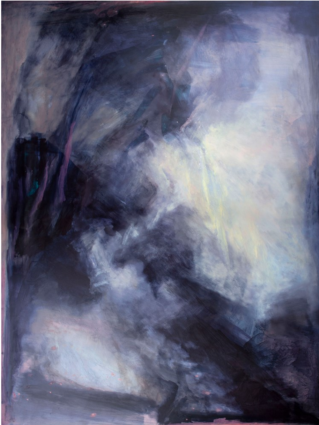
SUSIE DUREAU More Than This I Can't Explain Oil on polyester/cotton canvas 241.5cm H x 191.5cm W Framed in raw Tasmanian oak $15000