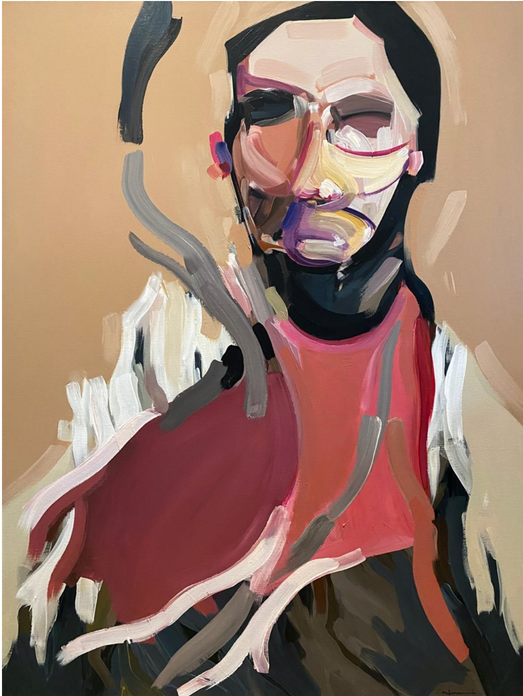
NUNZIO MIANO A New World Order Acrylic on canvas 105cm H x 80cm W Framed in dark wenge $4500