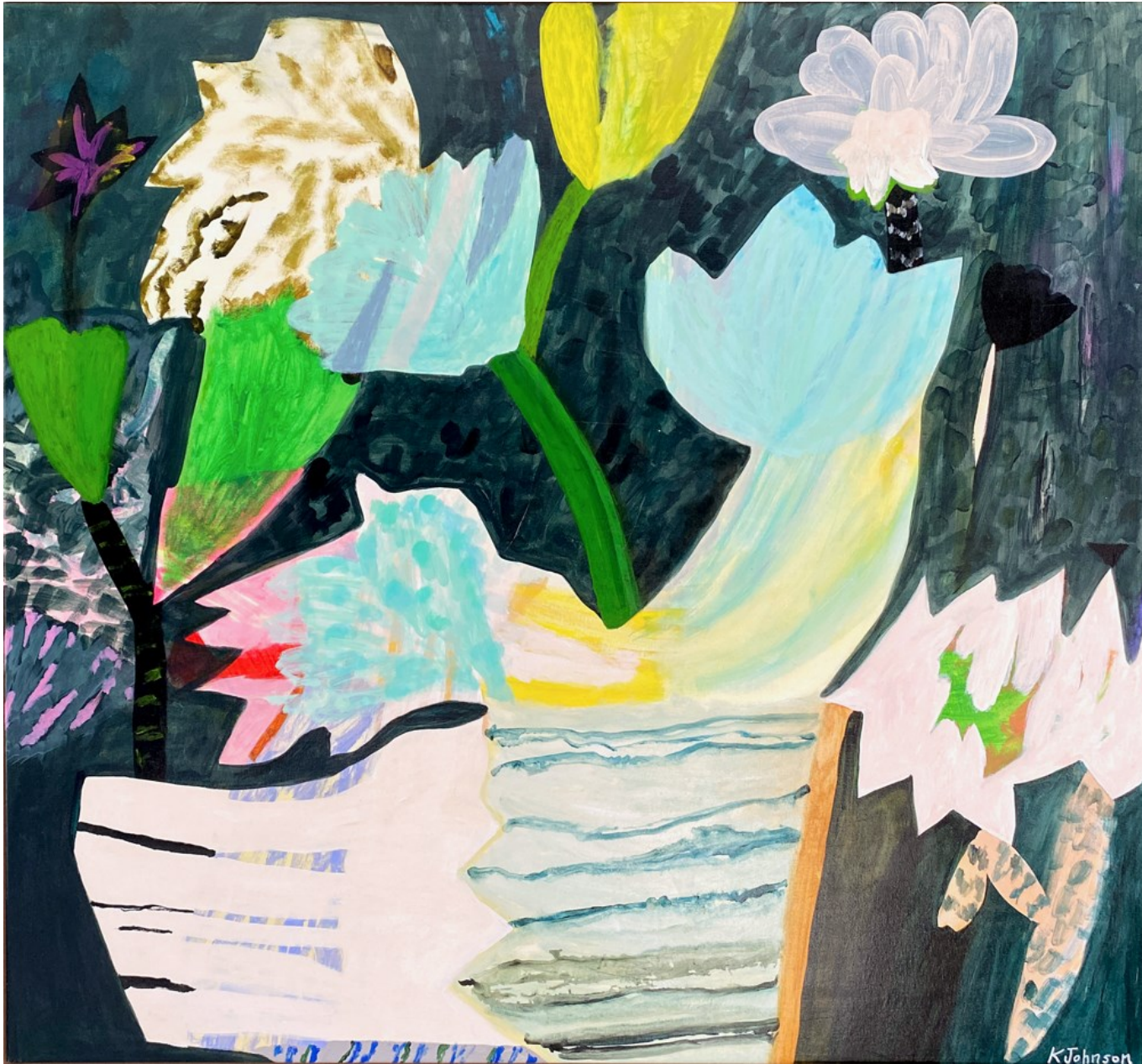
KAITLIN JOHNSON Spring Bulbs Acrylic on canvas 114.5cm H x 122cm W Framed in raw Tasmanian oak $3800