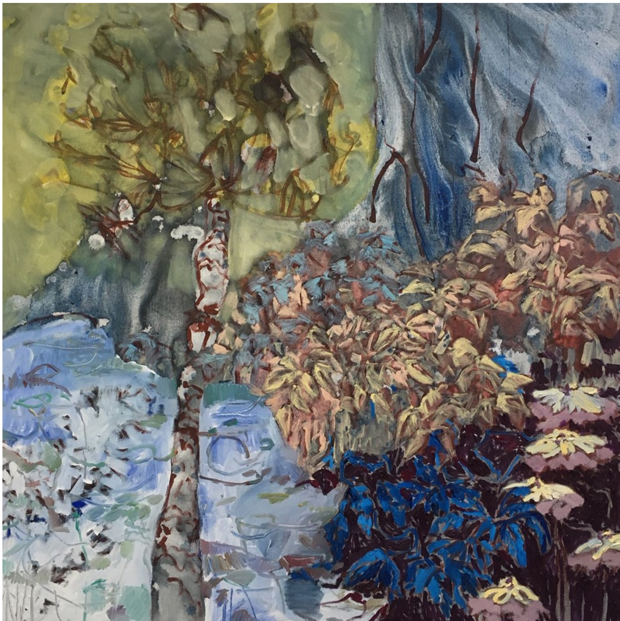
AMY WRIGHT The Tree of Secrets Mixed media on cotton canvas 123cm H x 123cm W Framed in American ash $4600