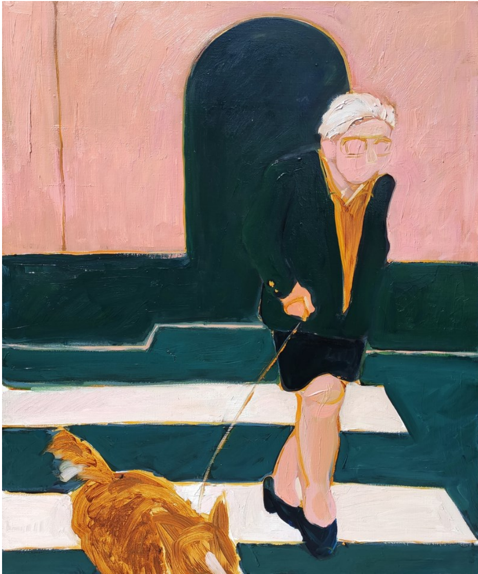
MARIA KOSTAREVA Morning in Rome Oil on canvas 60cm H x 50cm W $1600