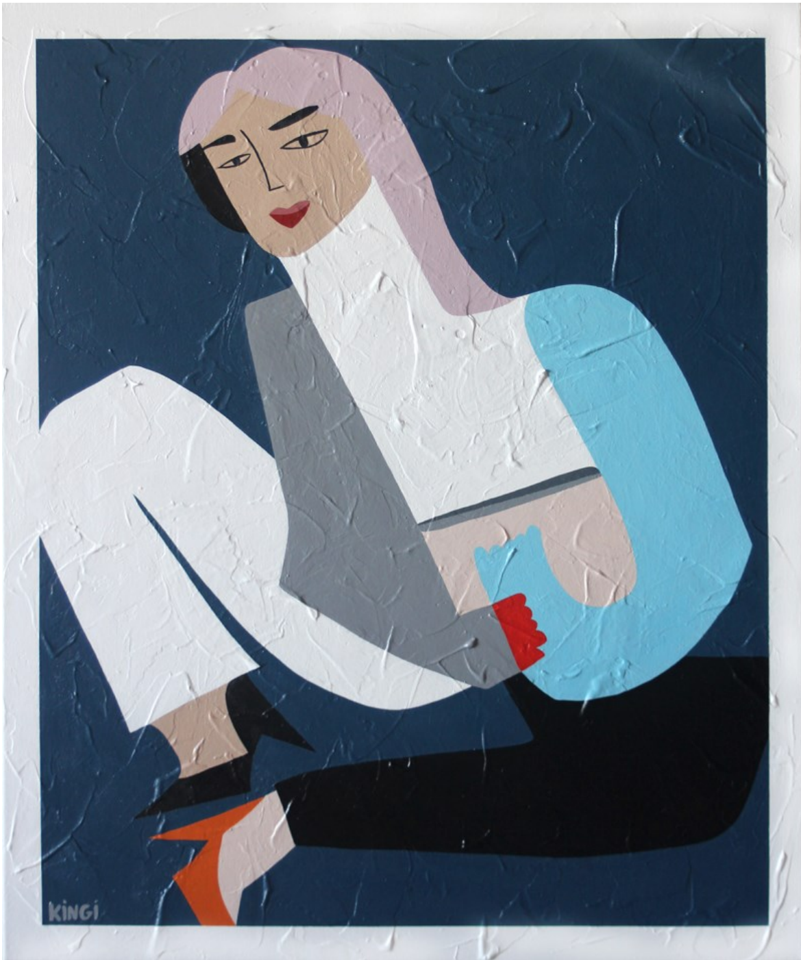
AMBER KINGI Darla Acrylic on canvas 60cm H x 50cm W $1350