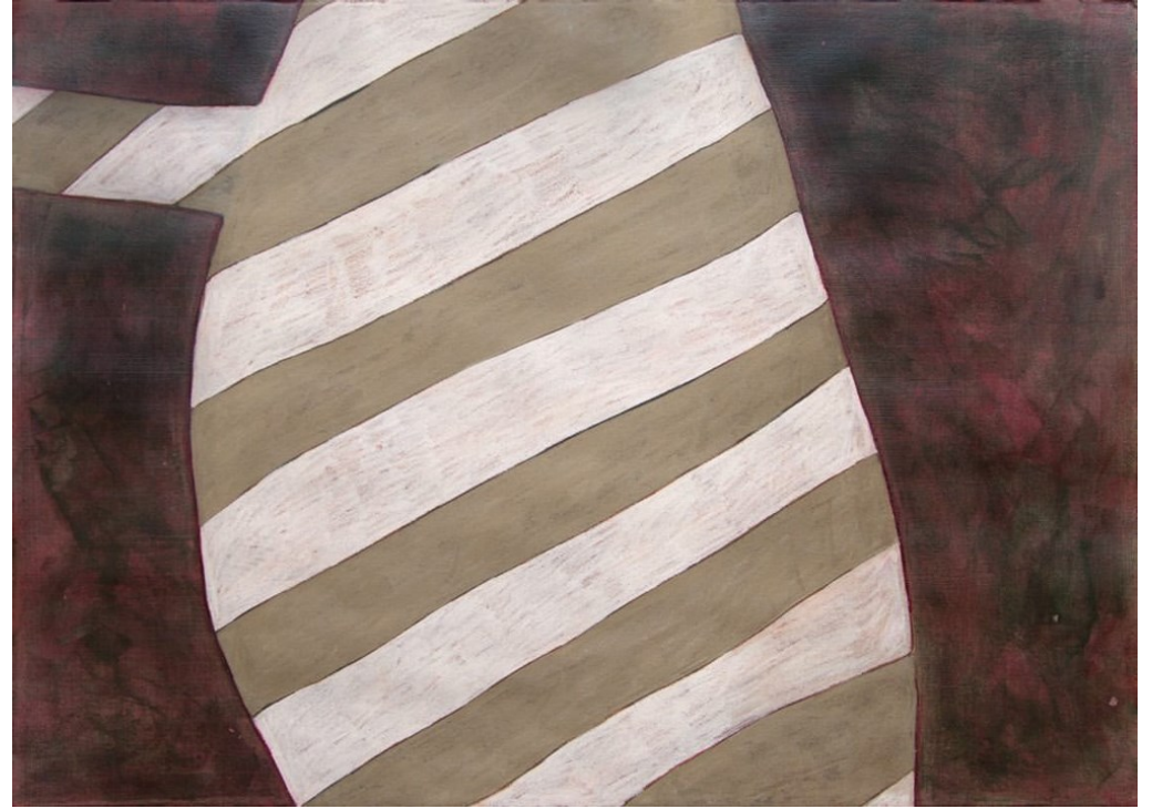
KERRIE OLIVER We Need to Move Together II Mixed media on Arches paper 59.5cm H x 76cm W Framed in raw Tasmanian oak with glass $2100