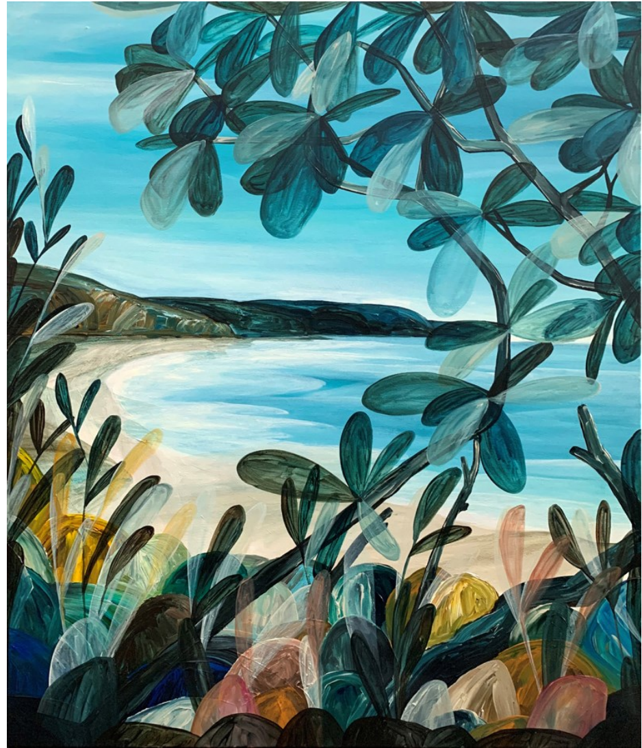
INGRID DANIELL Sublime beach days, full of hope Acrylic on cotton twill canvas 103cm H x 88cm W Framed in raw Tasmanian oak $2900