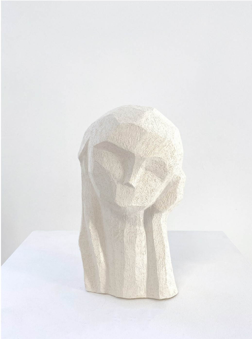
KRISTIINA HAATAJA Marta Off white stoneware 25cm H x 16cm W x 10cm D $1400