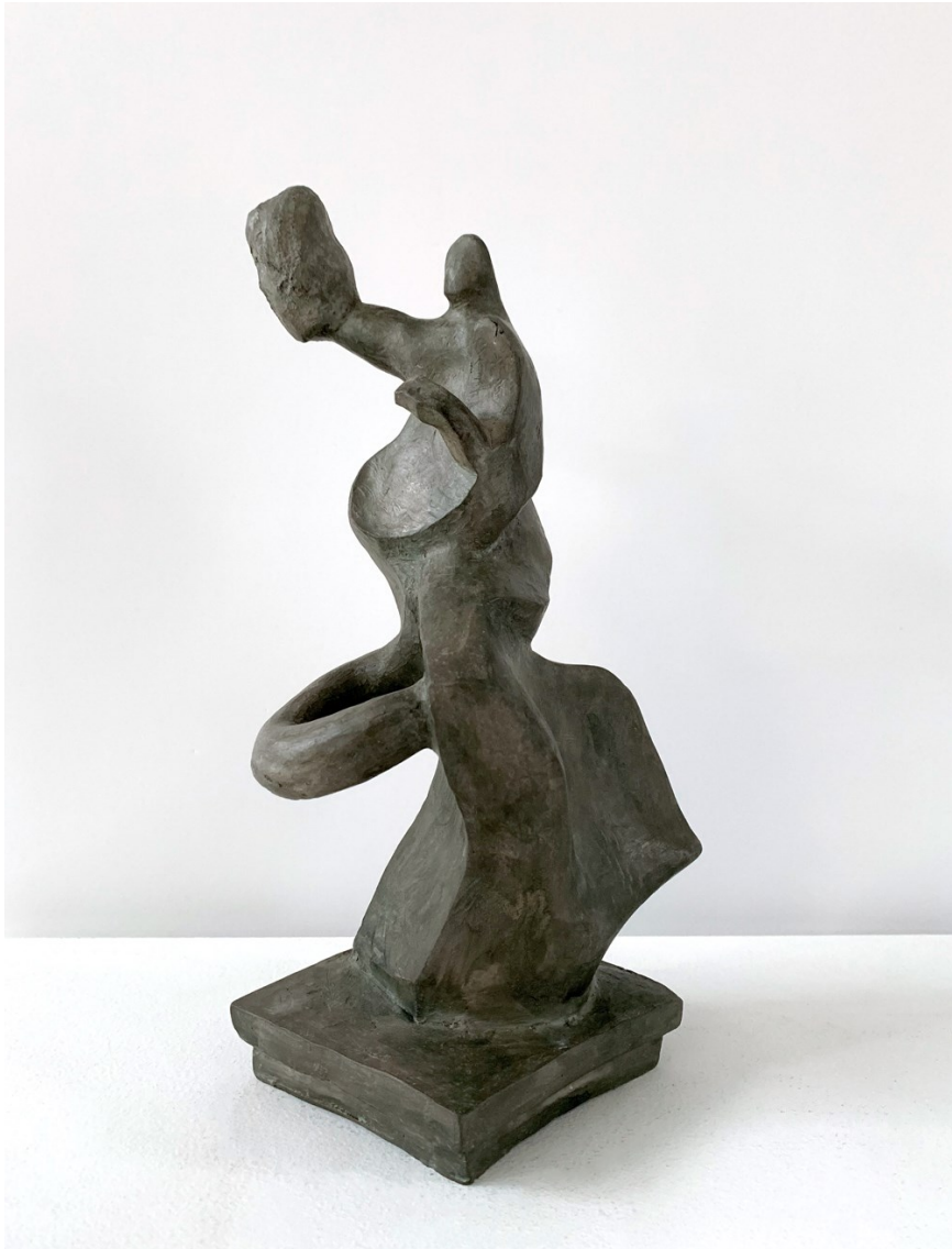
SCOTT McNEIL Victory Dark stoneware 24cm H x 9cm W x 10cm D $1400