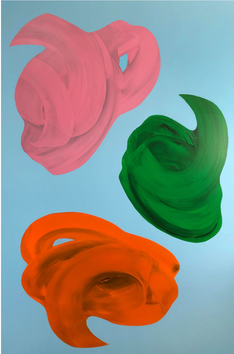
BARBARA KITALLIDES Aperitivo Hour Acrylic on canvas 181cm H x 121cm W Framed in black woodgrain $9000